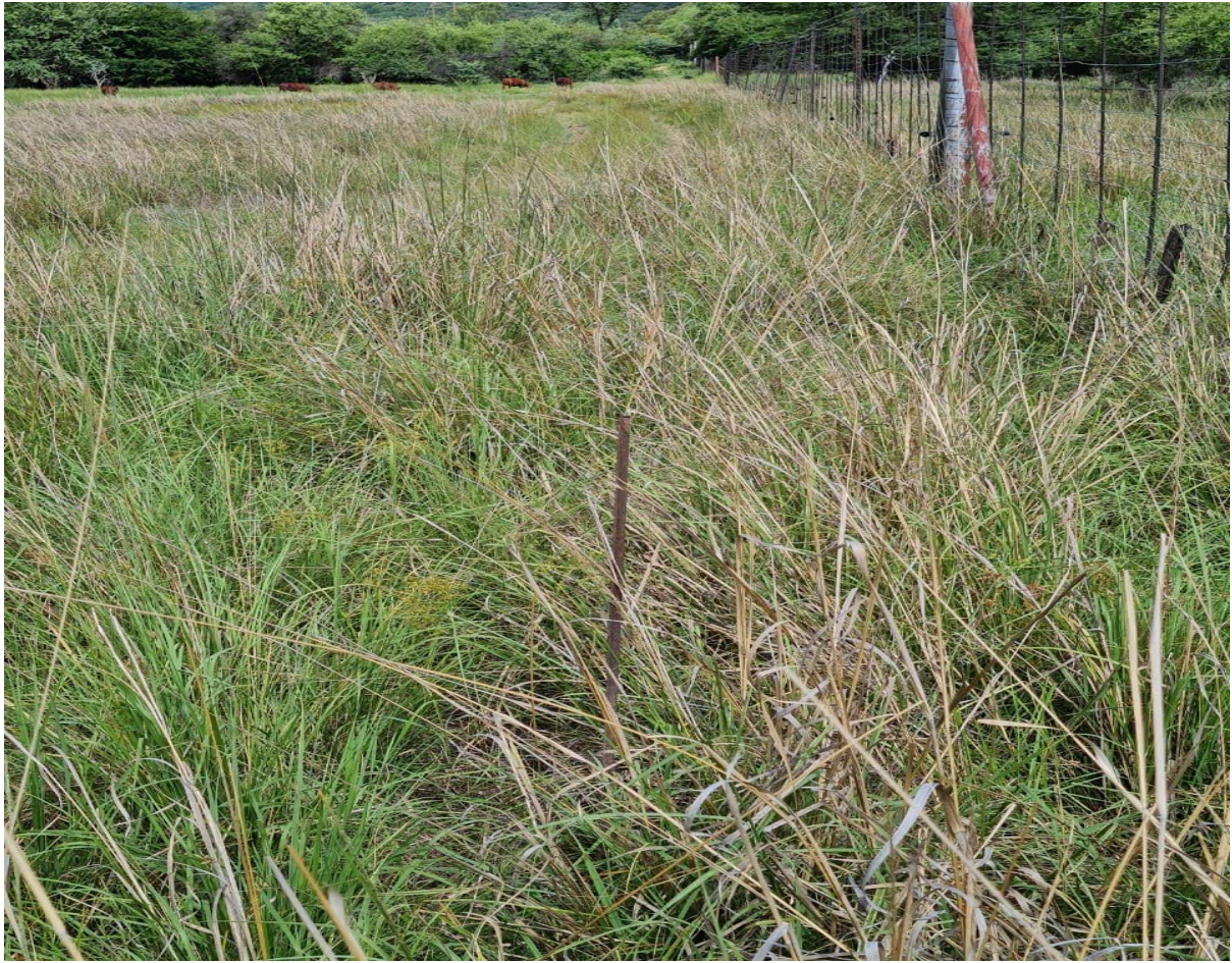
Figure 4: Proposed pole position