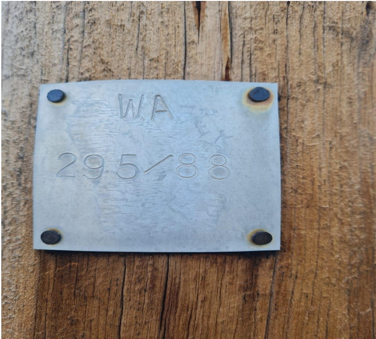
Figure 1: Existing line which the new line will be connected from