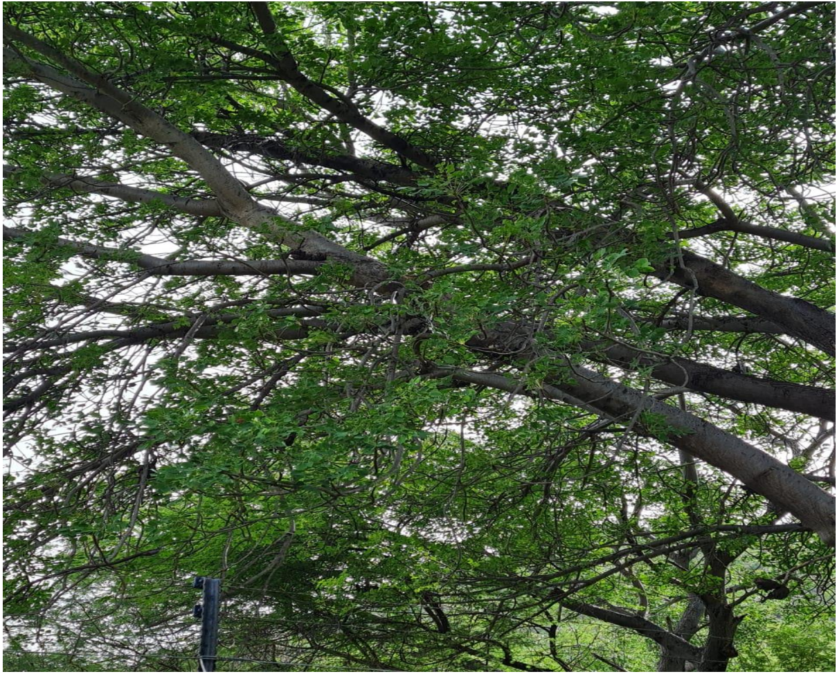
Figure 3: Another vegetation type in the study area