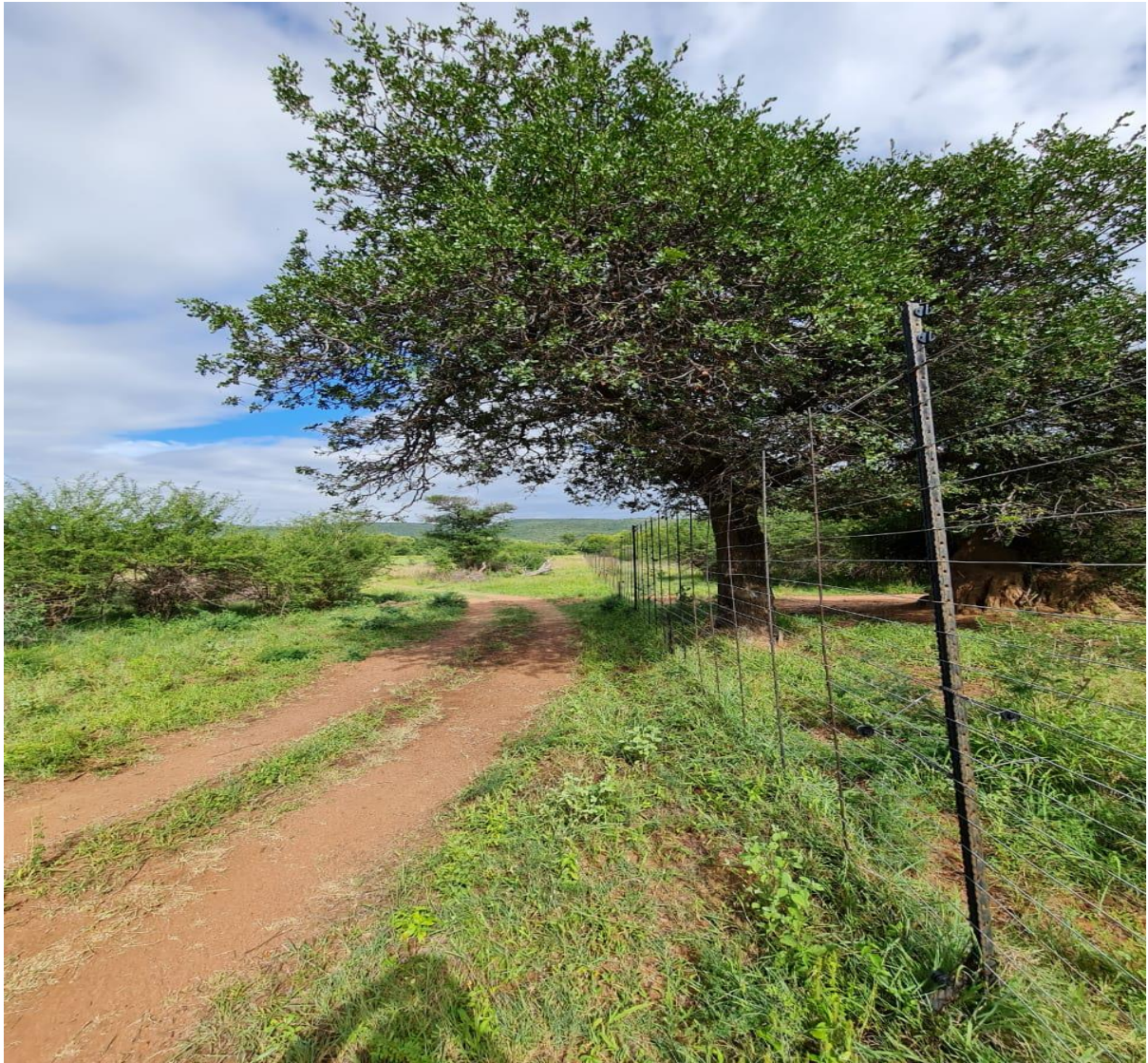
Figure 2: Vegetation type in the study area