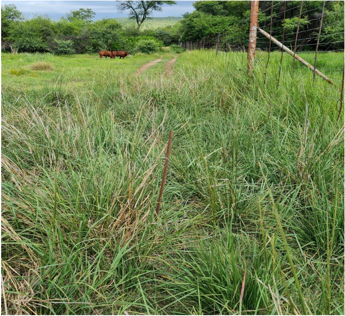
Figure 5: Another pole position