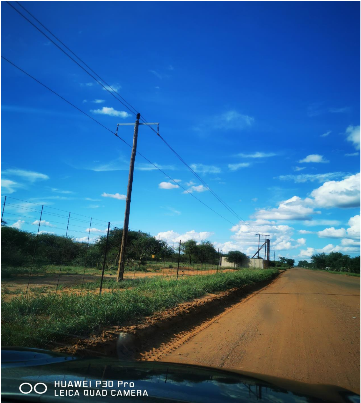
Figure 7: Existing electricity in the proposed area