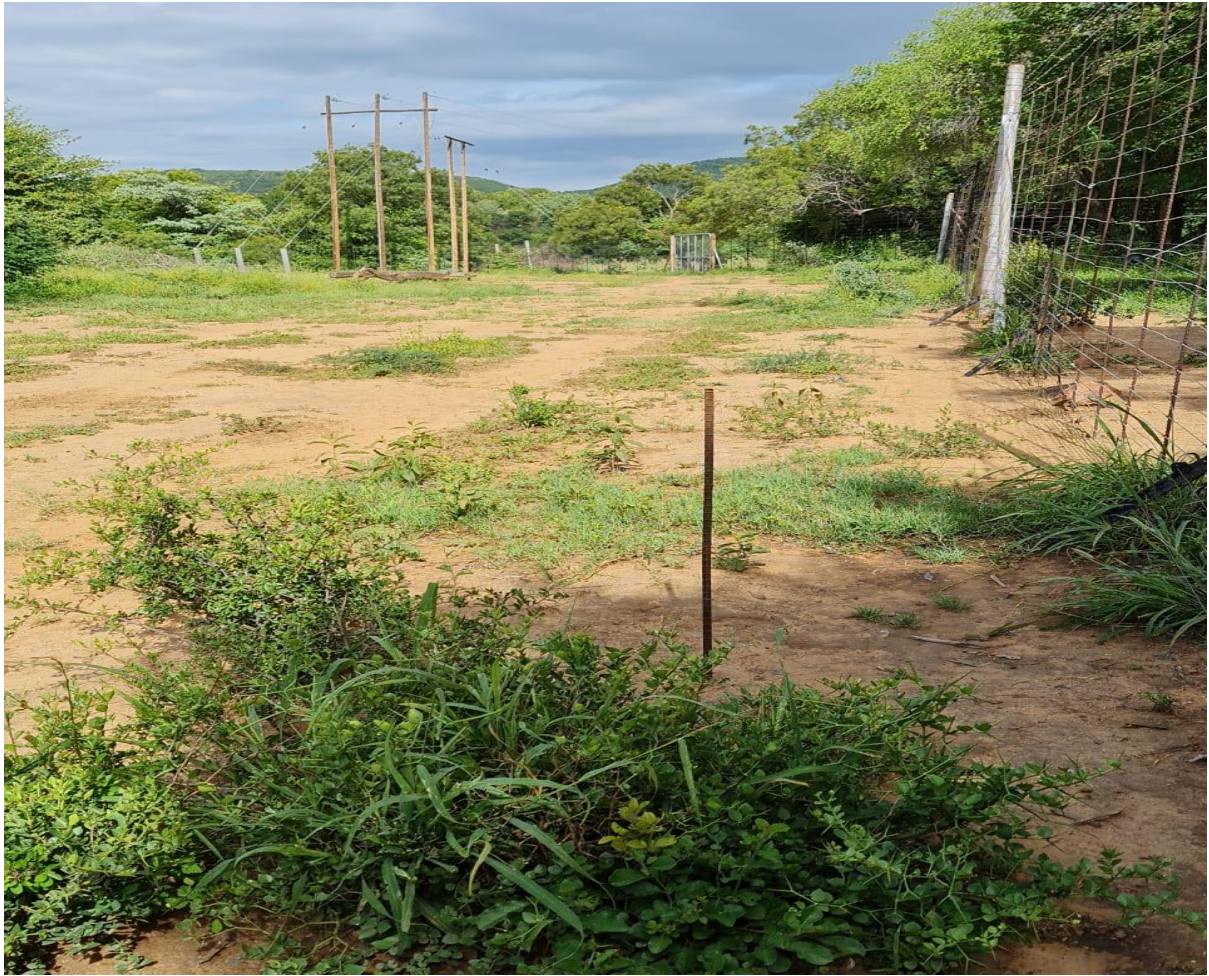
Figure 6: Another pole position