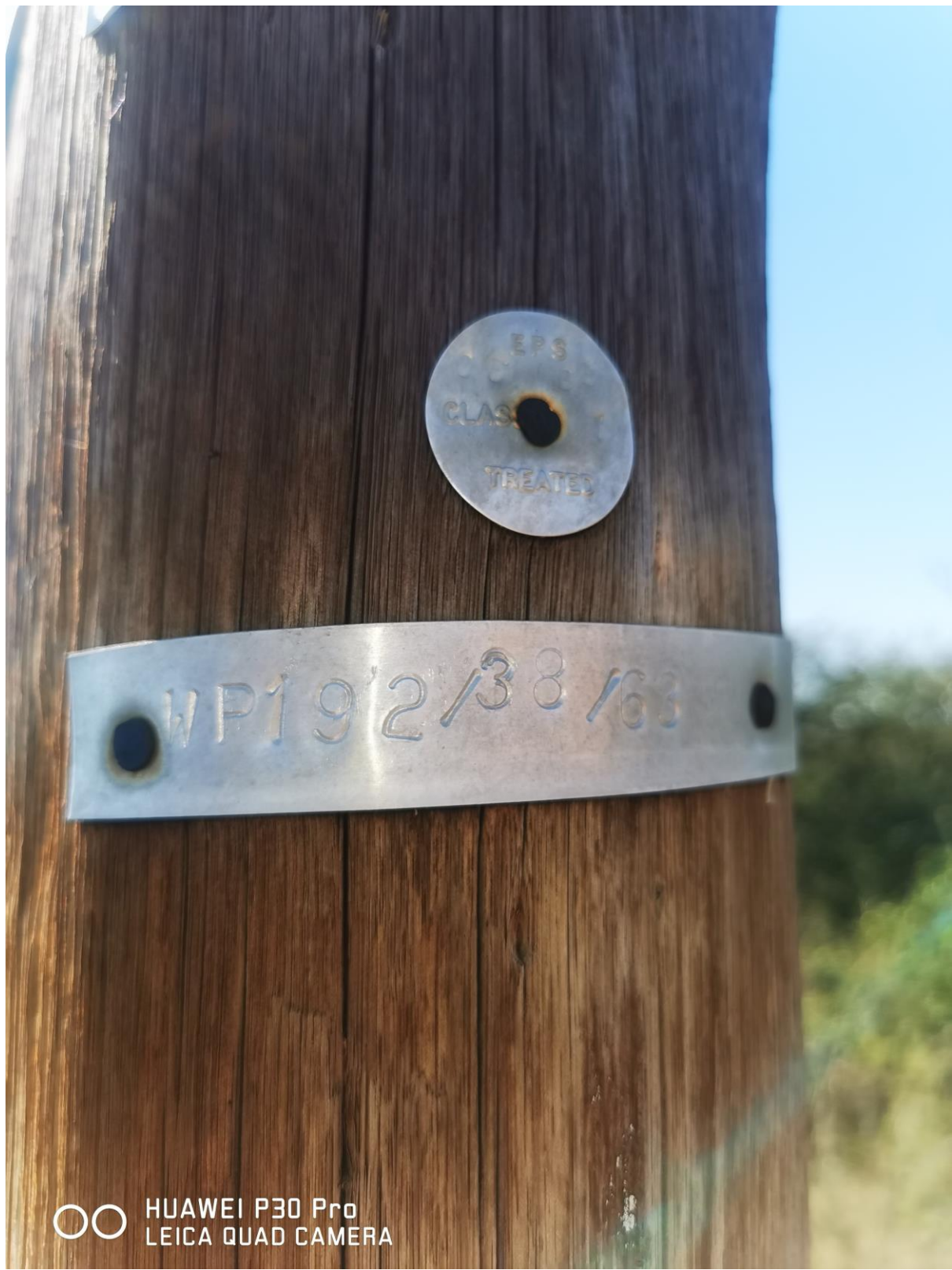
Figure 1: Existing line where the proposed line will be connected from