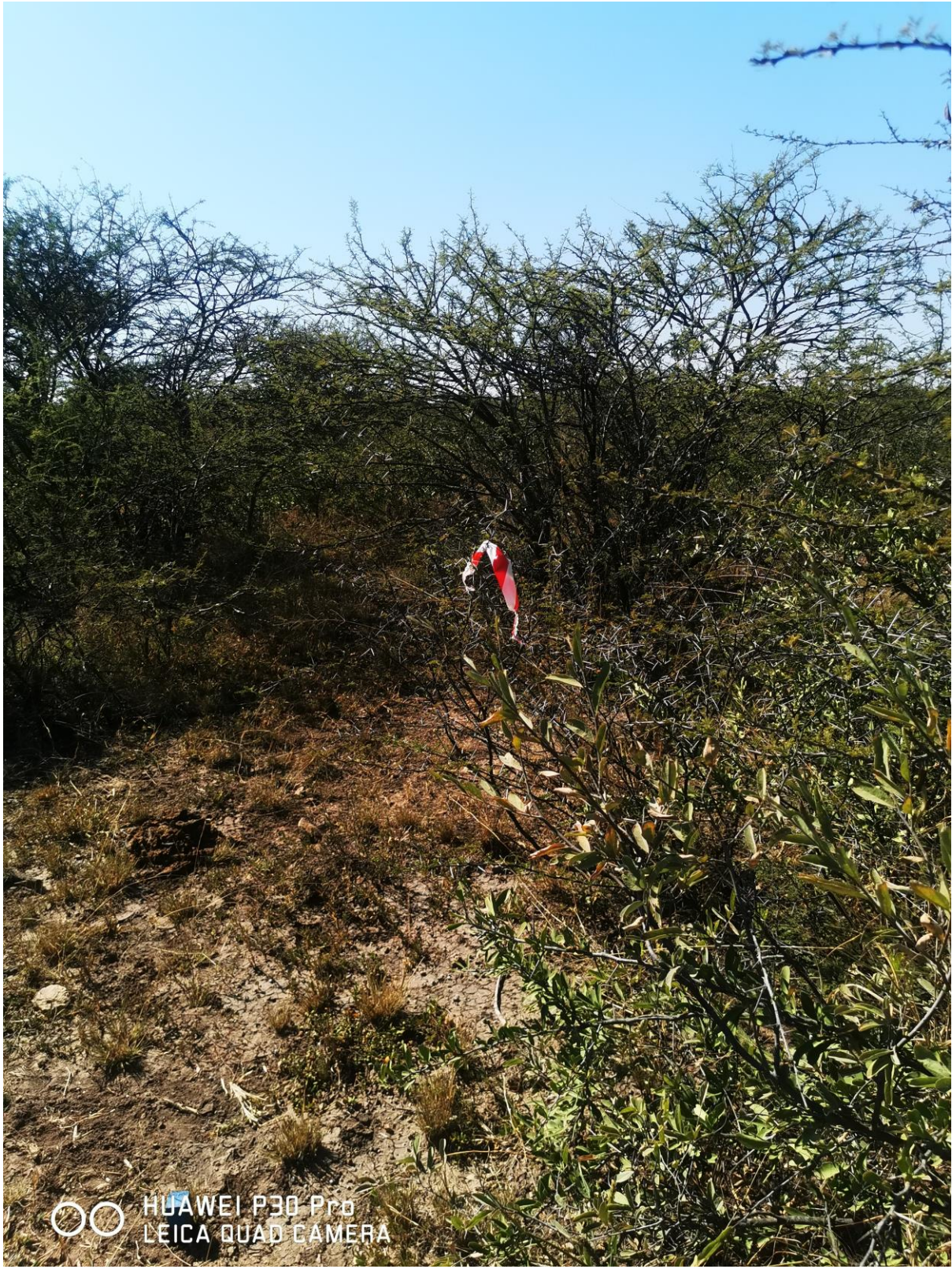
Figure 3: Picture showing pole position of the project area