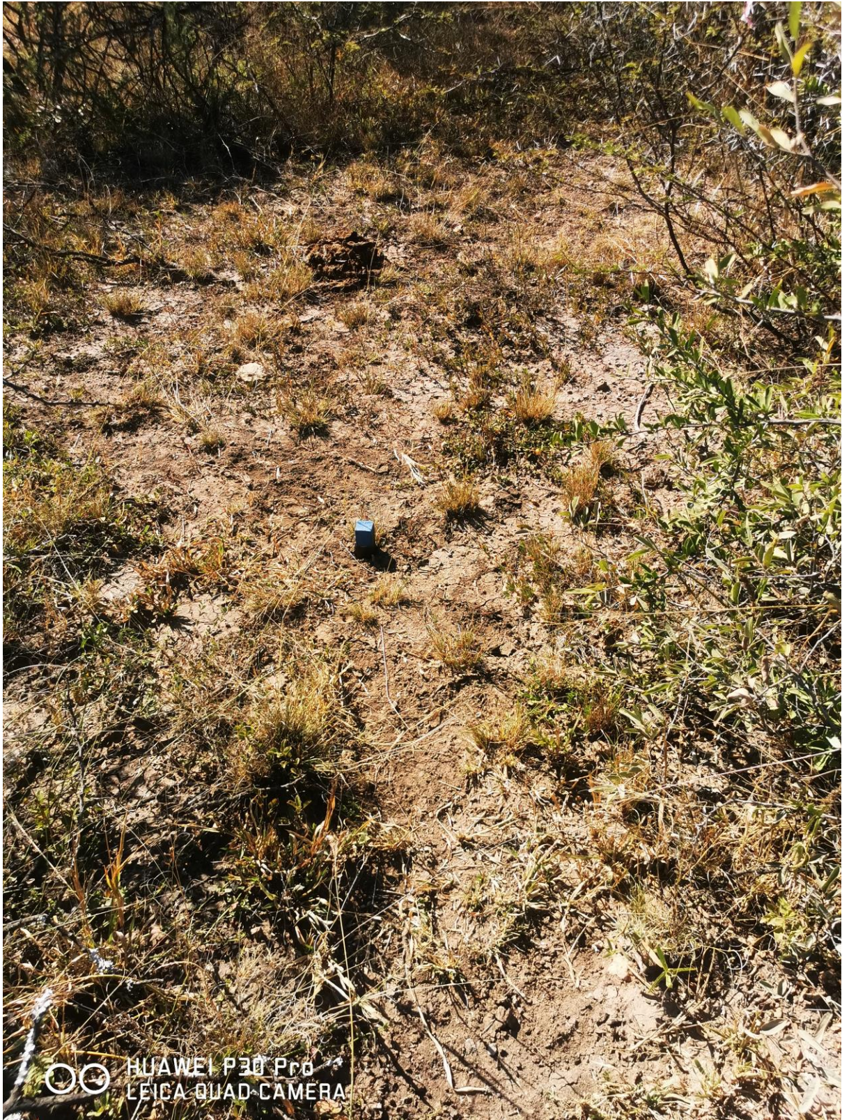
Figure 4: Another picture showing proposed pole position