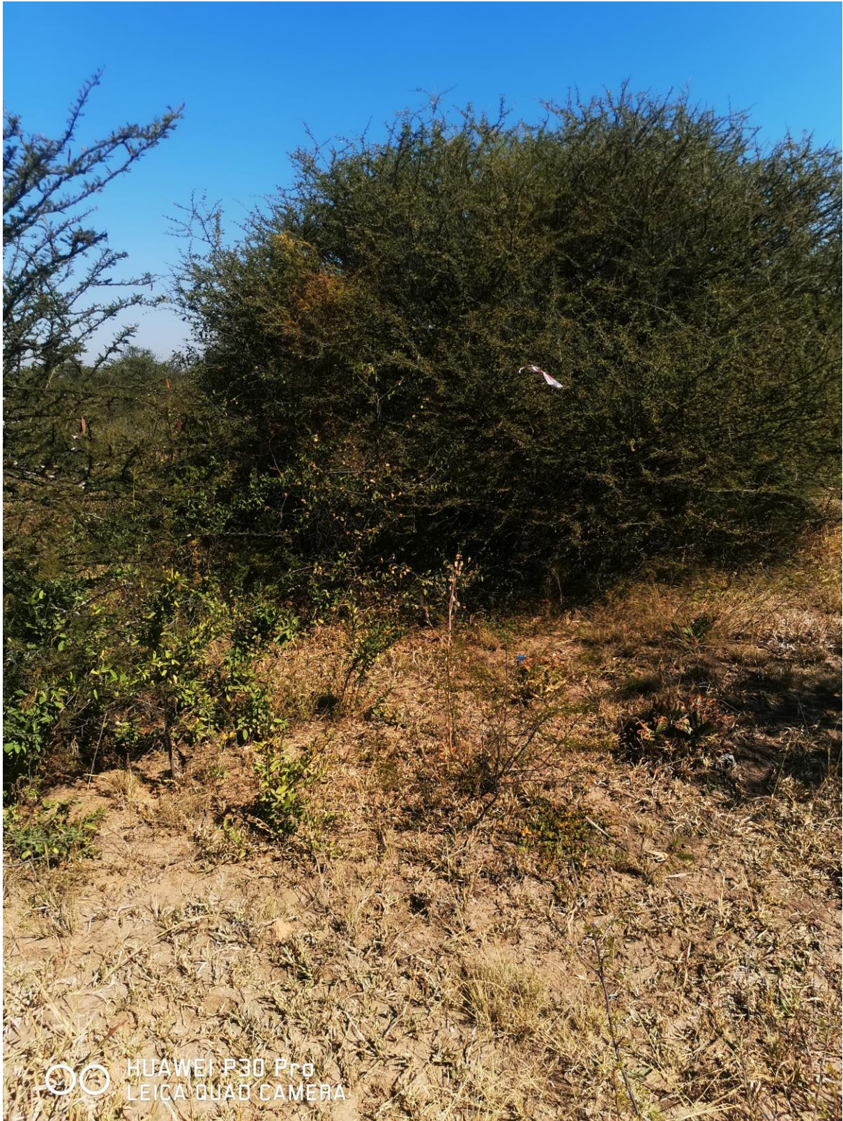
Figure 5: Picture showing vegetation type in the project area