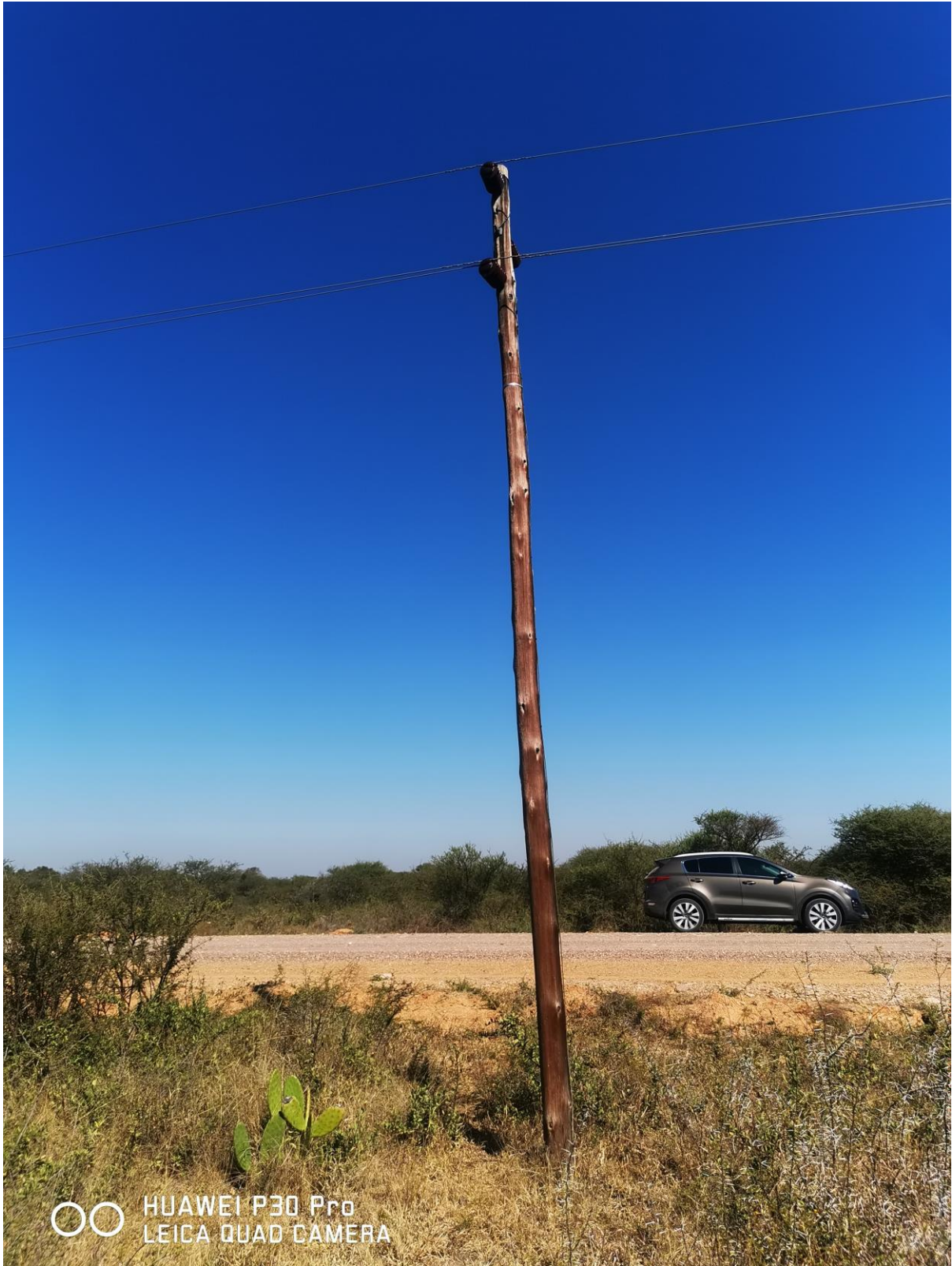
Figure 2: Existing Electrical Infrastructure in the project area