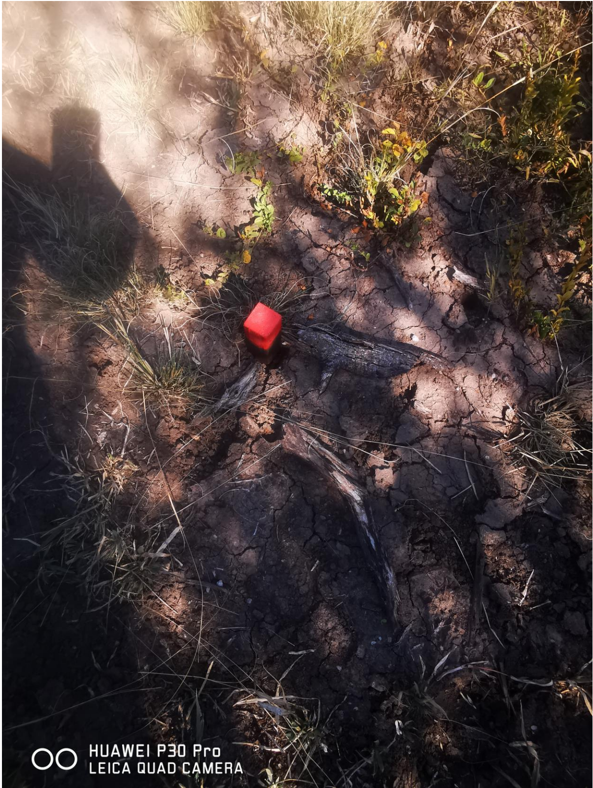
Figure 6: Another picture showing proposed pole position