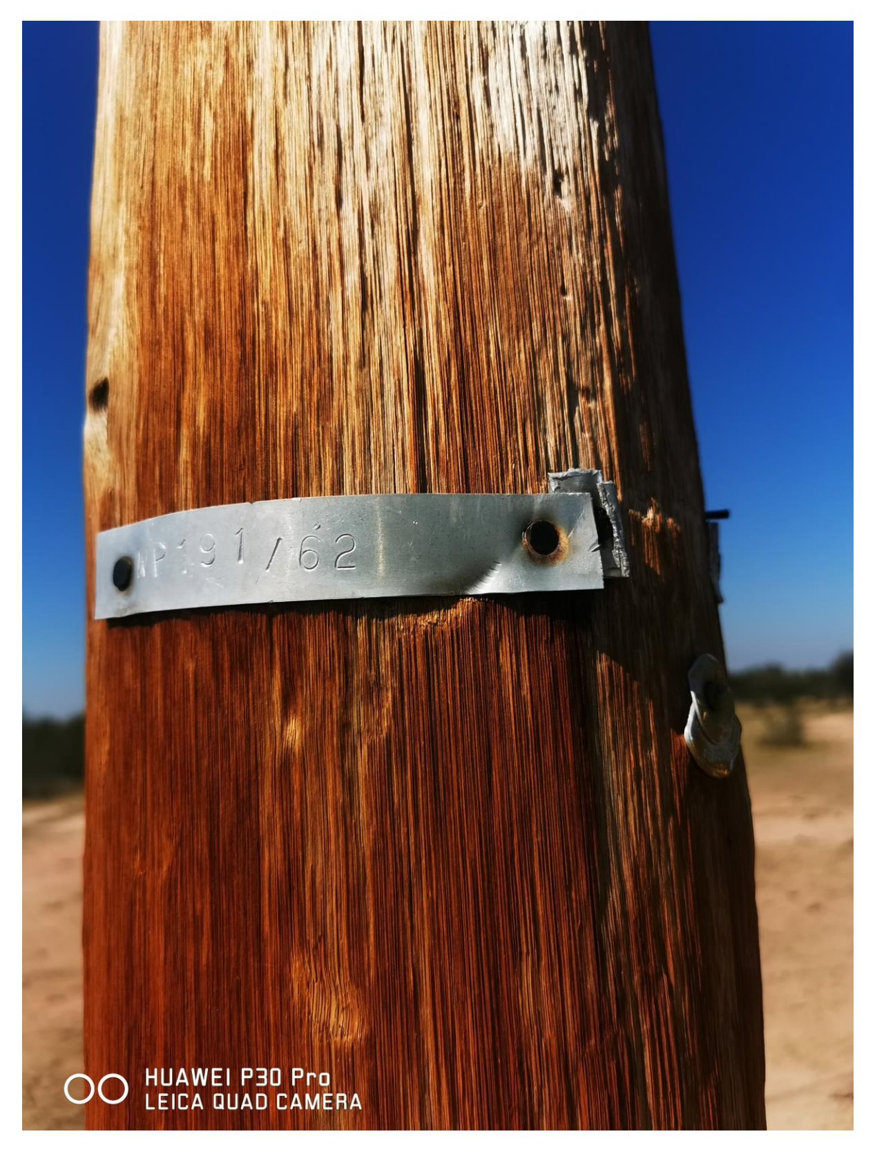
Figure 1: Existing line where the proposed line will be connected from