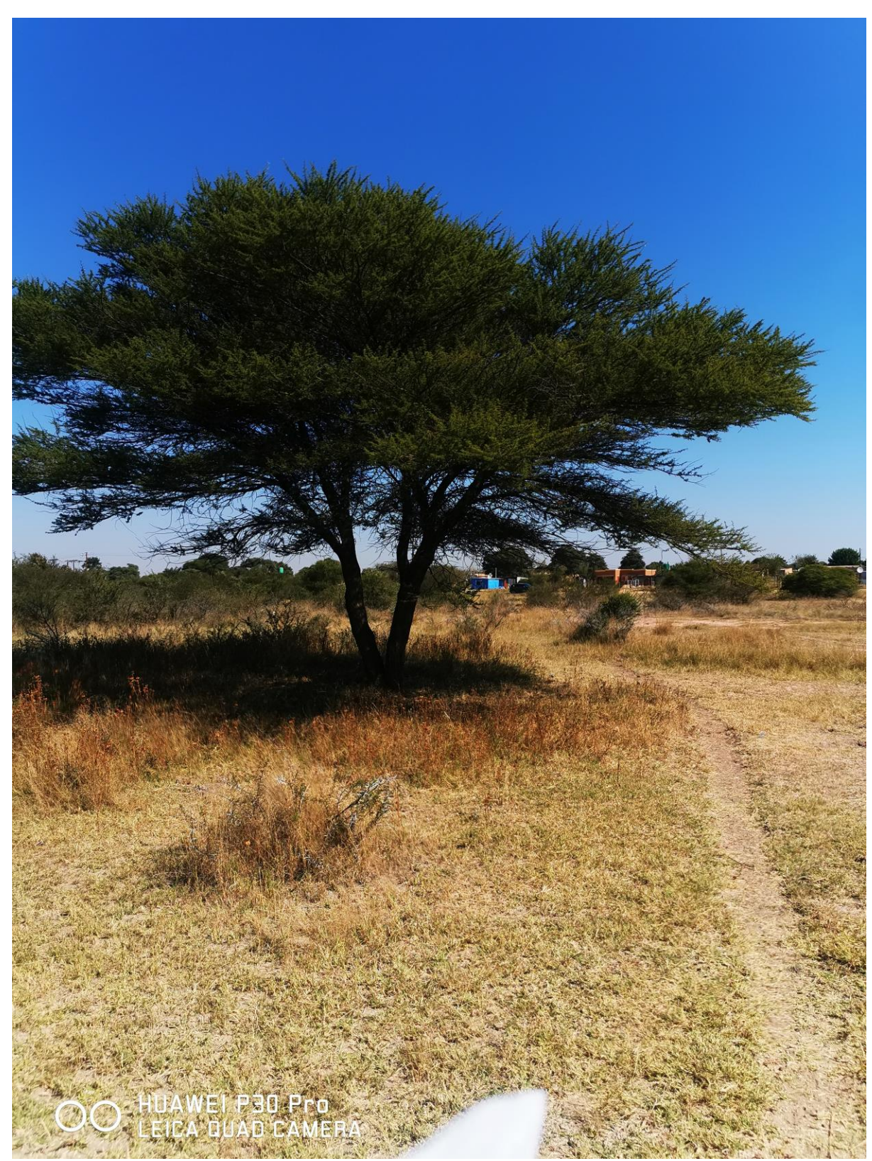
Figure 8: Picture showing the existing road in the project area

Figure 9: Picture showing background area where the power line will be running