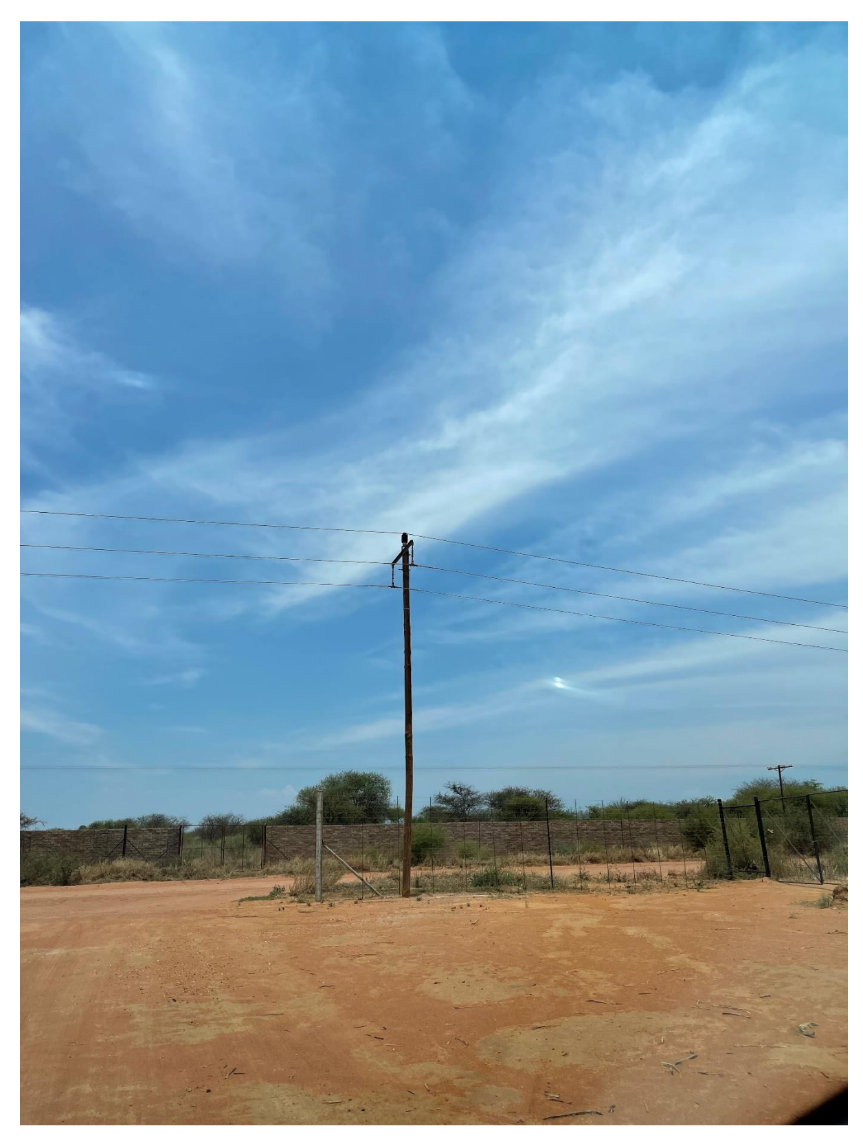
Figure 2: Existing Electrical Infrastructure in the project area