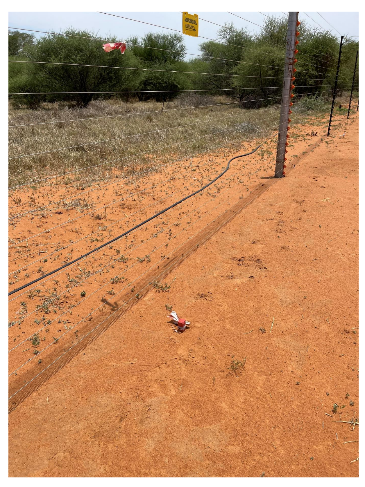
Figure 11: Picture showing the line route