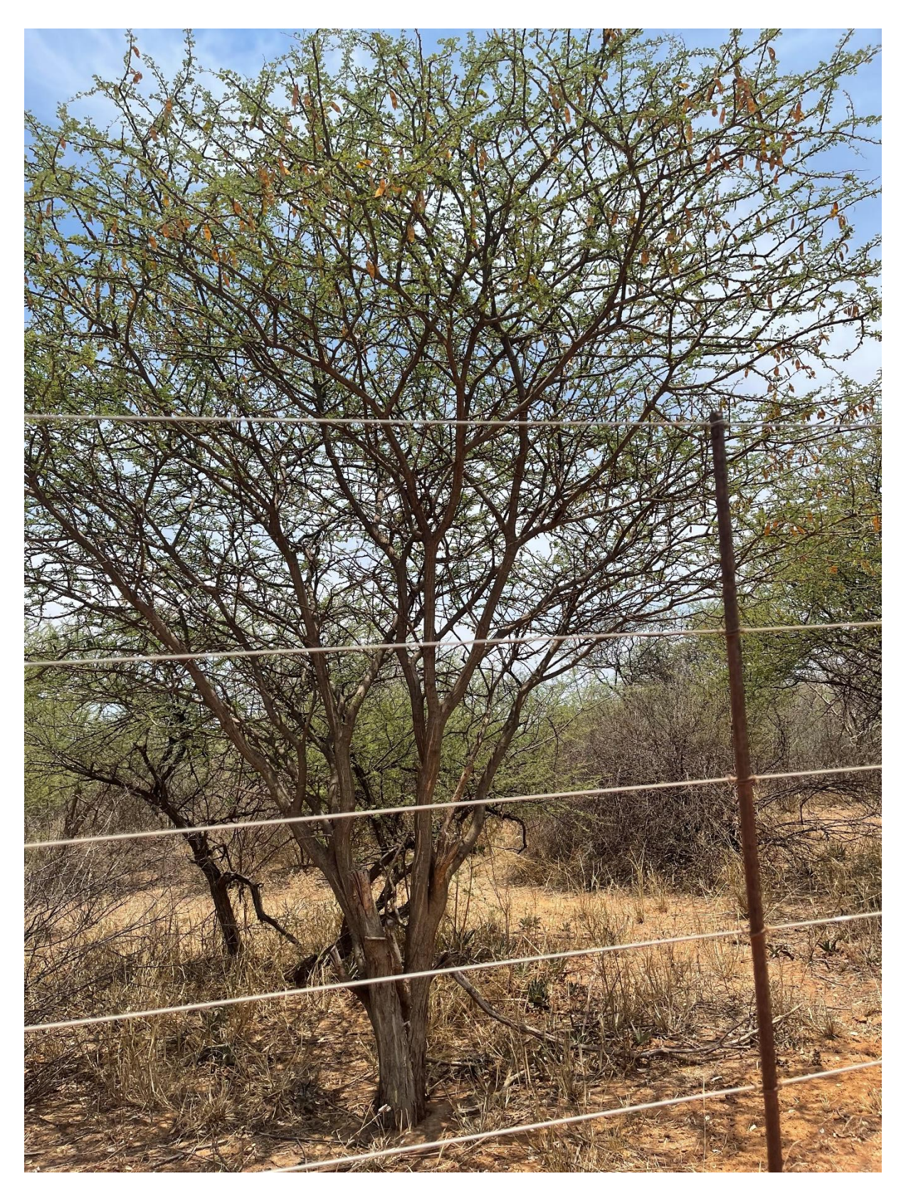
Figure 5: Picture showing vegetation type in the project area