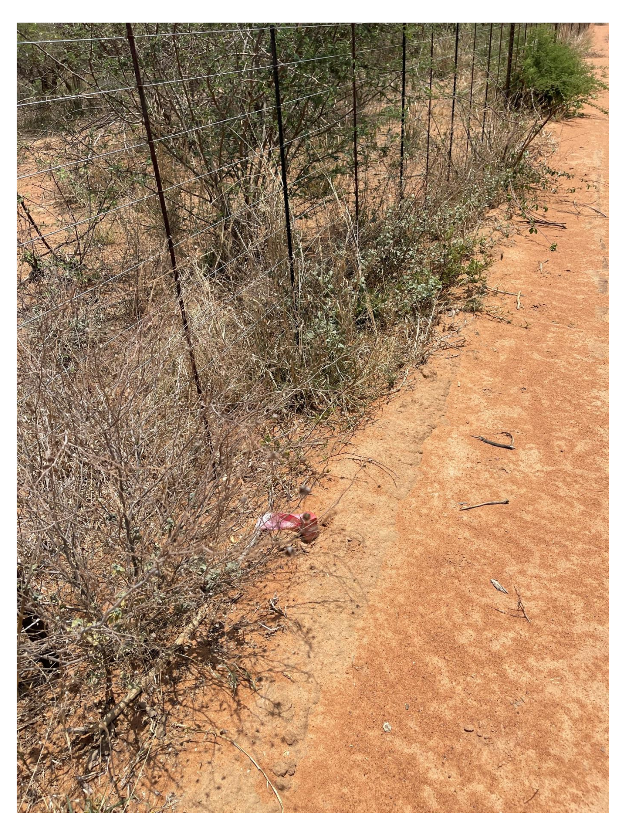
Figure 8: Another picture showing proposed pole position