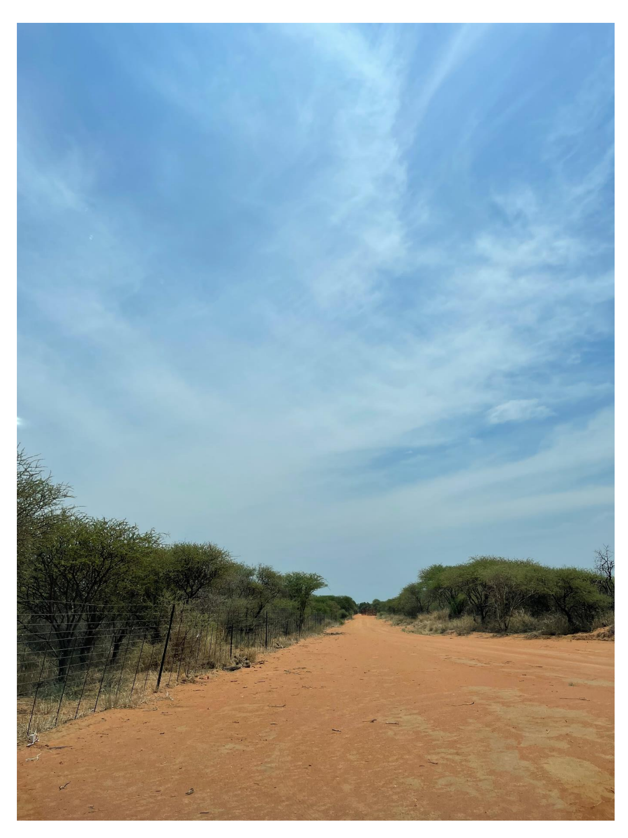
Figure 9: Picture showing existing road infrastructure