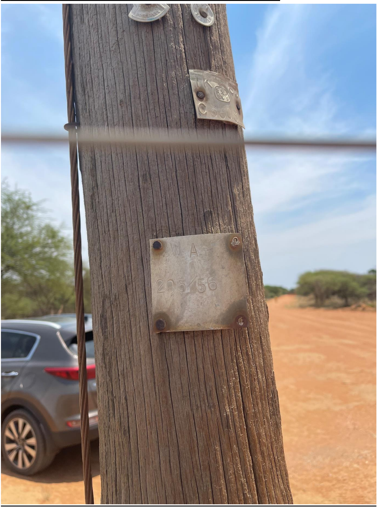
Figure 1: Existing line where the proposed line will be connected from