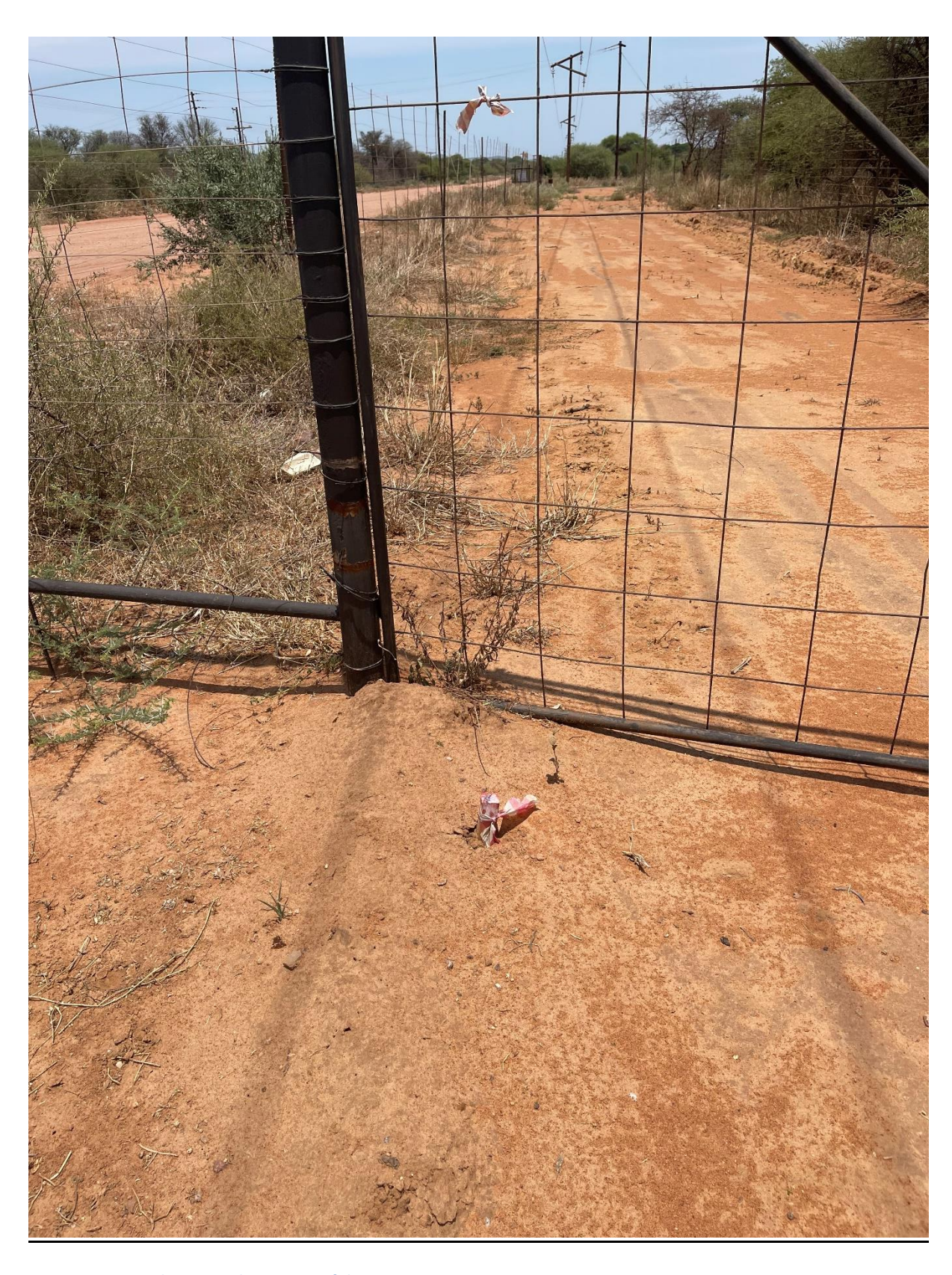
Figure 3: Picture showing pole position of the project area