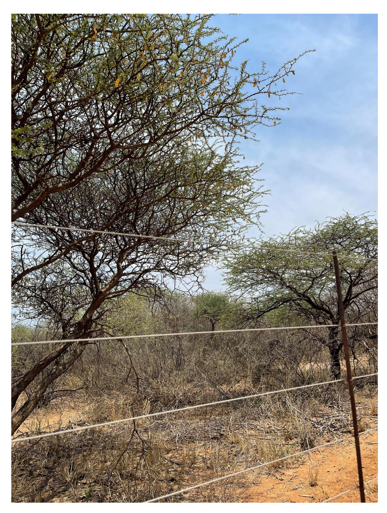
Figure 10: Picture showing farm boundaries