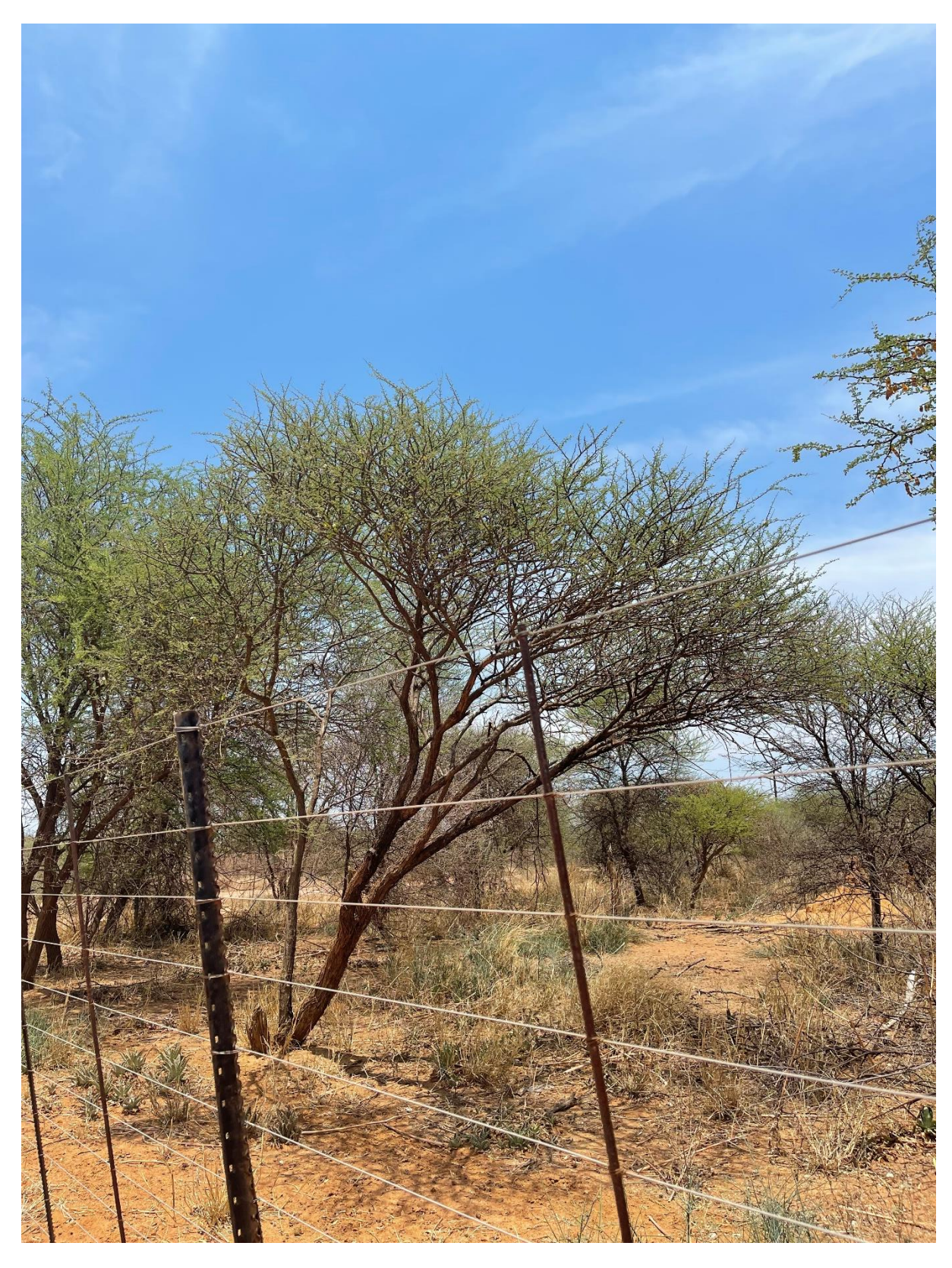
Figure 7: Another picture showing vegetation type in the project area