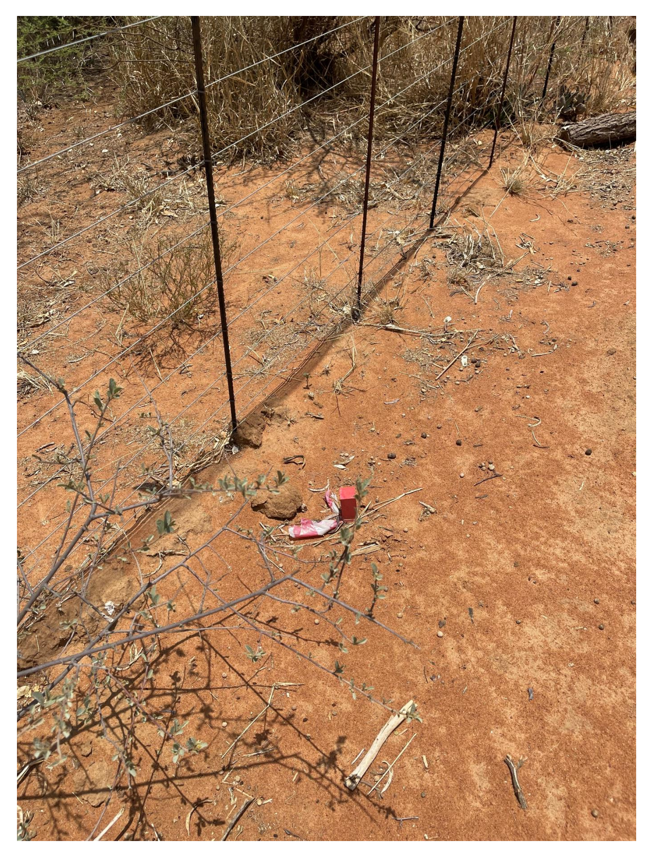
Figure 6: Another picture showing proposed pole position