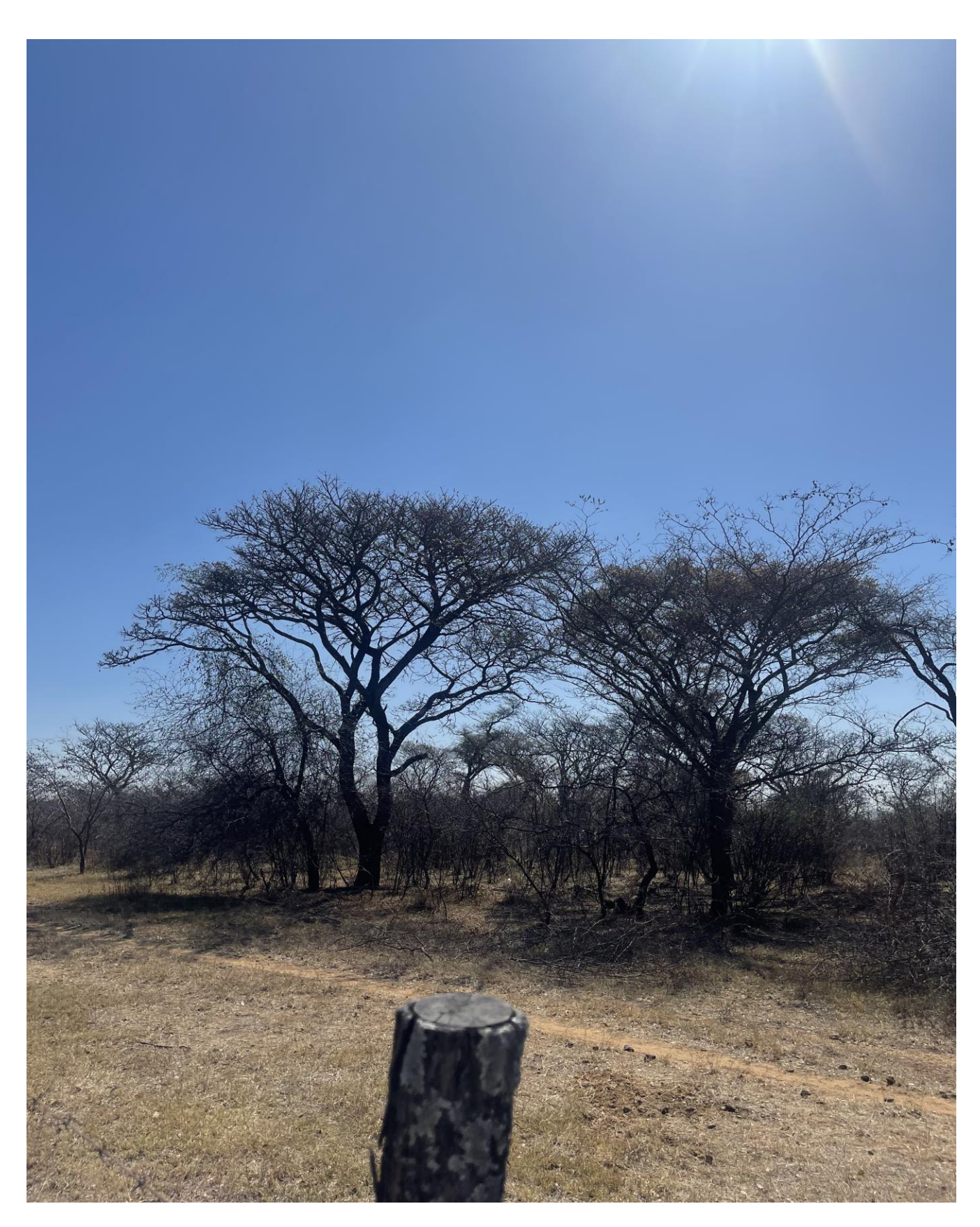
Figure 10: Picture showing vegetation in the area