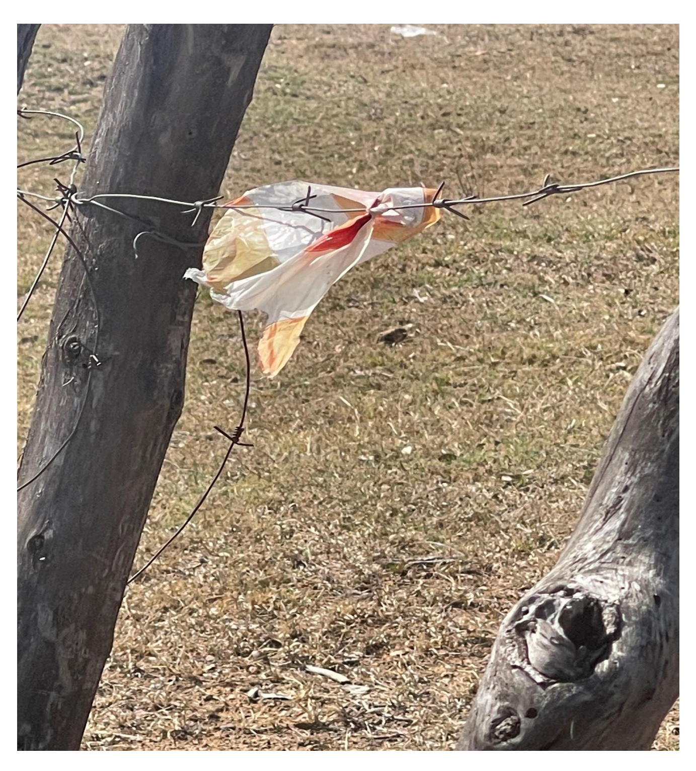
Figure 5: Picture showing the pole position of the powerline