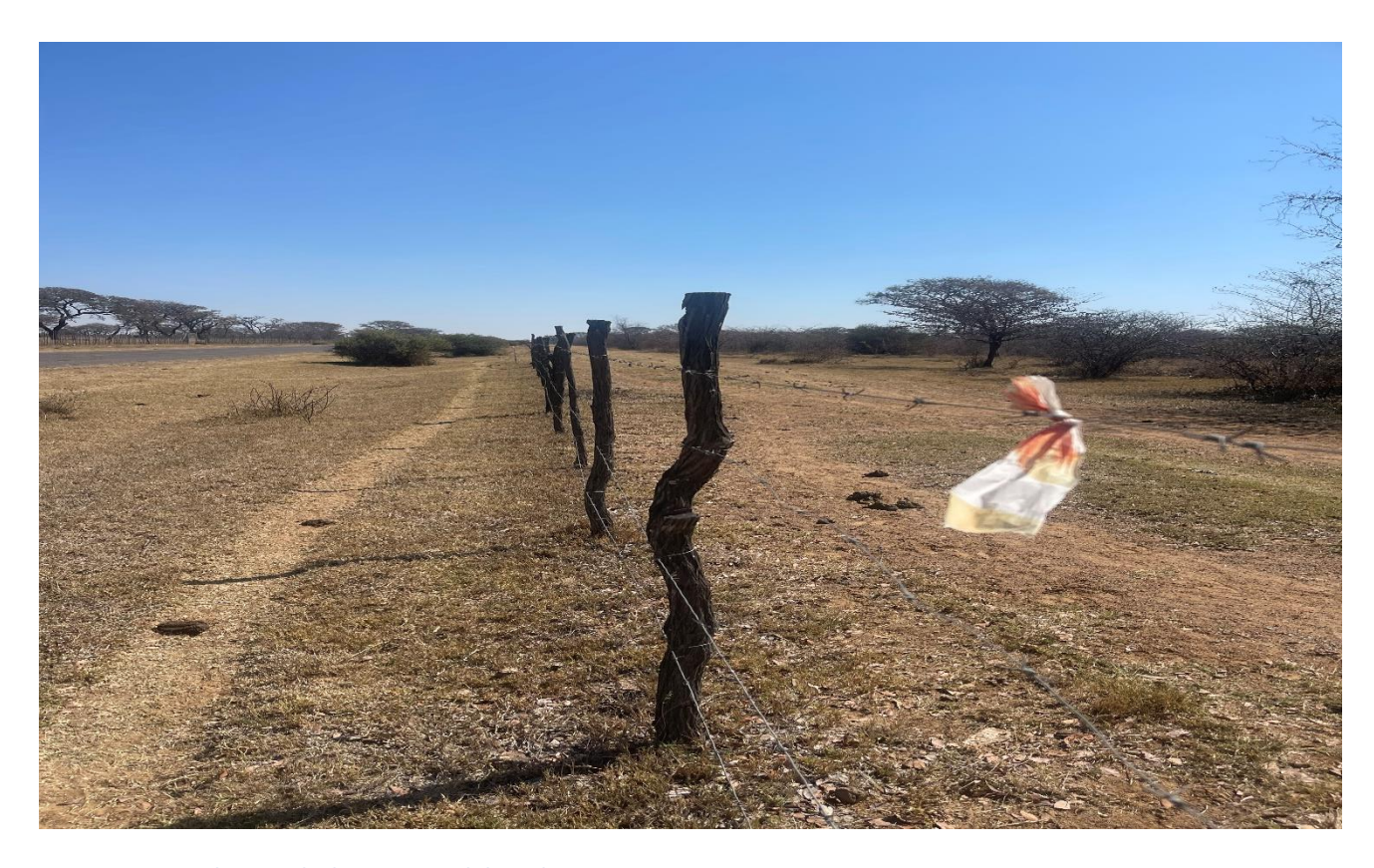
Figure 2: Picture showing the line route and the pole position