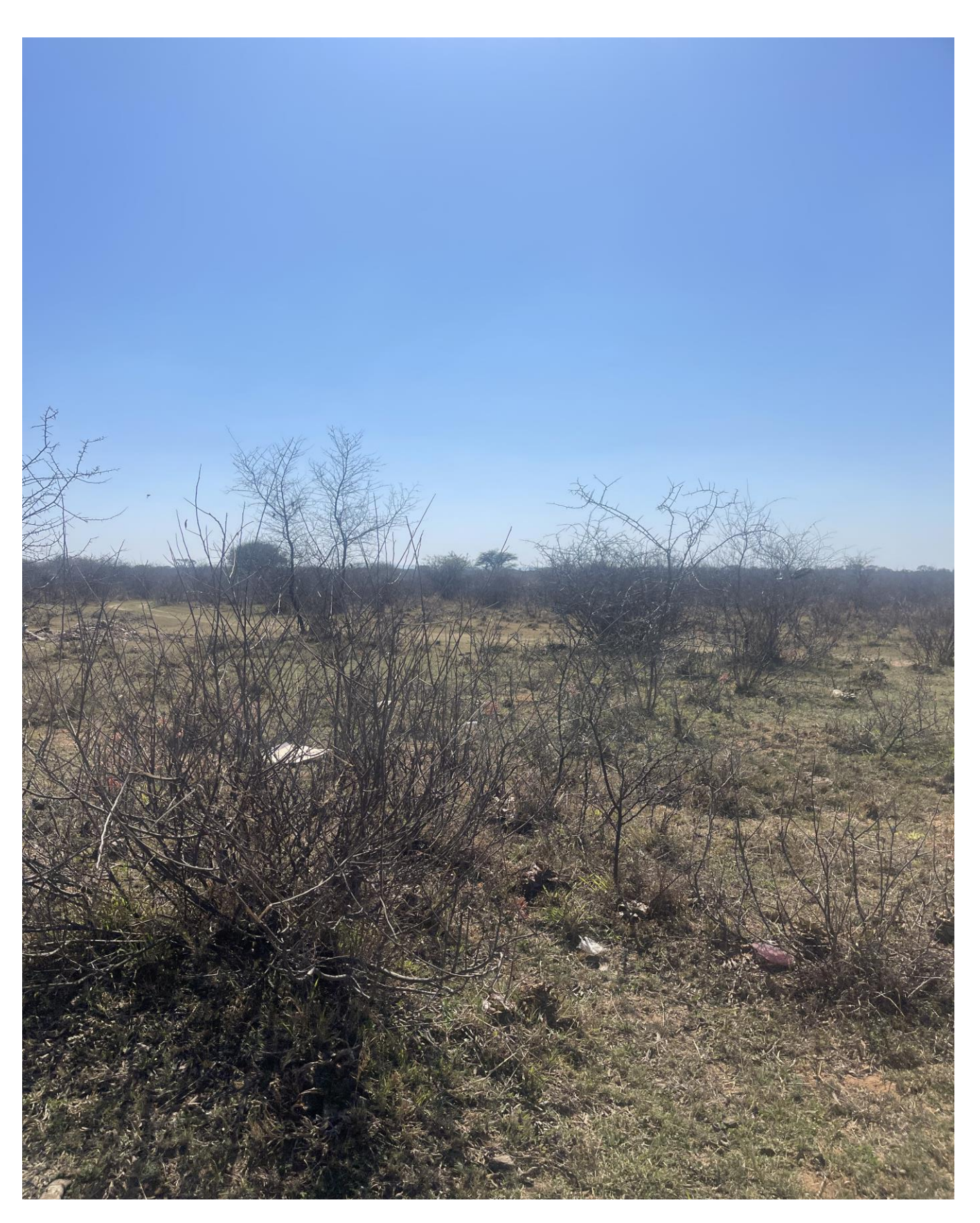
Figure 9: Picture showing the small vegetation in the project area