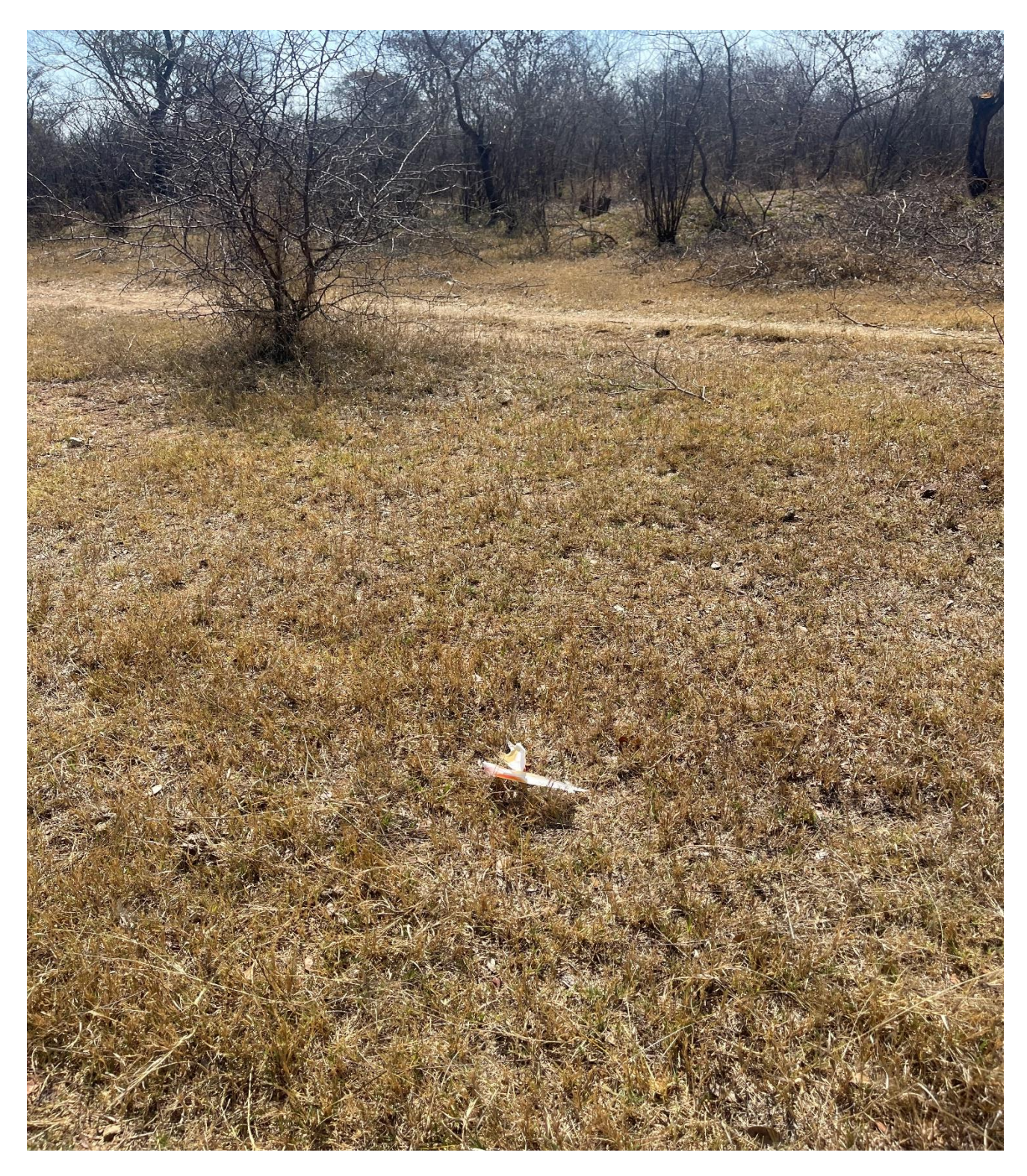
Figure 8: Another Picture showing the pole position of the powerline