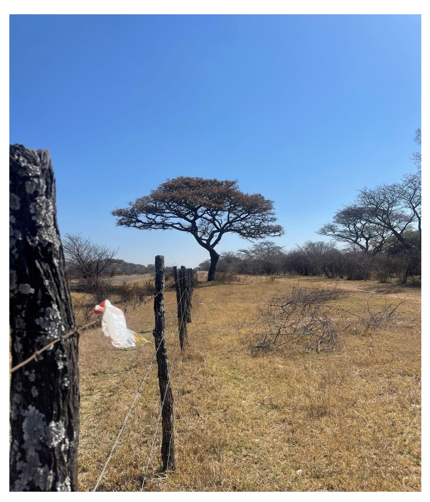
Figure 7: Another Picture showing the pole position of the powerline