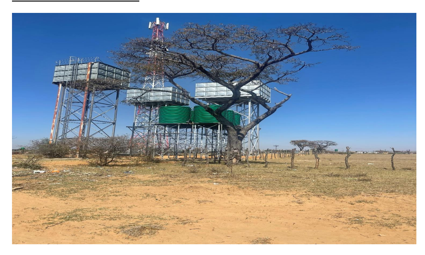
Figure 1: Picture showing the cell tower and water tank next to the existing T-Off line