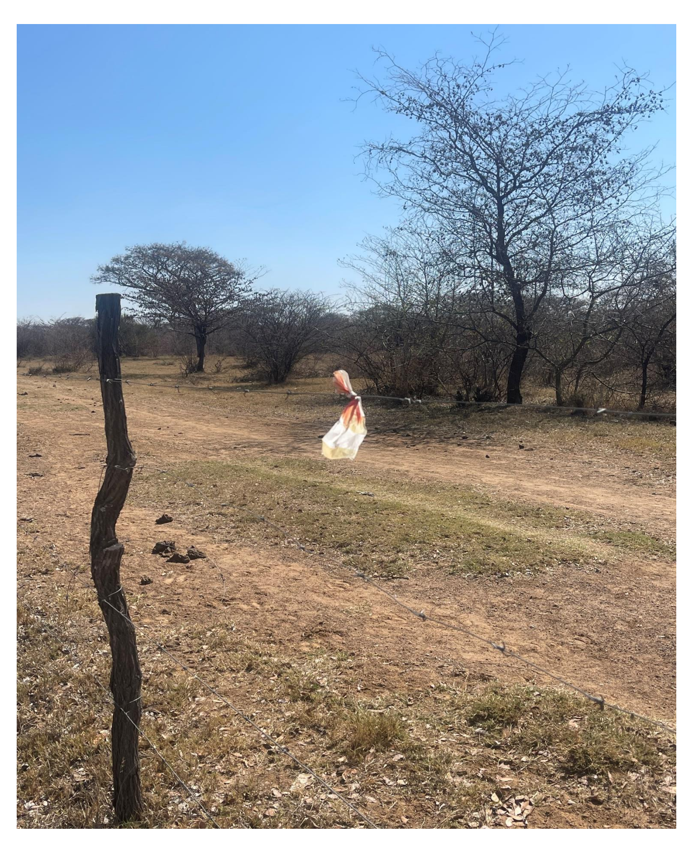
Figure 6: Another Picture showing the pole position of the powerline