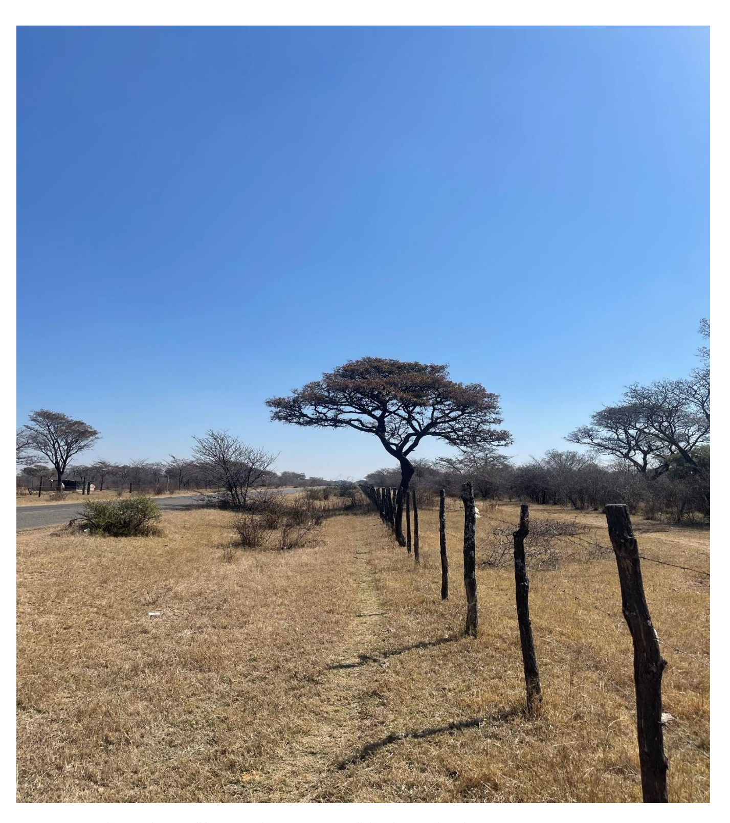
Figure 9: Picture showing the overall line route that is running parallel to the tarred road