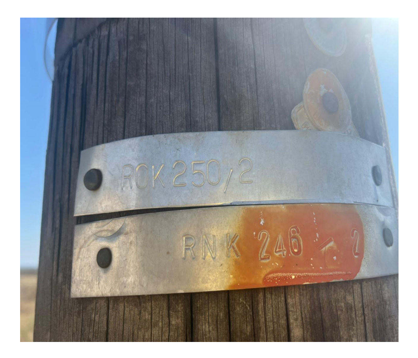
Figure 2: Picture showing pole where the powerline will be supplied from