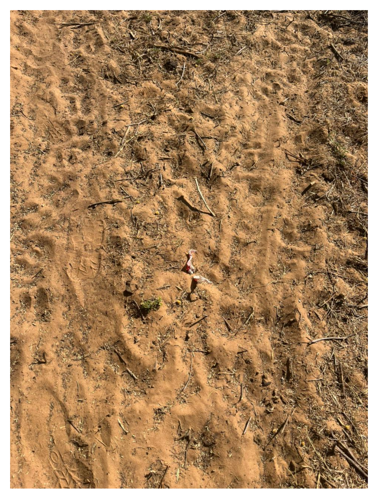
Figure 7: Another picture showing another pole position