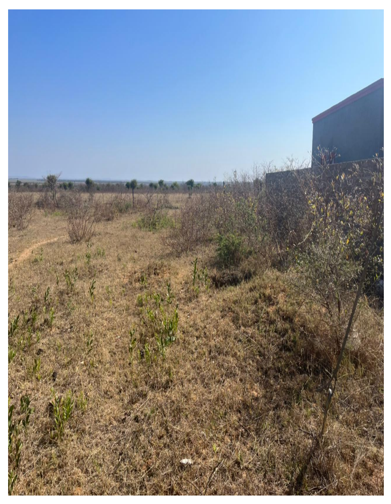
Figure 3: Picture showing the existing vegetation