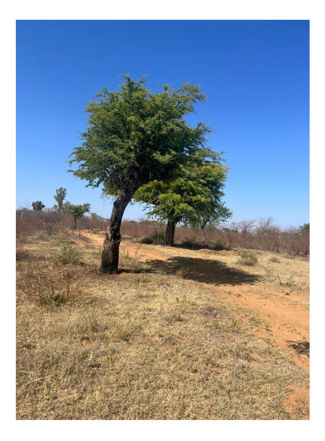
Figure 8: Another picture showing Acacia tree that is affected by the powerline