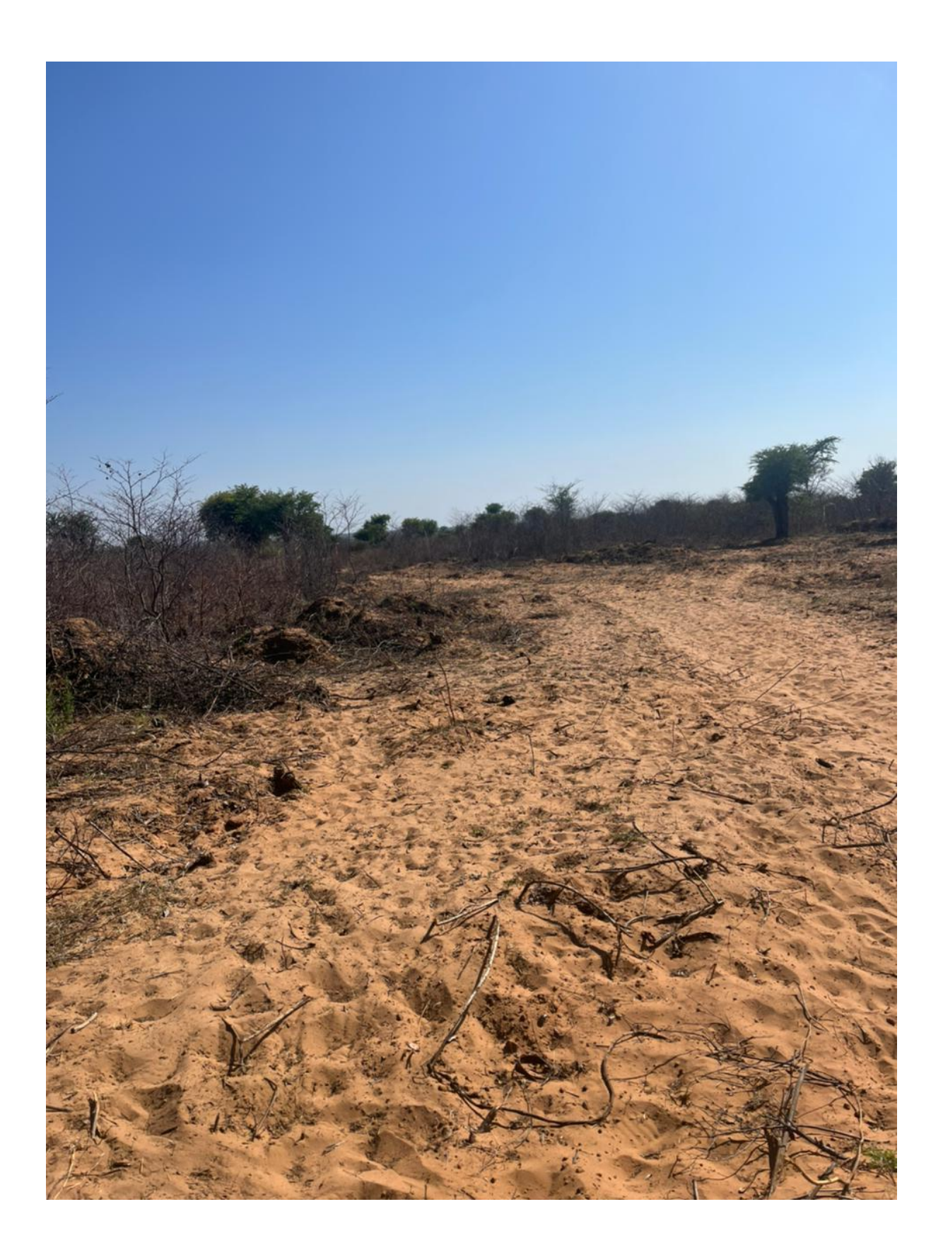
Figure 5: Picture showing pole position of the powerline