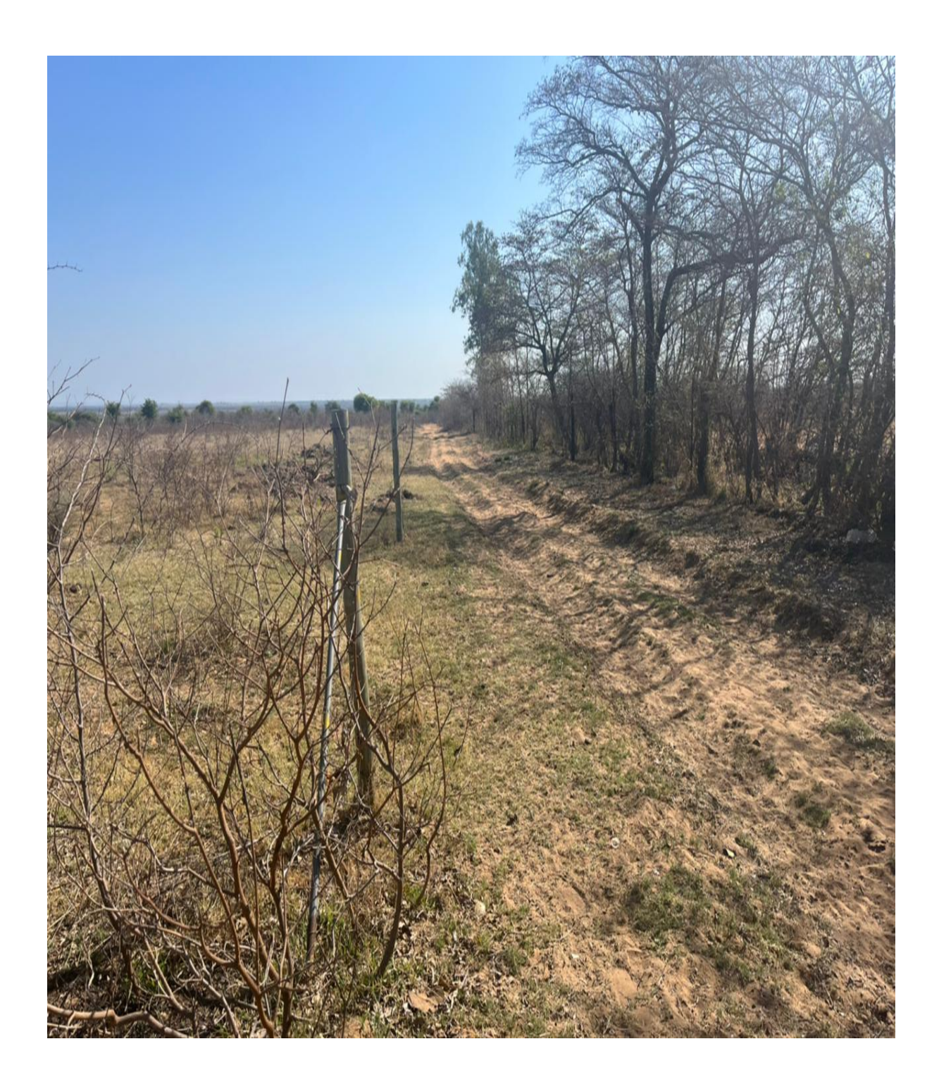
Figure 4: Picture showing existing road and fence boundary infrastructure