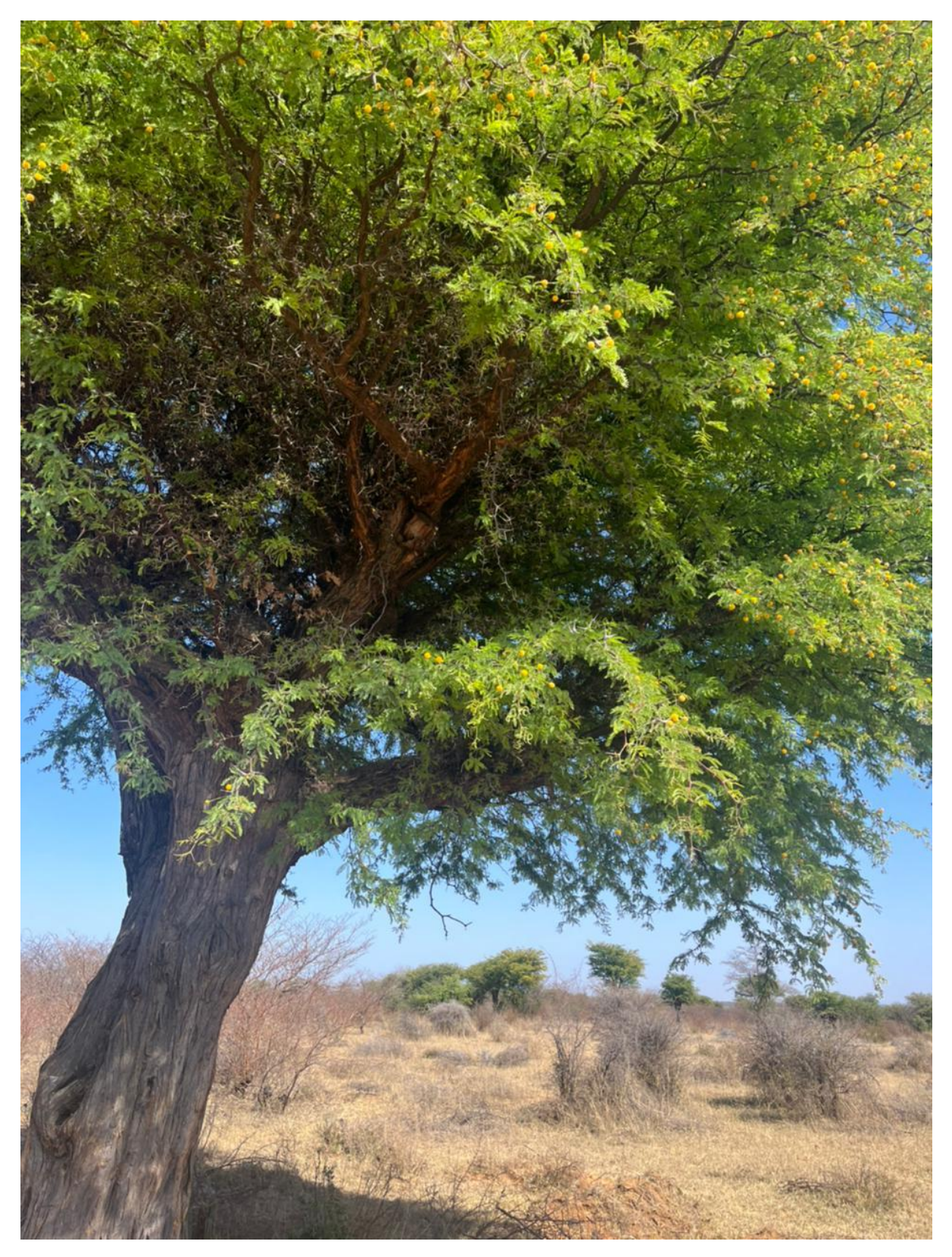
Figure 6: Picture showing one of the protected species