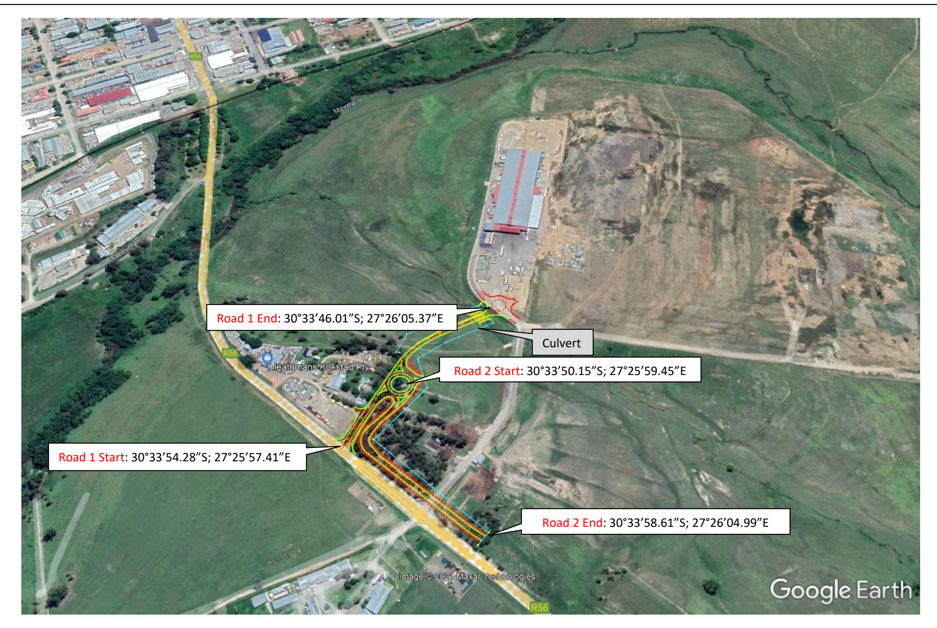
Figure 2 : Site Layout Image of the proposed Rocabar access roads.