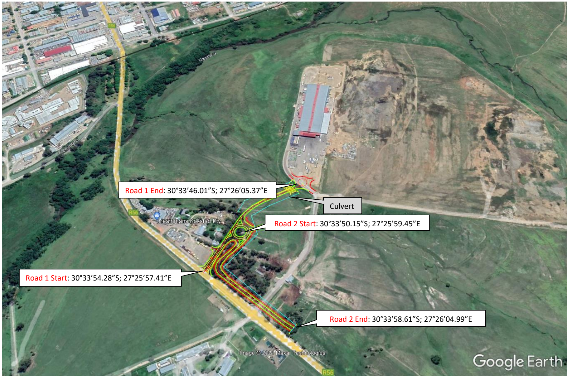
Figure 2: Site Layout Image of the proposed Rocabar access roads.