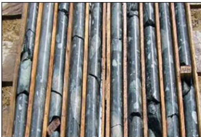
Plate 2: Geological Core Samples from Prospecting Drilling

The amount of holes to be drilled will be identified from the desktop study. It is however anticipated that should a coal resource be identified that the area will be drilled to a measured resource whereby a hole is required in 350 m intervals on the prospecting right area. The location of the prospecting holes is however dependent on the impact of the environment, economic activities on the property and underlying geology.