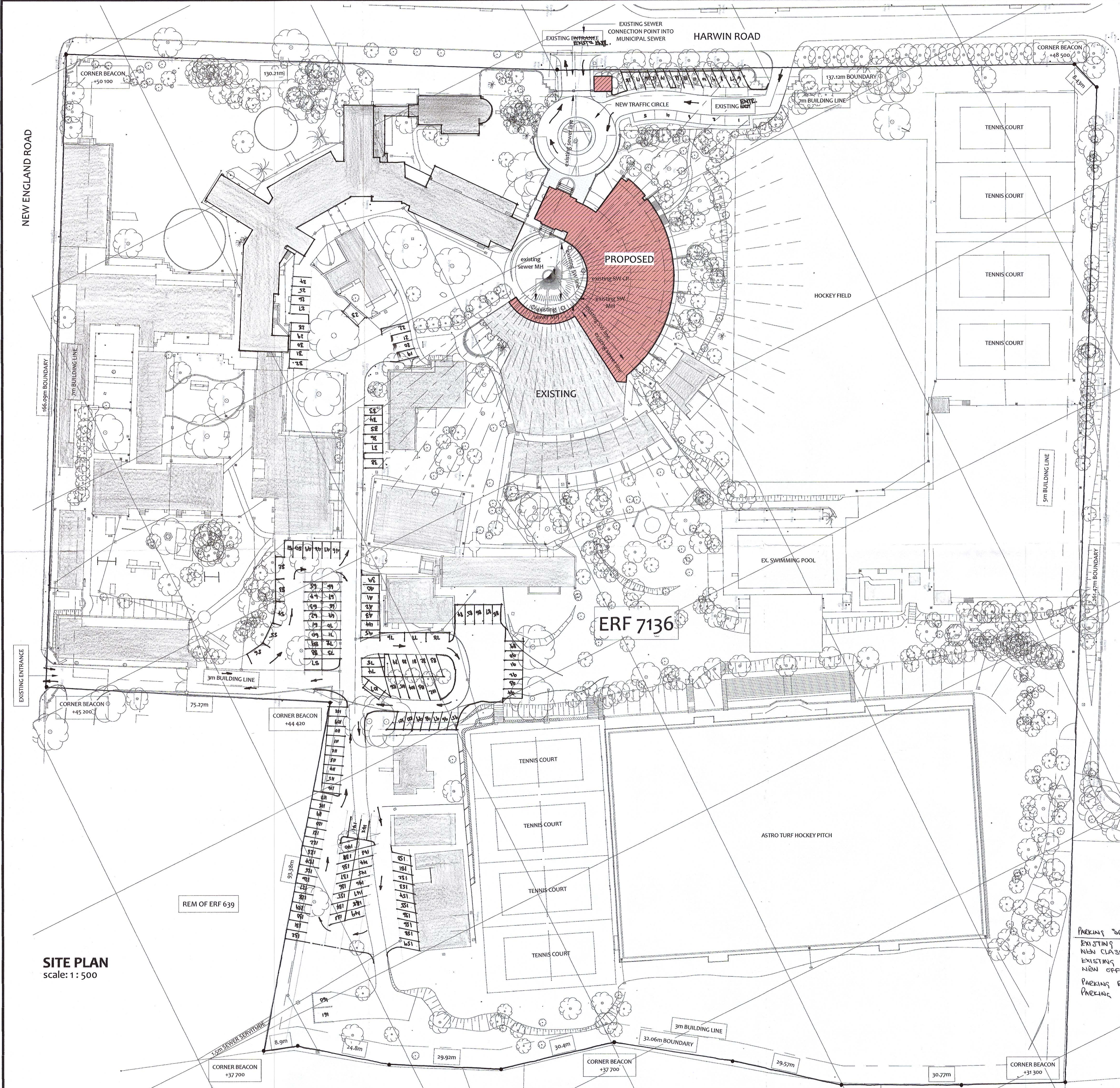
SITE PLAN scale: 1 : 500