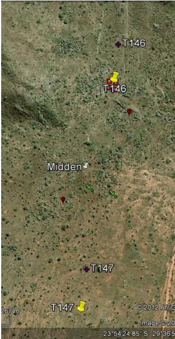
Figure 2. The new positions for Towers 146 & 147 are indicated with purple crosses. The position of Tower 147 seems to be safe outside the archaeological site, but Tower 146 is still enclosed by ruins and therefore may contain cultural material relating to any of the occupation phases.