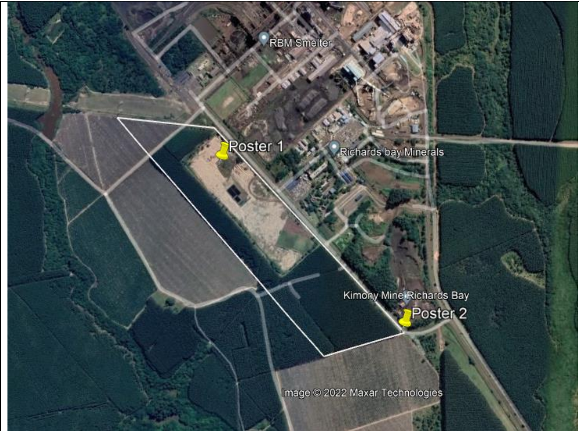
Figure 3 Google Earth image indicating the site and the position of the two Site Notices that were placed on site.