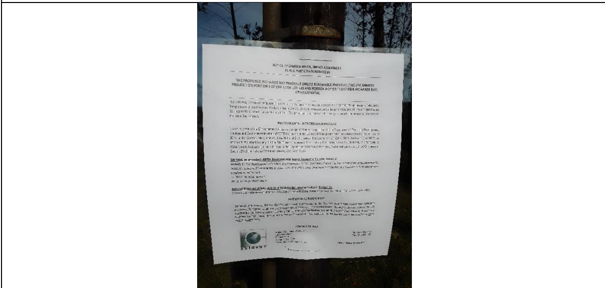
Figure 2 Proof of Site Notice 2 placed on the South-Eastern boundary of the proposed study area along the RBM Rd at Co-ordinates : 28°41'26.58"S 32° 8'29.08"E