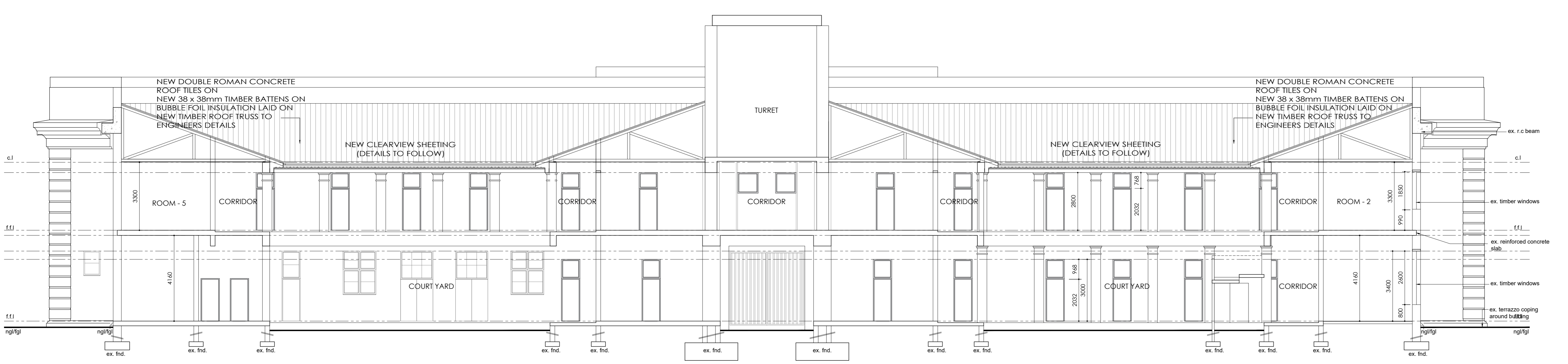
SECTION 2-2 1:100