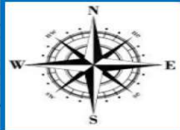
WGS 84 Coordinate System

Plan Compiled in accordance with Regulation 2(2) of the Mineral & Petroleum Resources Development Act 2002 (Act 28 of 2002) Scale 1: 50 000 Reference Bench Mark Survey System - WGS84/WGS84 2024 CC Please note that the coordinates and area were derived from a GIS and not physically surveyed and is therefore an estimation only. Compiled by: _____ Applicant: _____ Regional Manager Date: _____ Date: _____ Mpumlanga Region