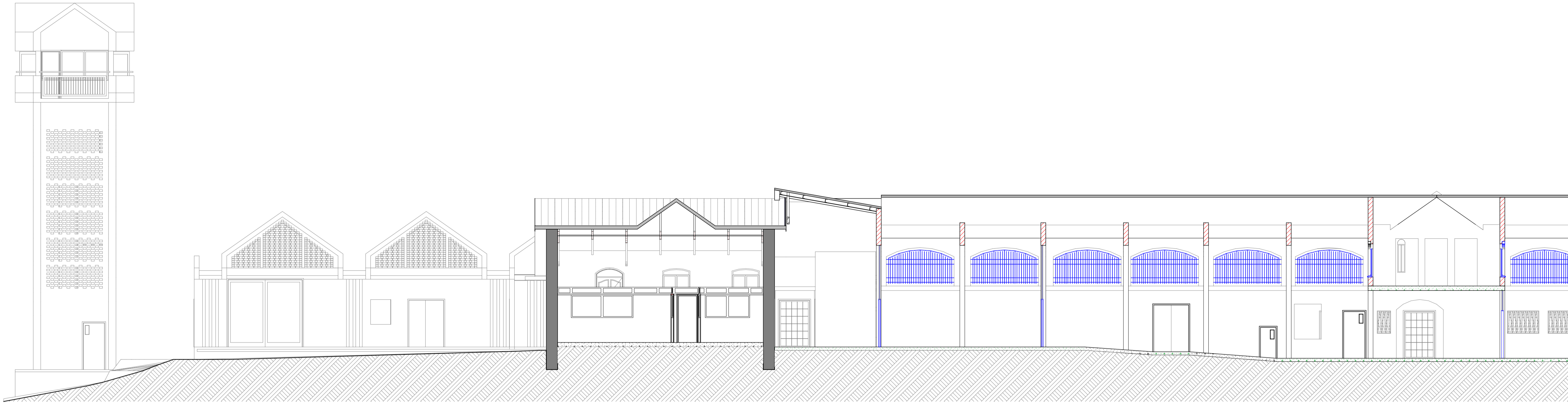
100 S-07 Building Section Scale 1:100