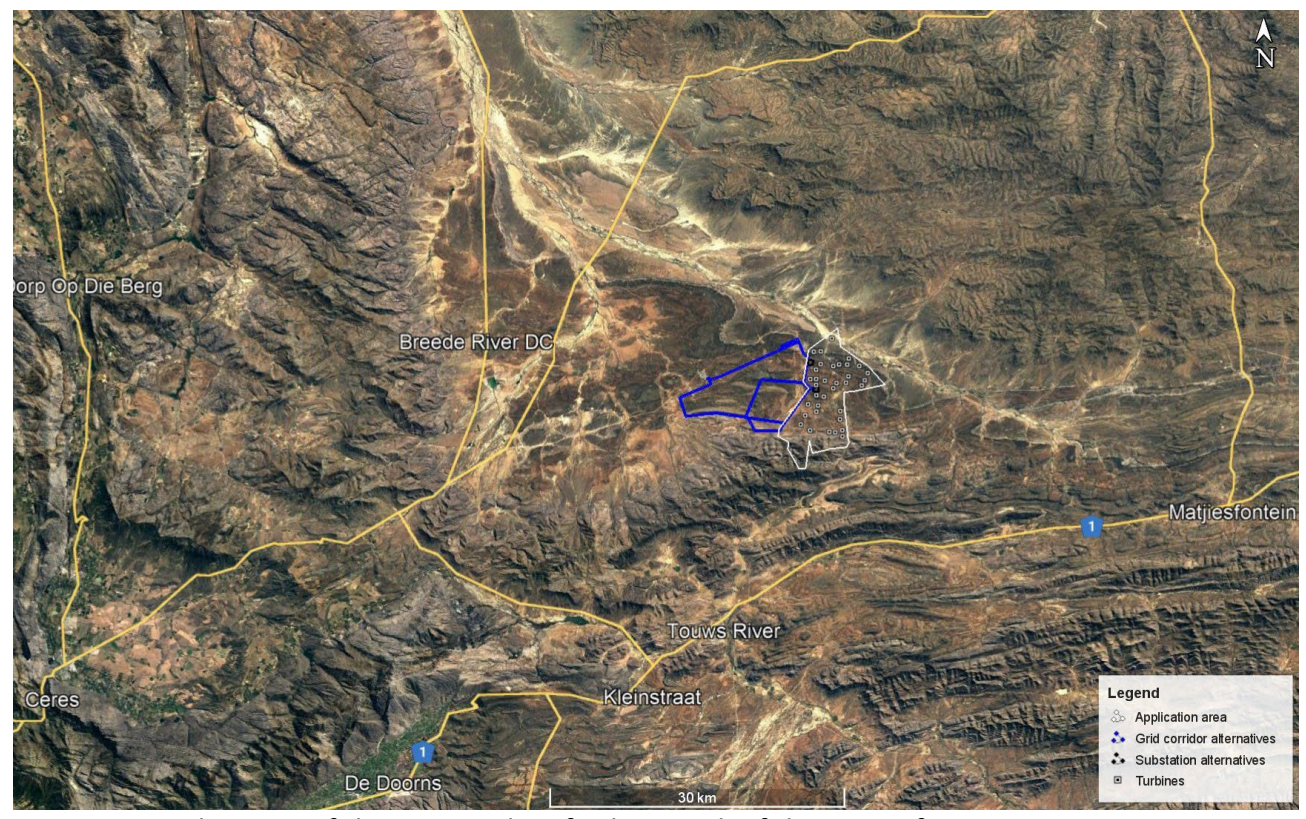
Figure 1. Locality map of the proposed PV facility, north of the town of Touws River.

Environmental authorisation is being sought for the proposed construction and operation of the 250 MW Patatskloof Wind Energy Facility (WEF), battery energy storage system (BESS), grid connection and associated infrastructure located near Ceres in the Western Cape Province (see location in Figure 1). In terms of the National Environmental Management Act (Act No 107 of 1998 - NEMA), an application for environmental authorisation requires an agricultural assessment. In this case, based on the verified sensitivity of the site, the level of agricultural assessment required is an Agricultural Compliance Statement.