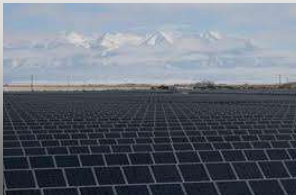
Figure 1: Illustration of photovoltaic arrays on a solar power plant.