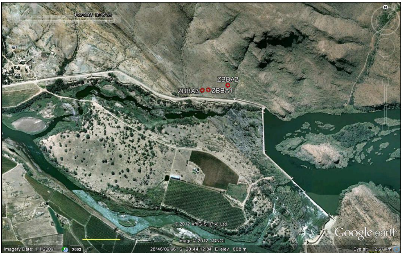
Aerial view of the general study area showing the location of the three scatters (red circles).