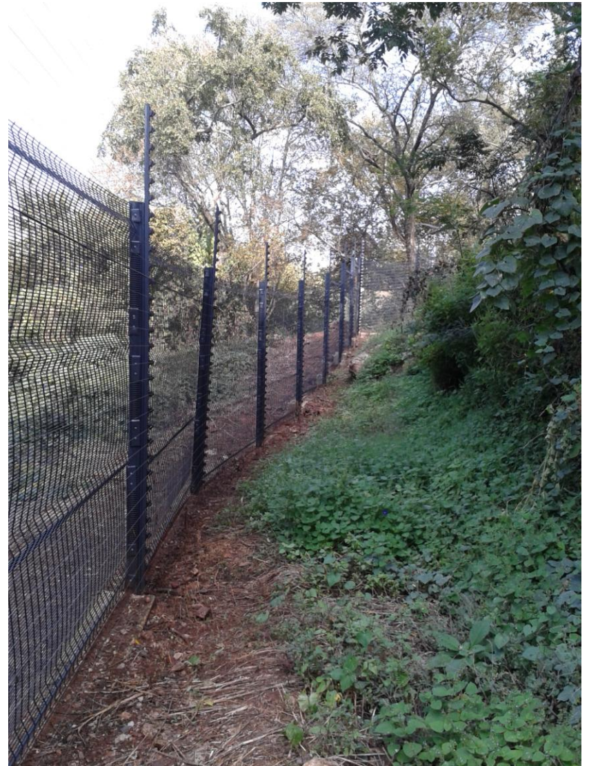
Looking east from the location of the pipeline (from inside the West End fencing)