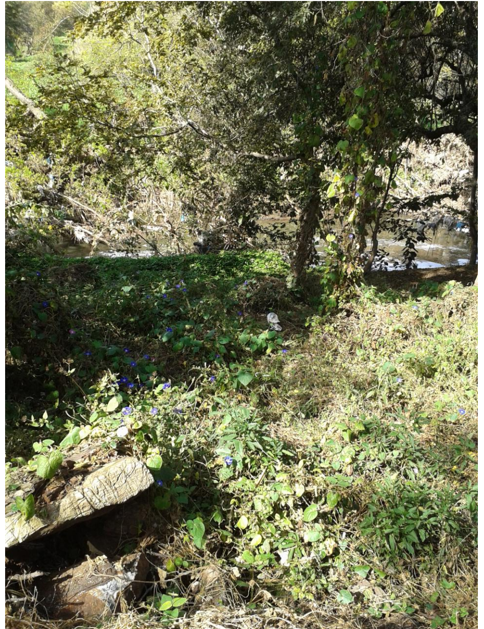
Looking south from the proposed site (from outside the West End fencing)