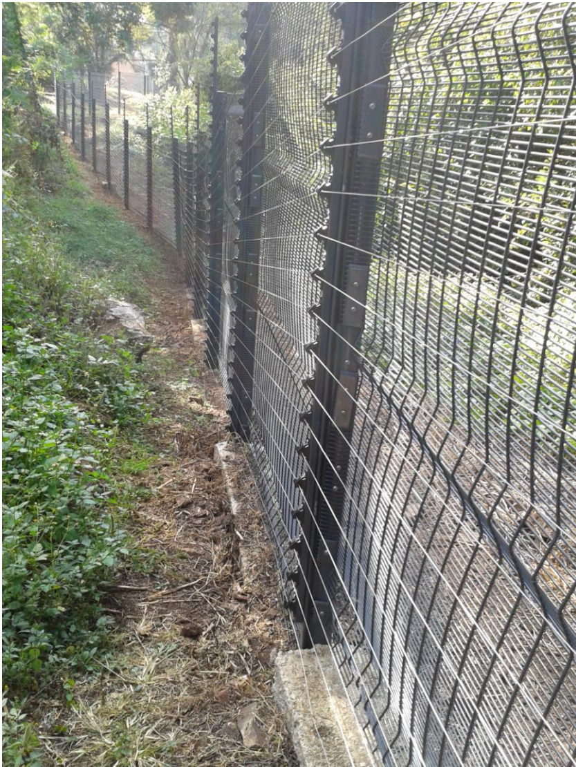
Looking west from the location of the pipeline (from inside the West End fencing)