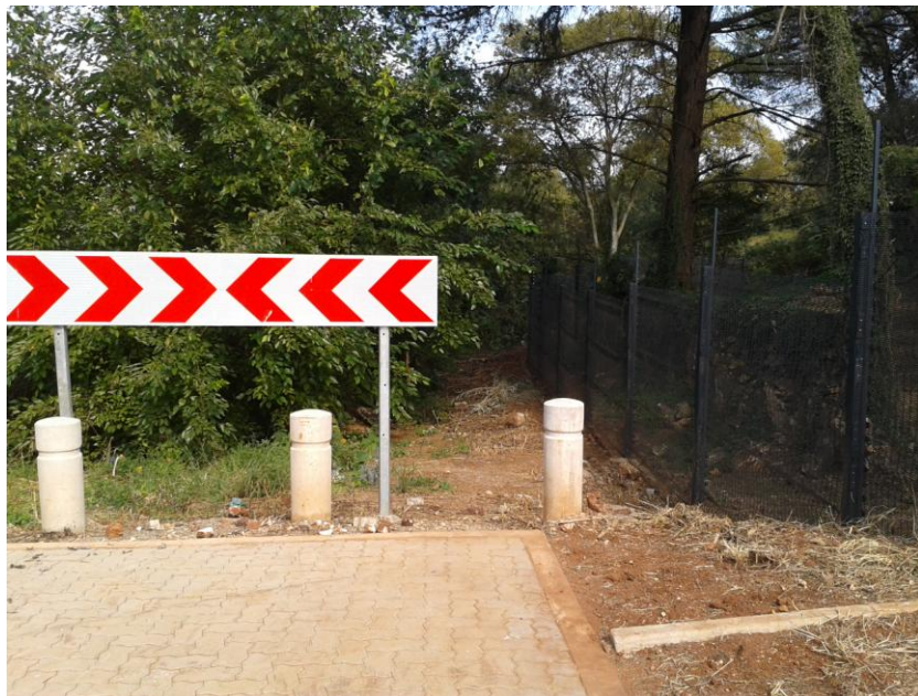
Looking South-west from the southern end of Hall street