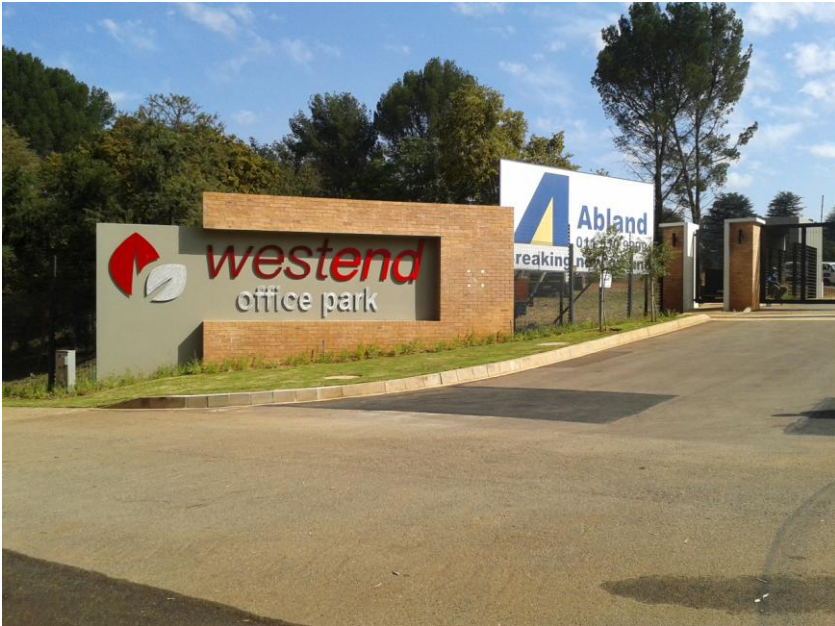
Entrance to the West End Office Park on Hall Street