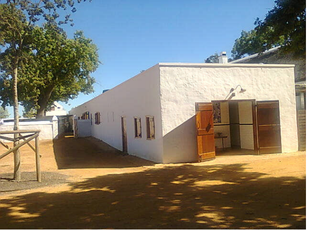
Left: b) The site for the “stables” addition. Right: The existing recent addition to the “stables”, onto which the proposed additional building will erected.