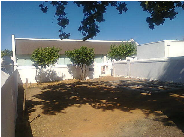
Left: c) View from the site for the proposed “stables” addition. Right: The site for the “kraal” addition, with the existing bistro to the back.