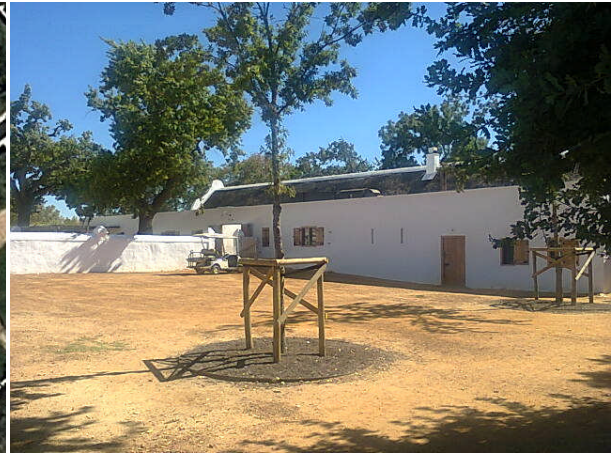
Left: The sites for the addition to the “stables” and “kraal”. Right: a) The site for the “stables” addition.