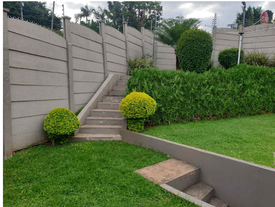
EAST ELEVATION - PROPOSED ADDITION SIDE