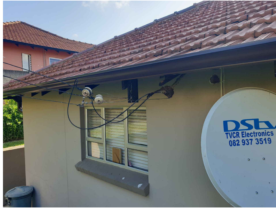
WEST ELEVATION 1