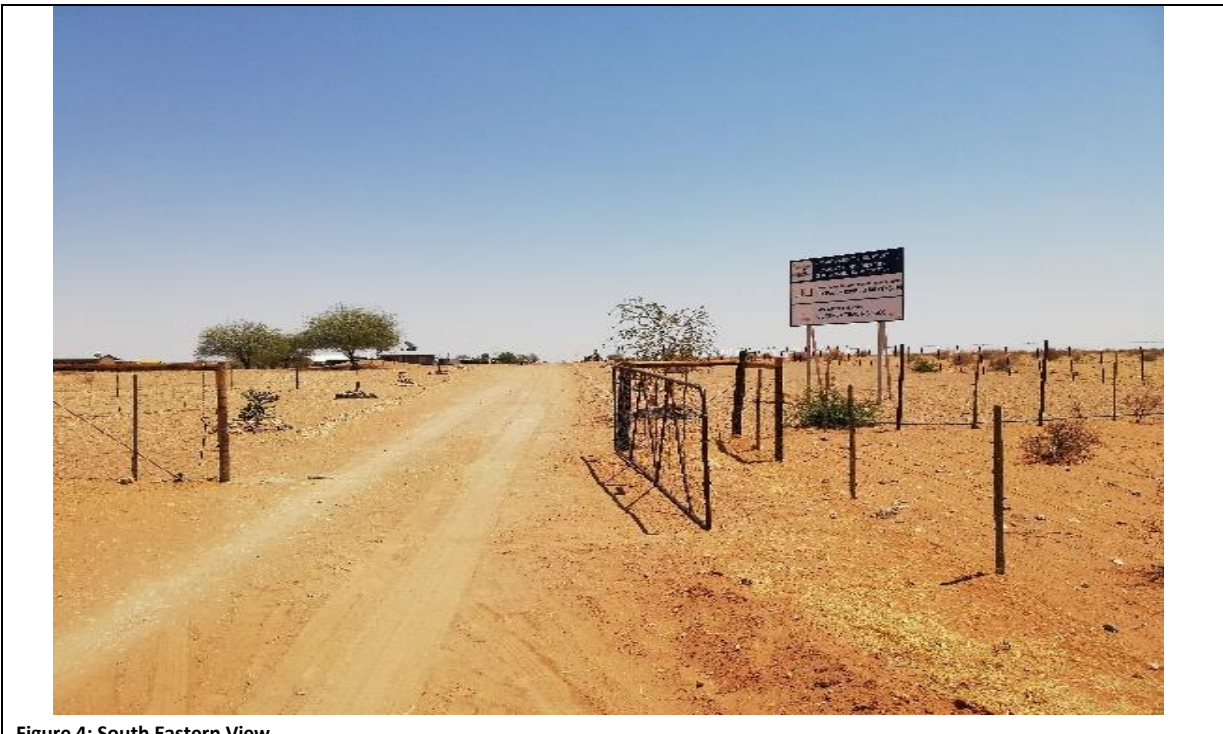
Figure 4: South Eastern View