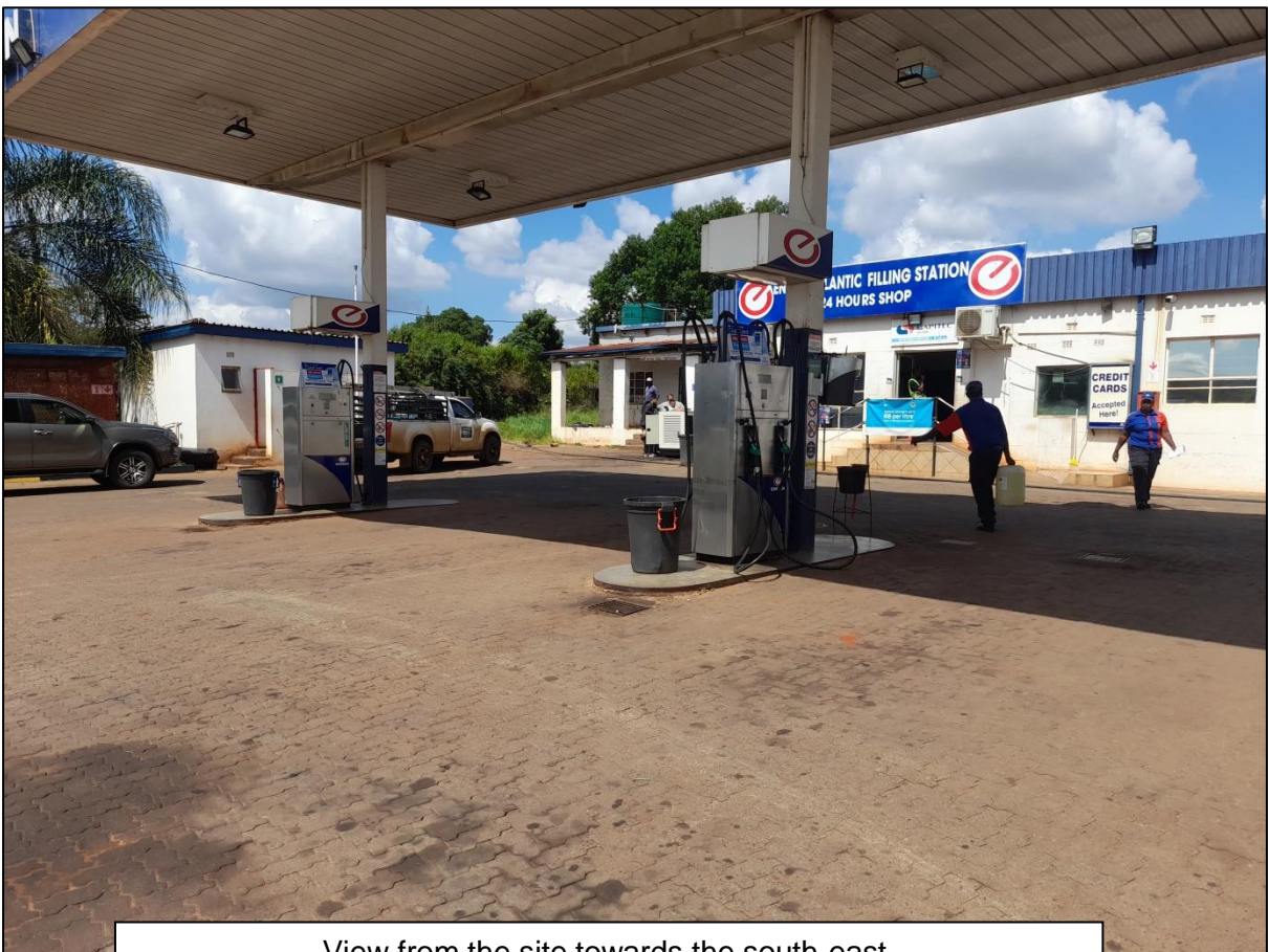
View from the site towards the south-east.