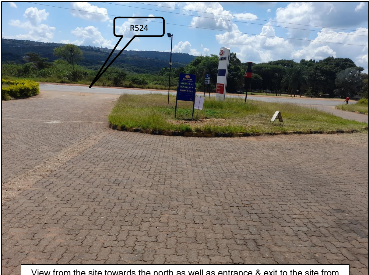
View from the site towards the north as well as entrance & exit to the site from the R524.