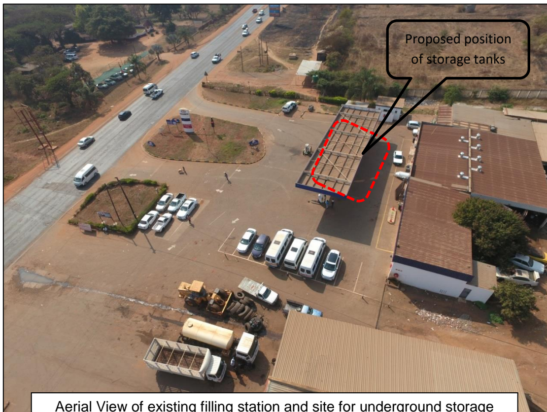
Aerial View of existing filling station and site for underground storage tanks towards the east.