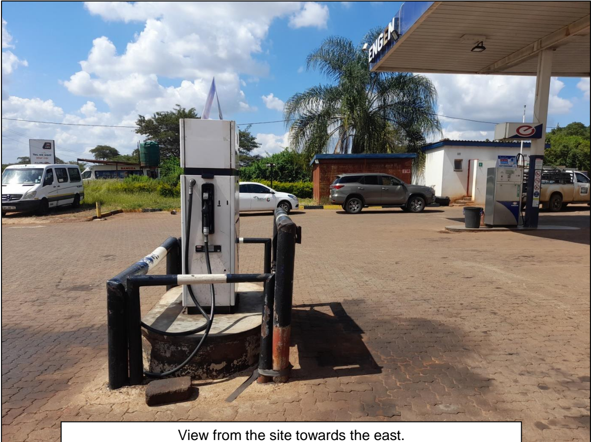
View from the site towards the east.