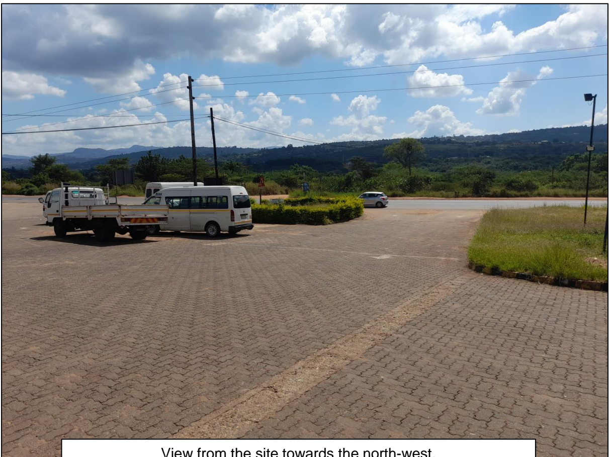
View from the site towards the north-west.