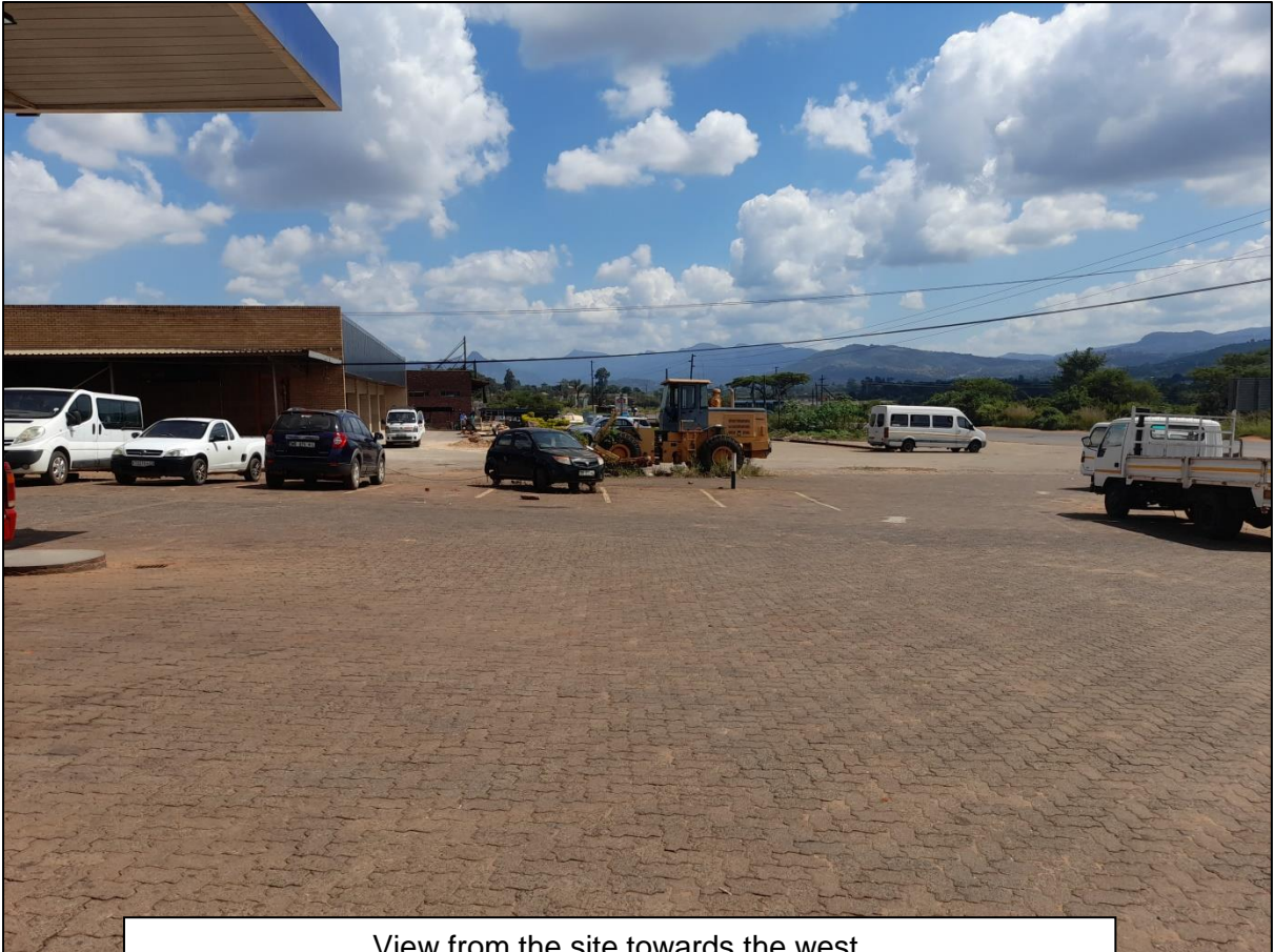
View from the site towards the west.