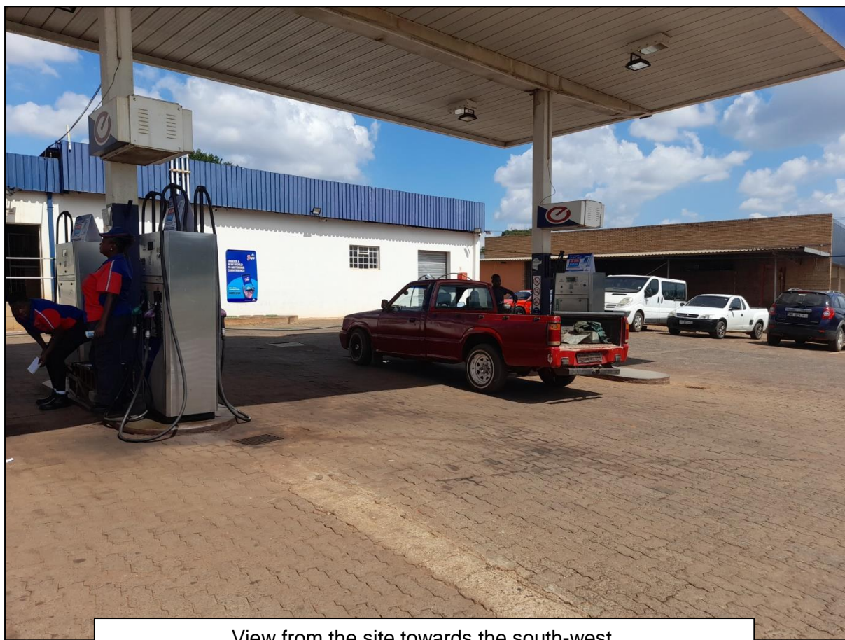
View from the site towards the south-west.