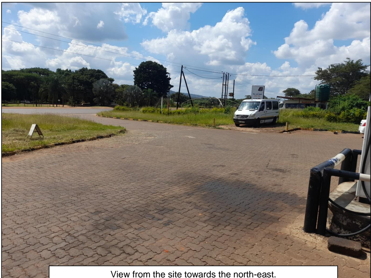
View from the site towards the north-east.