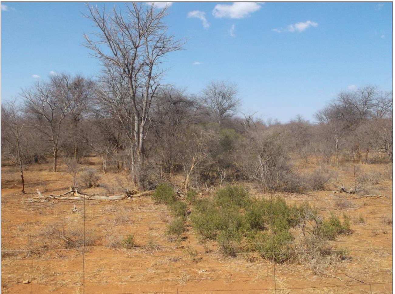
Figure 4: View from the site to the east