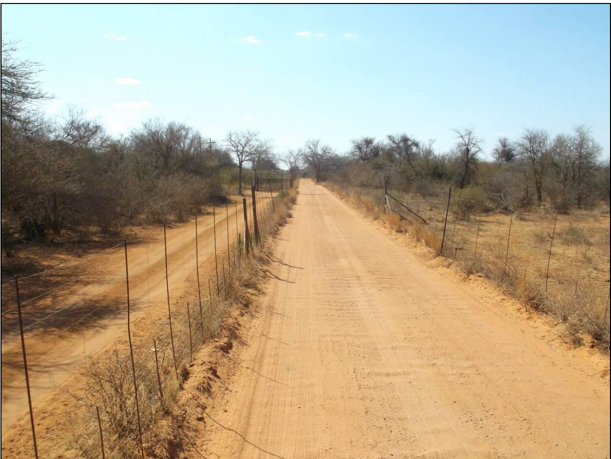
Figure 2: View from the site to the north and access road to the site.