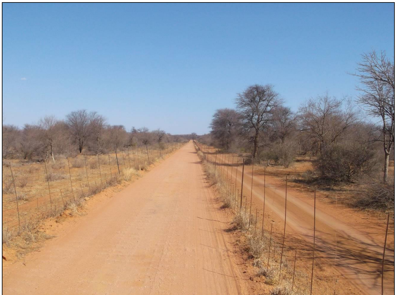
Figure 6: View from the site to the south