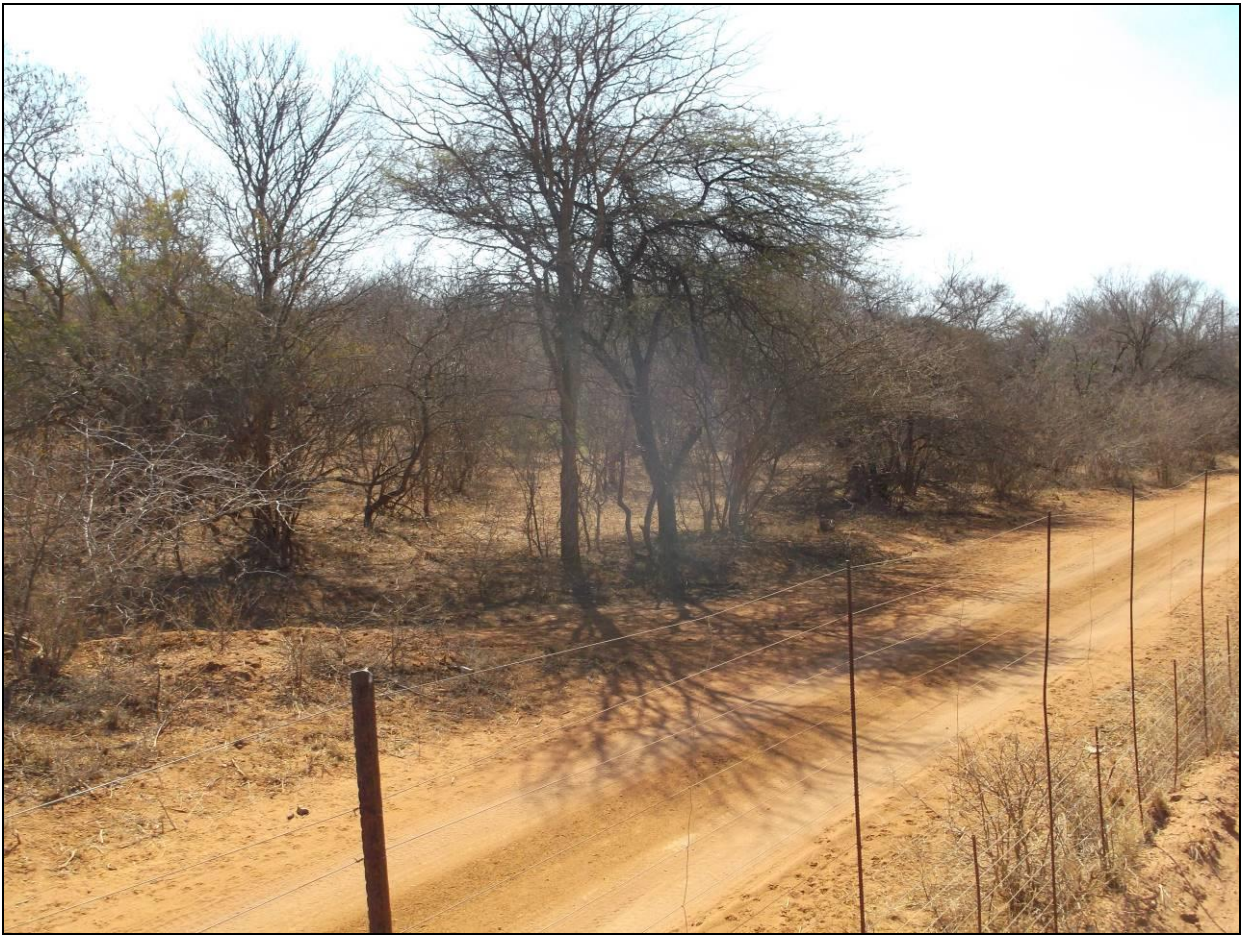
Figure 9: View from the site to the north-west.