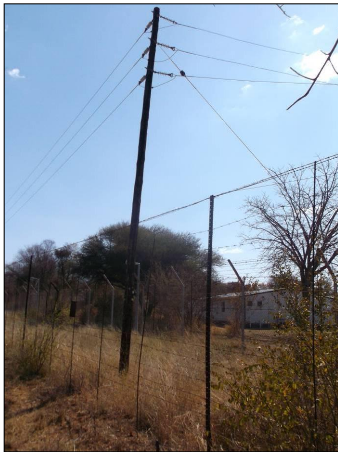
Figure 10: View of existing Eskom line in the vicinity of the proposed site.