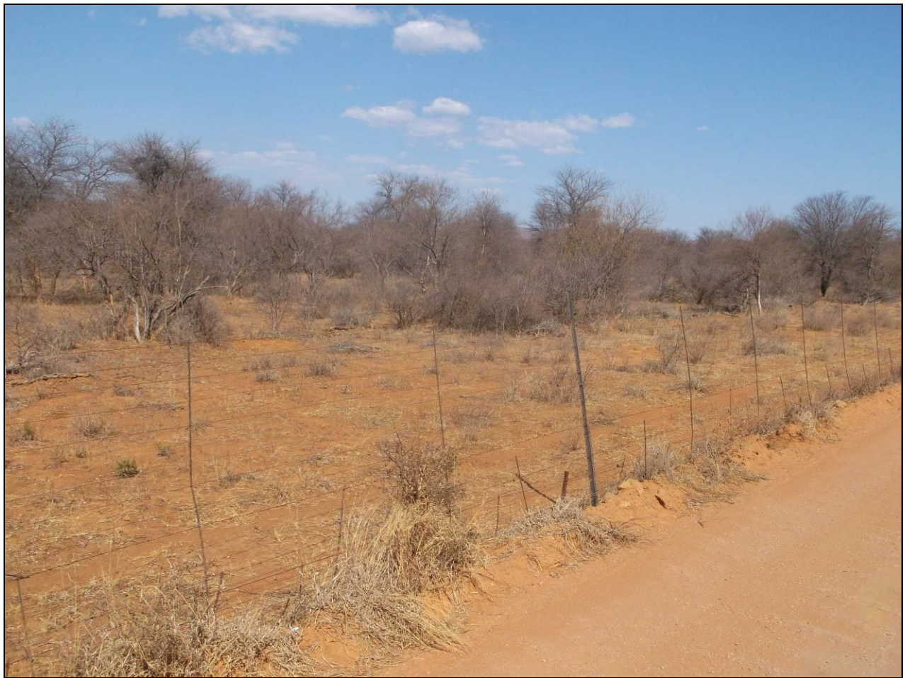
Figure 5: View from the site to the south-east.