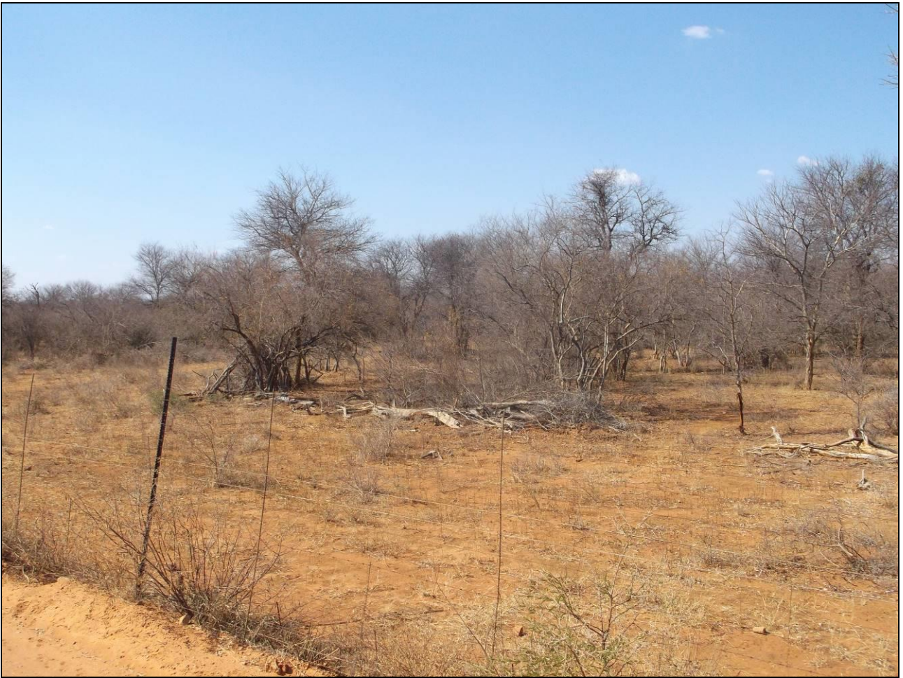
Figure 3: View from the site to the north-east.