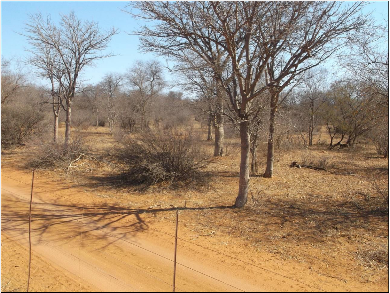
Figure 7: View from the site to south-west.