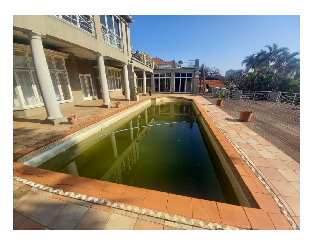
FIG.5. South East Elevation of Existing house