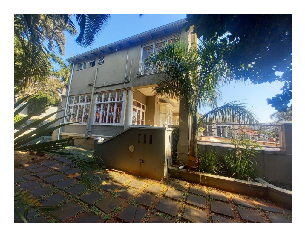
FIG.3. South East Elevation of Existing house