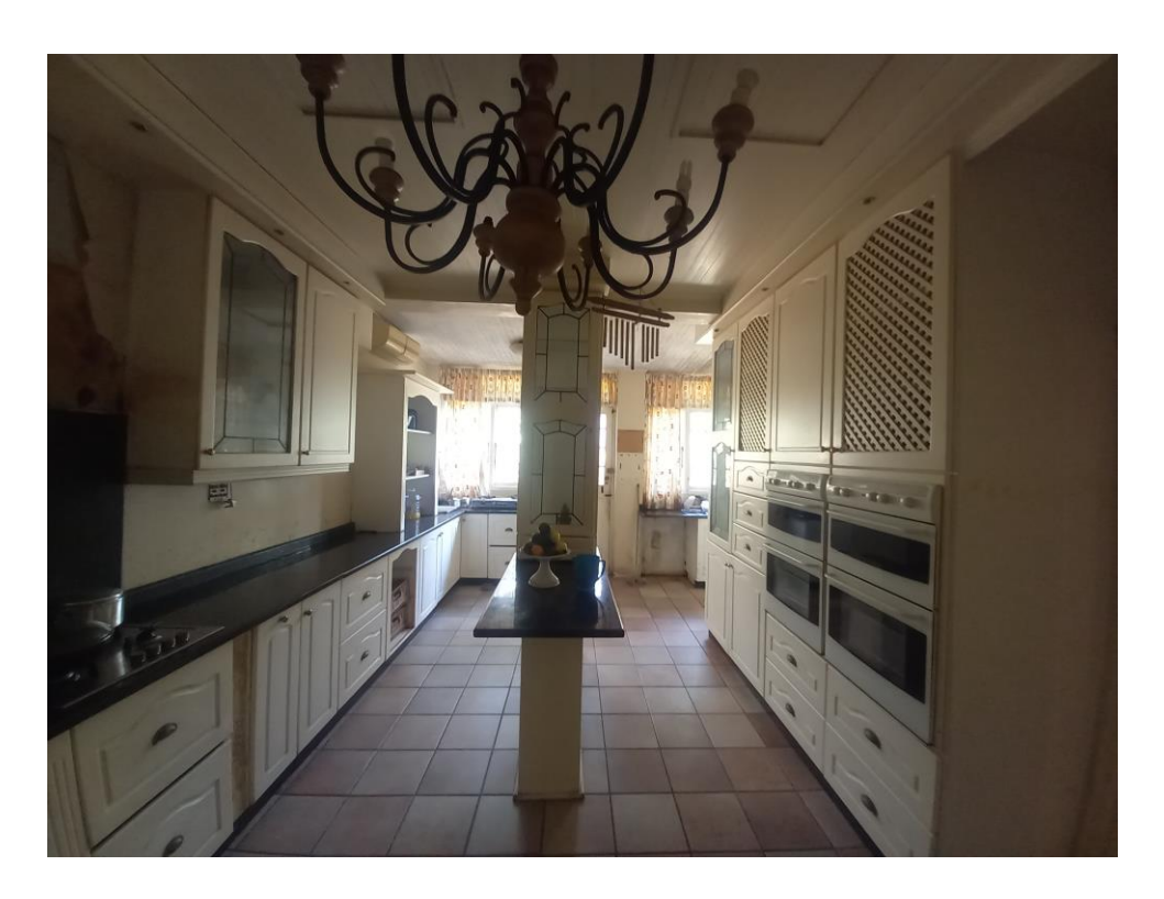
FIG 6. Existing Kitchen