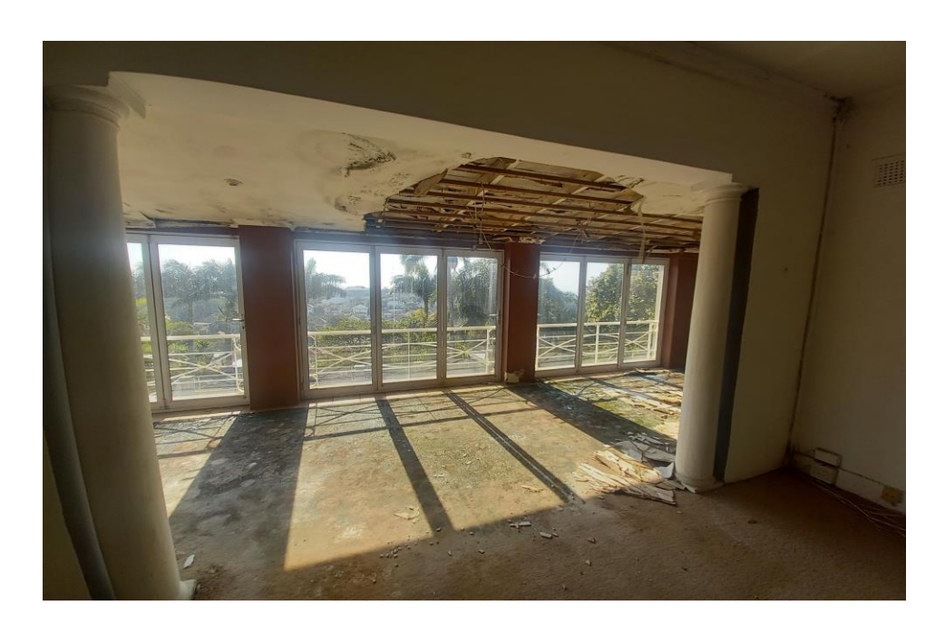
FIG. 7. View from master bedroom to existing balcony