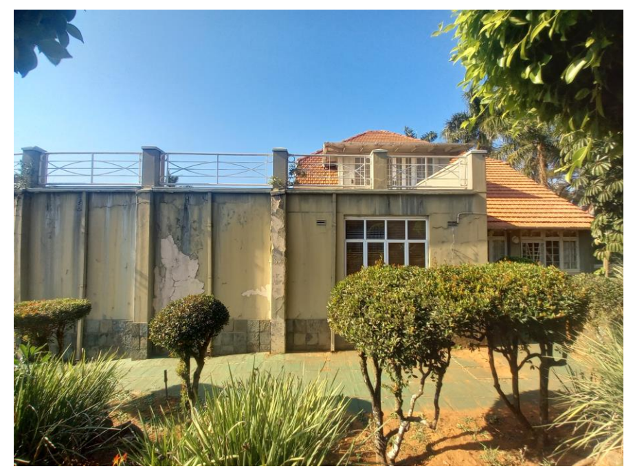
FIG. 9. North West Elevation