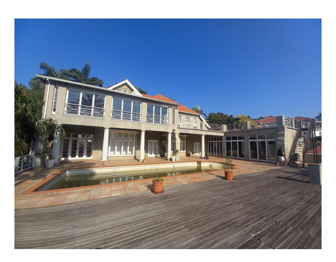
FIG.4. North East Elevation of Existing house