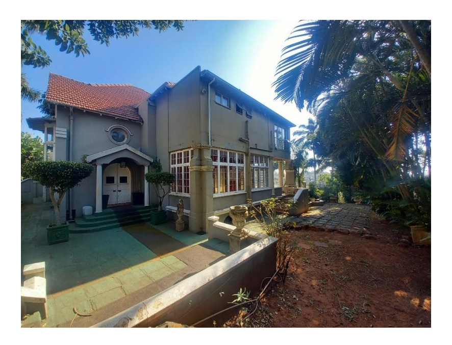
FIG.2 South East Elevation of Existing house