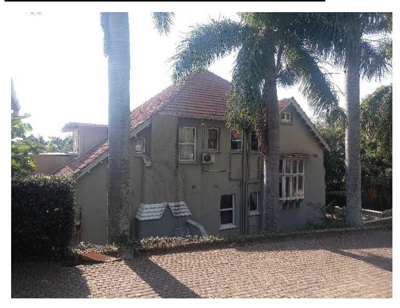
FIG. 1. South West Elevation of Existing house