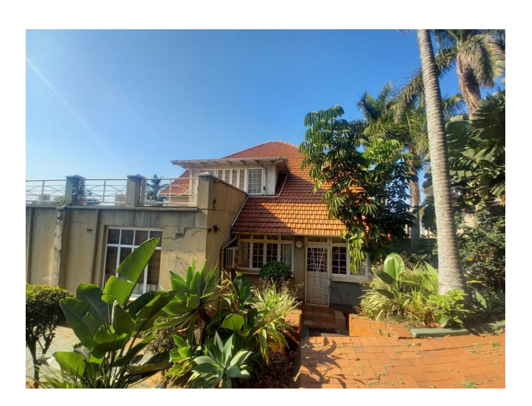
FIG. 10. North West Elevation