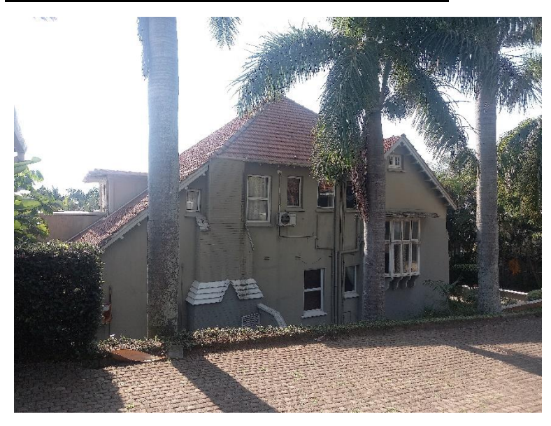
FIG. 1. South West Elevation of Existing house