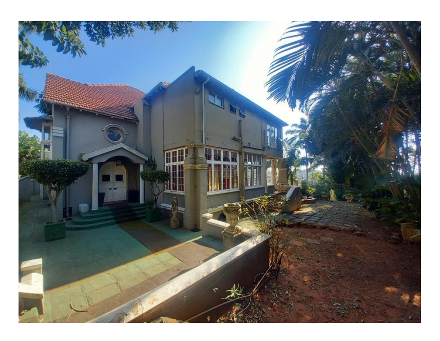
FIG.2 South East Elevation of Existing house