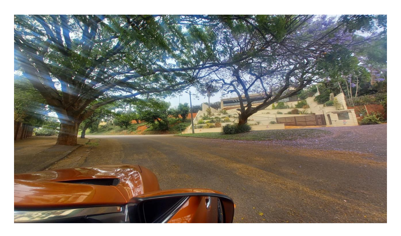
FIG. 13. Street view (Hollander Crescent)