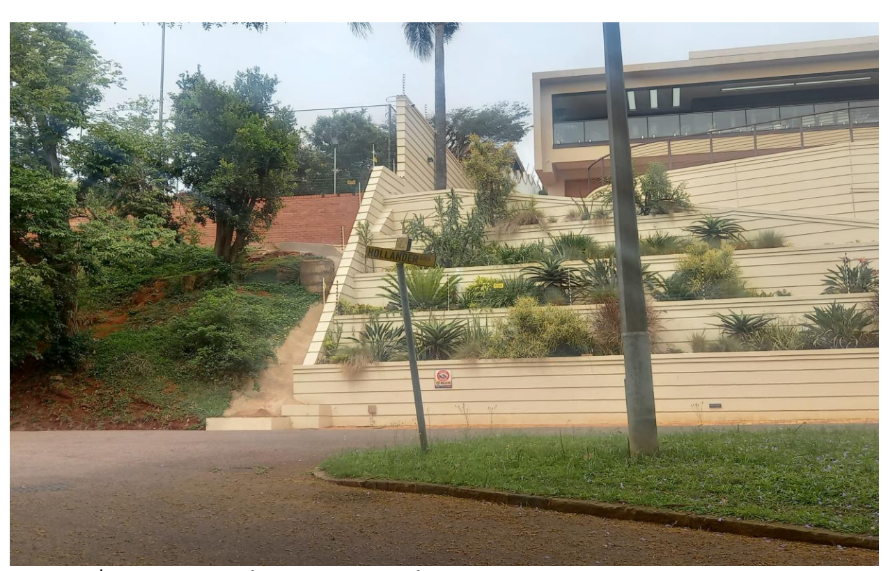
FIG. 14. 2<sup>nd</sup> Door Neighbour (Hollander Crescent)