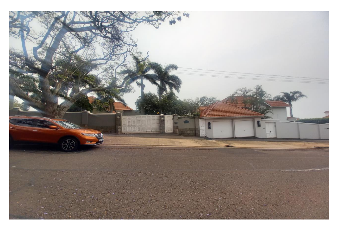
FIG. 11. Street view (Sir Arthur Road)