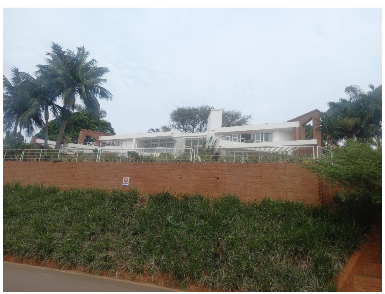
FIG. 16. Neighbour (Hollander Crescent)