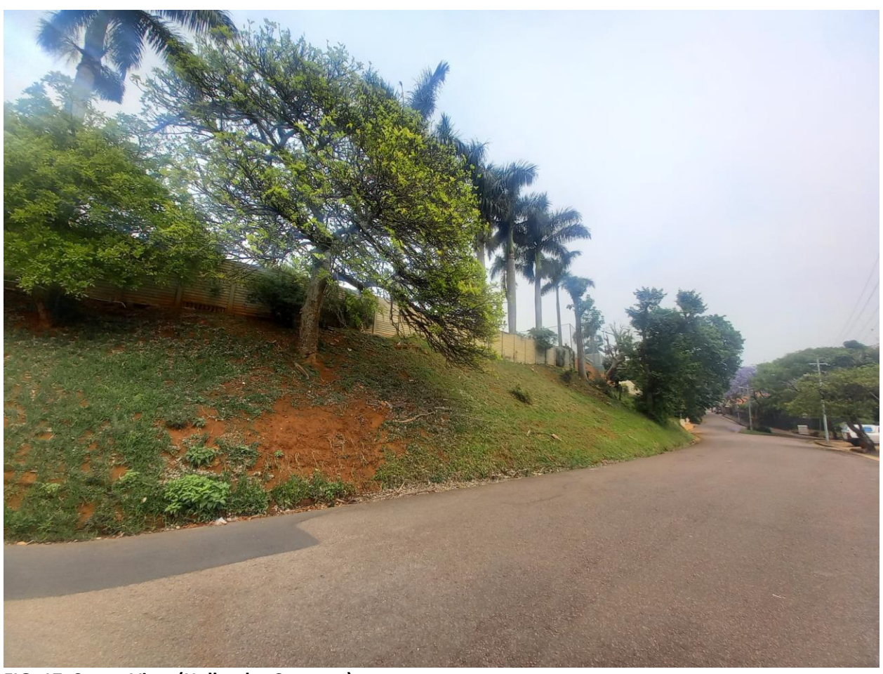
FIG. 17. Street View (Hollander Crescent)