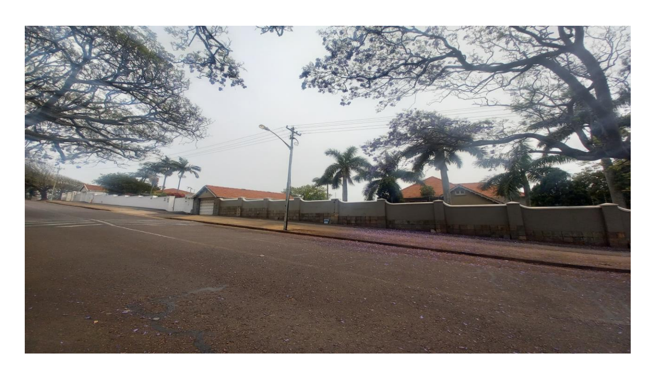
FIG. 12. Street view (Sir Arthur Road)