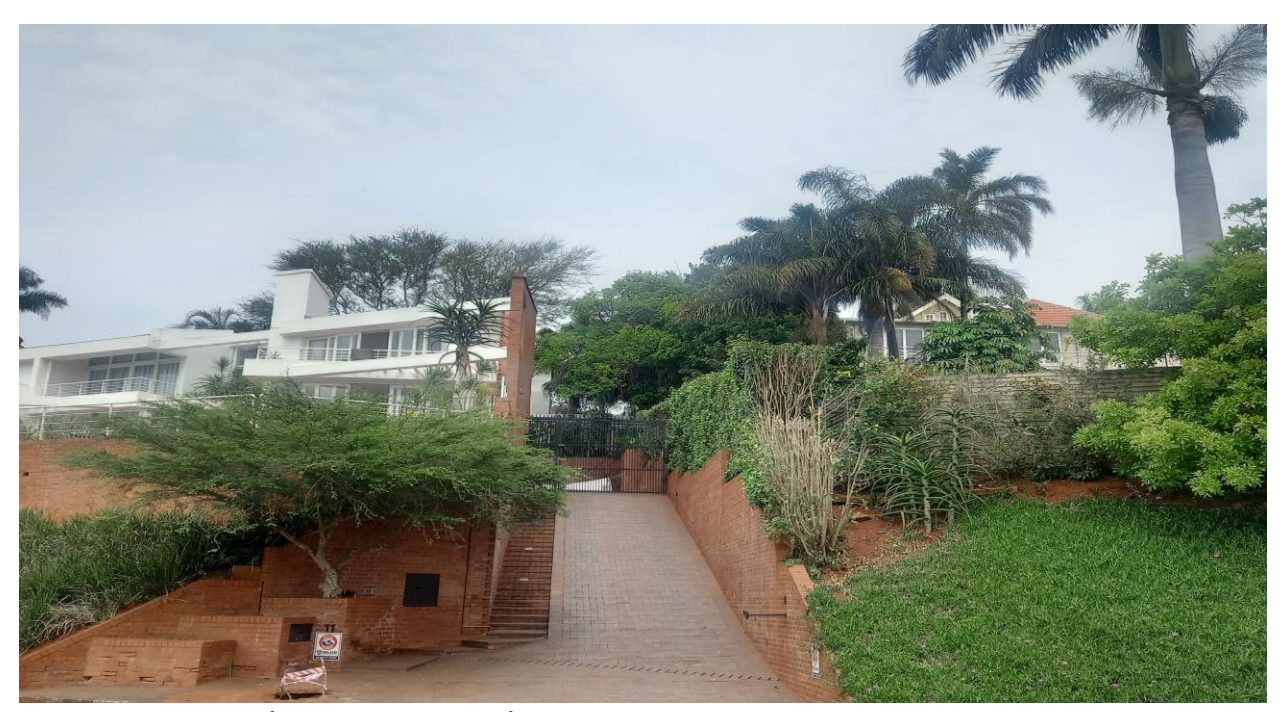
FIG. 15. Street View (Hollander Crescent)