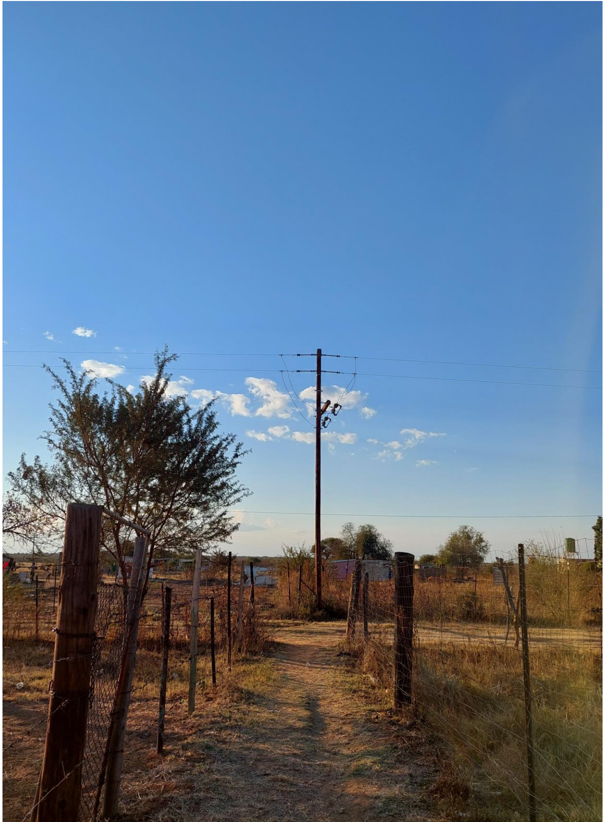
PICTURE SHOWING THE EXISTING POWERLINE IN THE SYUDY AREA