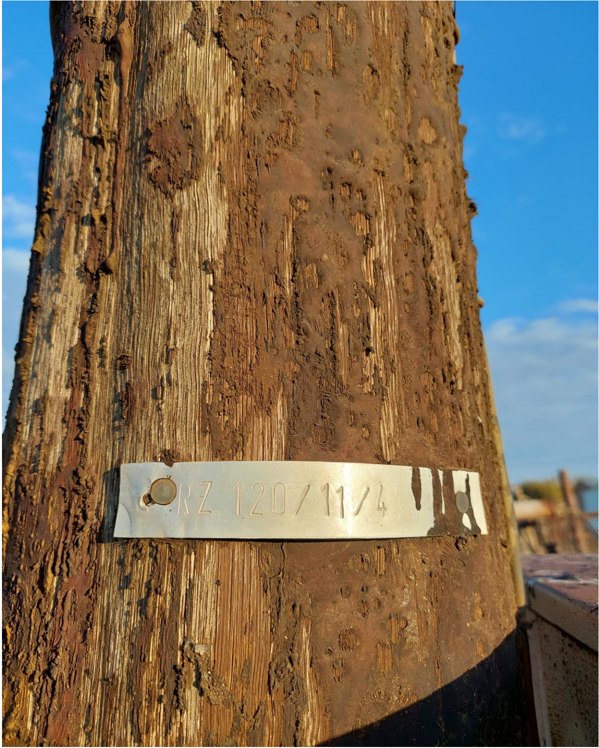
PICTURE SHOWING THE POLE NUMBER WHERE THE PROPOSED LINE WILL BE CONNECTED