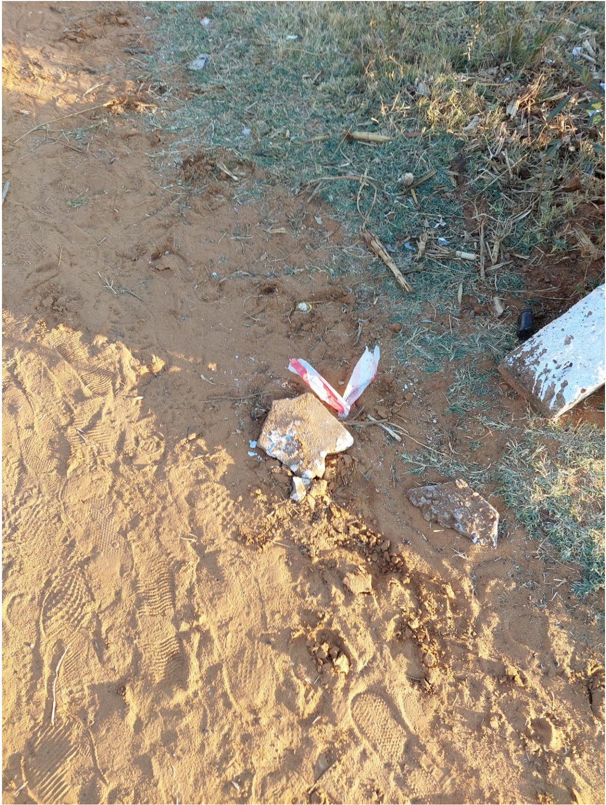
PICTURE SHOWING THE PROPOSED POLE POSITION