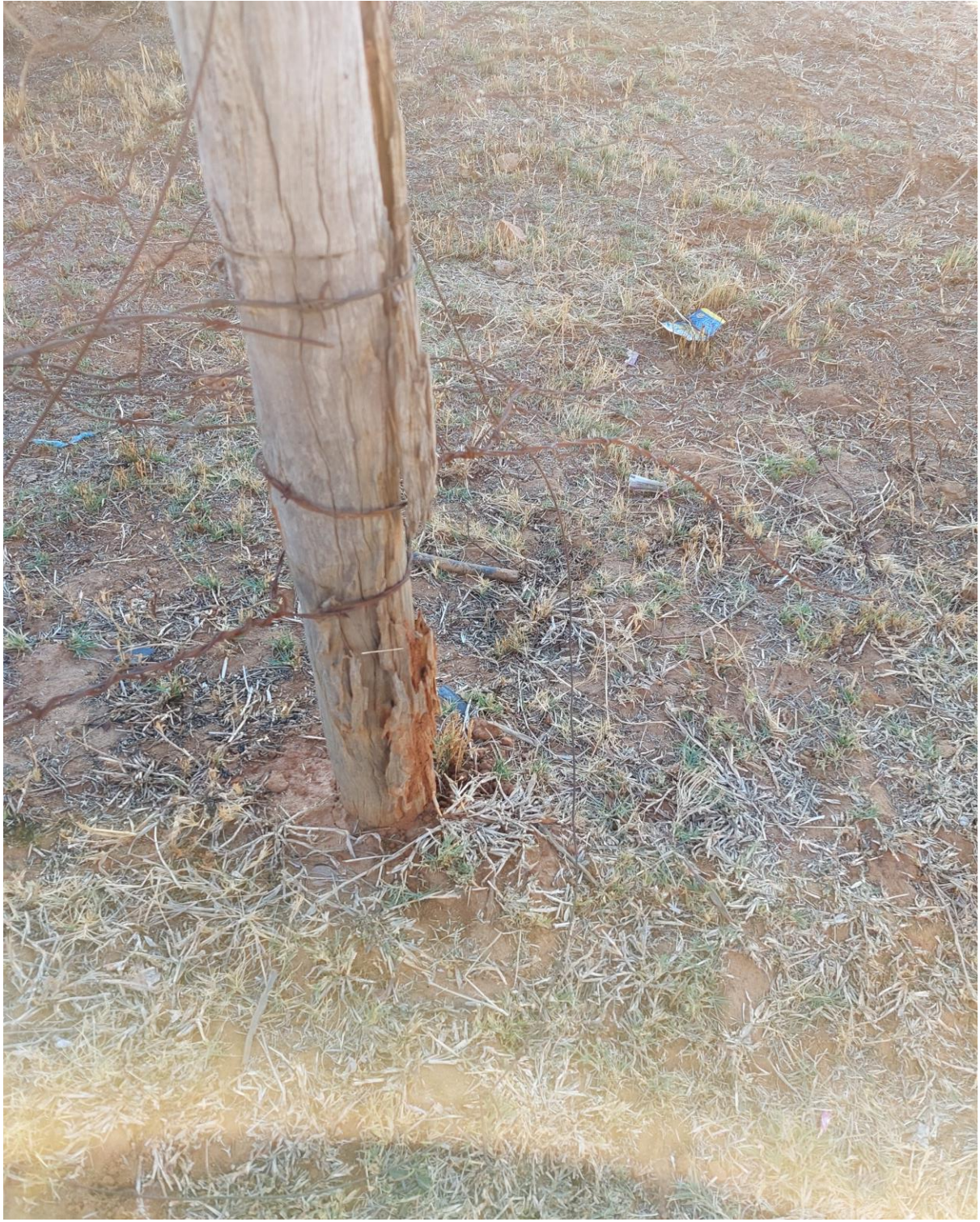
PICTURE SHOWING ANOTHER PROPOSED POLE POSITION