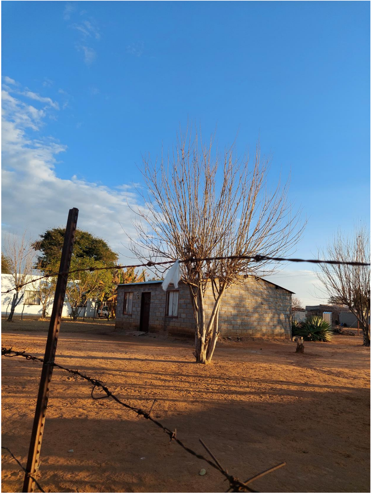
PICTURE SHOWING ANOTHER PROPOSED POLE POSITION