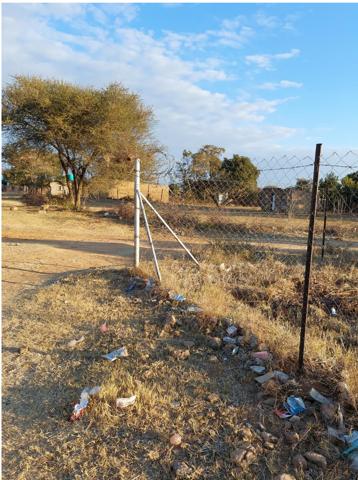
PICTURE SHOWING TREE SPECIES IN THE STUDY AREA