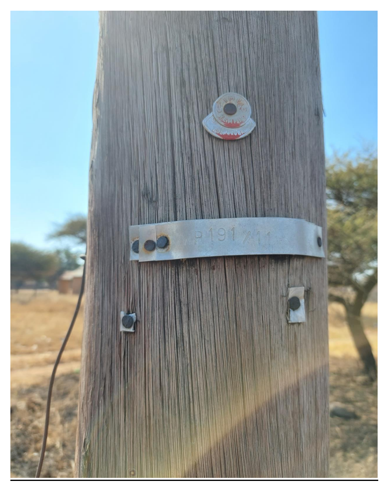
PICTURE SHOWING THE POLE NUMBER WHERE THE PROPOSED LINE WILL BE CONNECTED