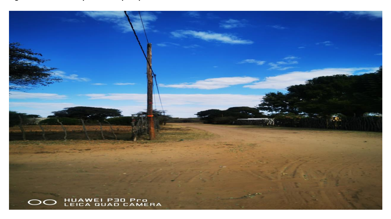
Figure 6: Existing road in the project area