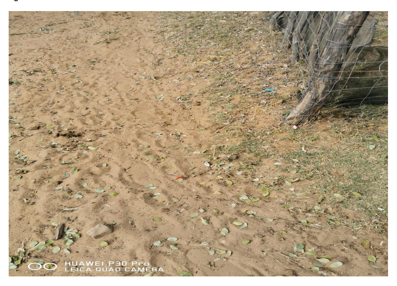
Figure 10: Another Pole position