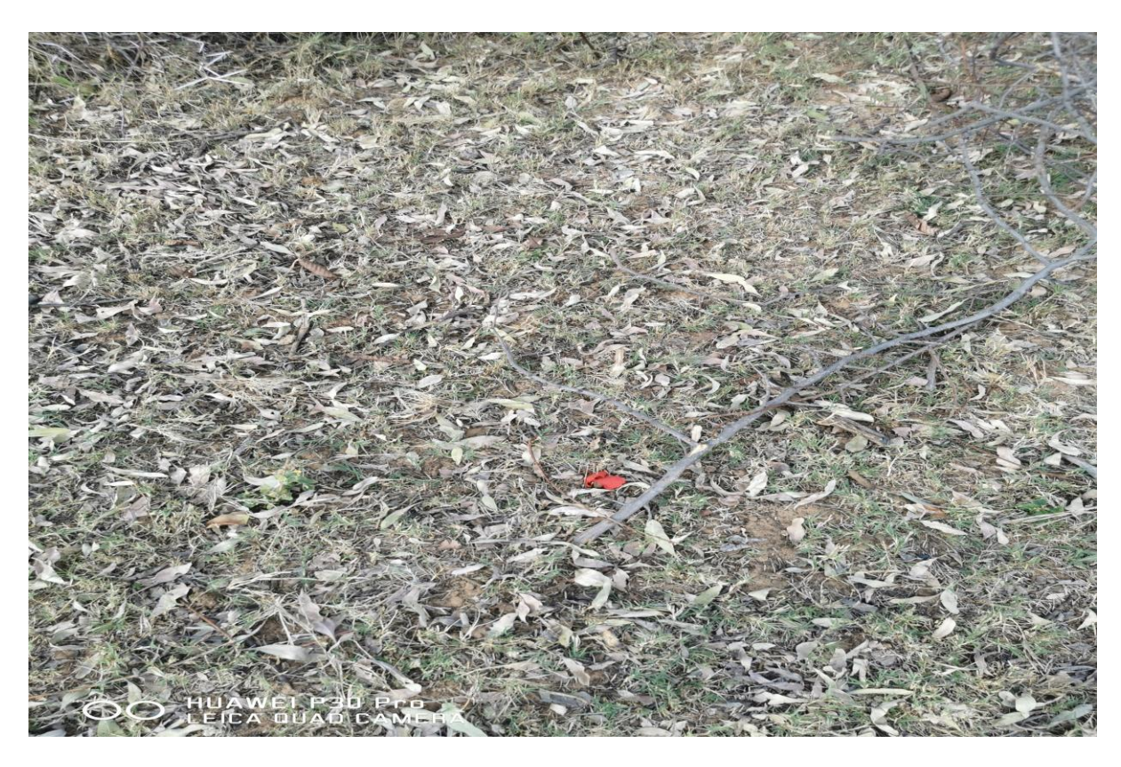
Figure 7: Pole position in the project area