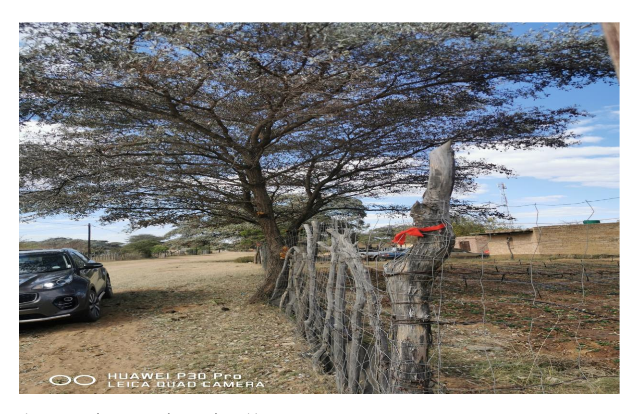
Figure 5: Another Proposed new pole position