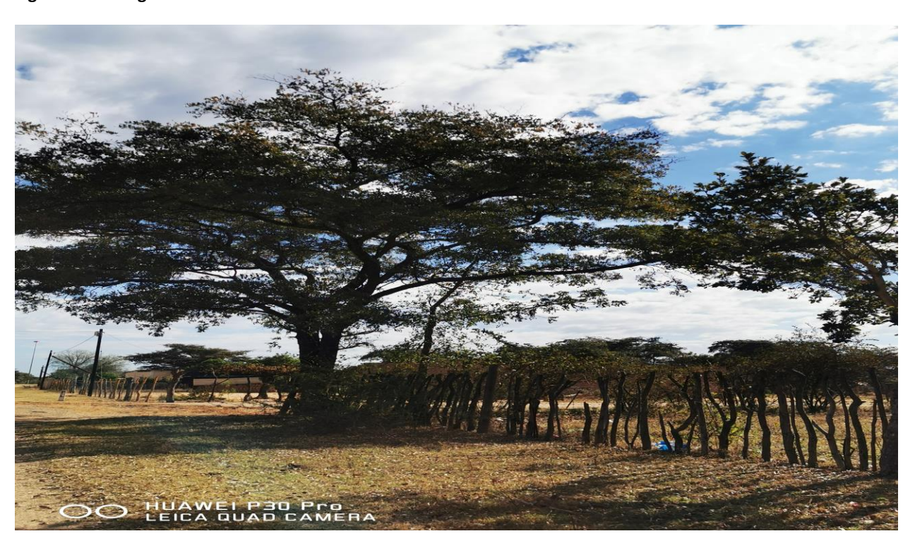
Figure 4: Vegetation type of the project area