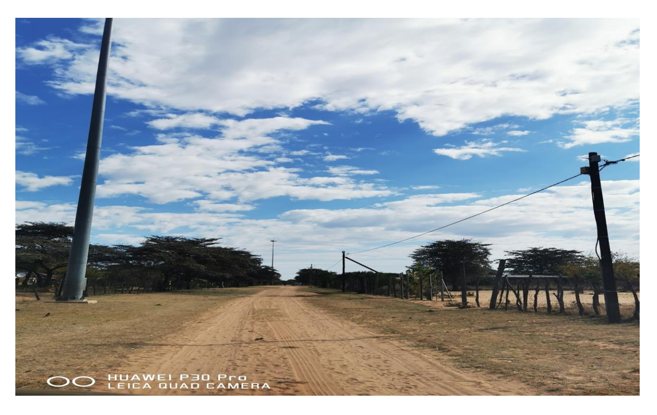
Figure 3: Existing road and Powerline