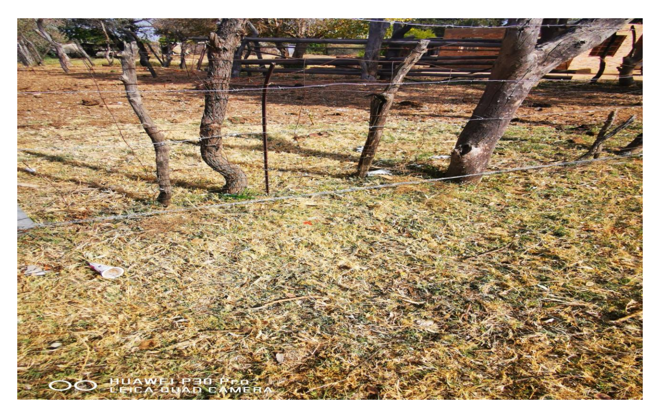
Figure 9: Another Pole Position