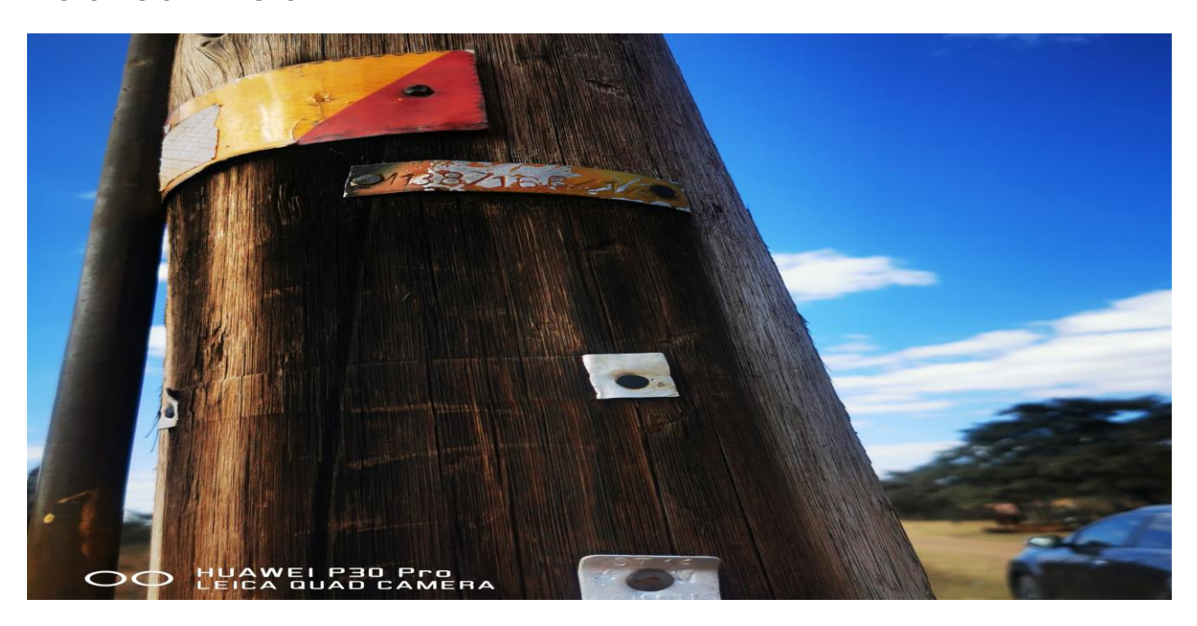
Figure 1: Existing pole number where the electricity will be supplied from