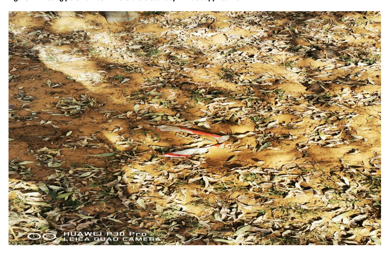
Figure 2: Proposed new pole position