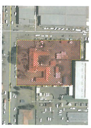
SITE LOCATION SCALE 1 : NTS

GENERAL NOTES 1. ALL WORK SHALL BE IN ACCORDANCE WITH THE SINGAPORE BUILDING REGULATIONS AND THE SINGAPORE STANDARD SPECIFICATIONS FOR BUILDINGS. 2. THE CONTRACTOR SHALL BE RESPONSIBLE FOR OBTAINING ALL NECESSARY PERMITS AND APPROVALS FROM THE RELEVANT AUTHORITIES. 3. THE CONTRACTOR SHALL BE RESPONSIBLE FOR THE PROTECTION OF ALL EXISTING UTILITIES AND STRUCTURES TO REMAIN. 4. ALL MATERIALS AND WORKMANSHIP SHALL BE SUBJECT TO INSPECTION AND APPROVAL BY THE ARCHITECT. 5. THE CONTRACTOR SHALL BE RESPONSIBLE FOR THE PROTECTION OF ALL EXISTING UTILITIES AND STRUCTURES TO REMAIN. 6. ALL MATERIALS AND WORKMANSHIP SHALL BE SUBJECT TO INSPECTION AND APPROVAL BY THE ARCHITECT. 7. THE CONTRACTOR SHALL BE RESPONSIBLE FOR THE PROTECTION OF ALL EXISTING UTILITIES AND STRUCTURES TO REMAIN. 8. ALL MATERIALS AND WORKMANSHIP SHALL BE SUBJECT TO INSPECTION AND APPROVAL BY THE ARCHITECT. 9. THE CONTRACTOR SHALL BE RESPONSIBLE FOR THE PROTECTION OF ALL EXISTING UTILITIES AND STRUCTURES TO REMAIN. 10. ALL MATERIALS AND WORKMANSHIP SHALL BE SUBJECT TO INSPECTION AND APPROVAL BY THE ARCHITECT.