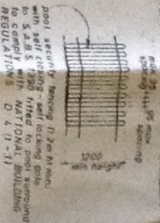
POOL SECURITY FENCING (SECURITY FENCE & GATE TO BE POSITIONED BY OWNERS)