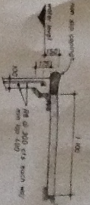
SURROUND BEAM DETAIL D1 1:20