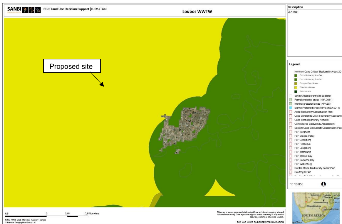
Figure 3: SANBI BGIS map of the Northern Cape Critical Biodiversity Areas (2016) showing the location of the proposed development site within an “Other Natural Area”.