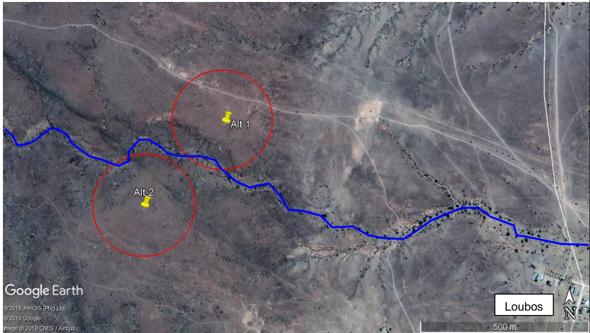
Figure 2: Google Earth image of the site, showing the nearest watercourse (blue line) in relation to the site.

The site, including all alternative sites, are subject to moving water during high rainfall events. Any runoff from the sites essentially will flow into Hakskeen Pan through Sub-Catchment 2.