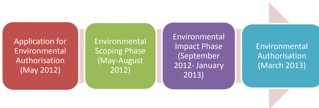
Figure 1: Project timeline