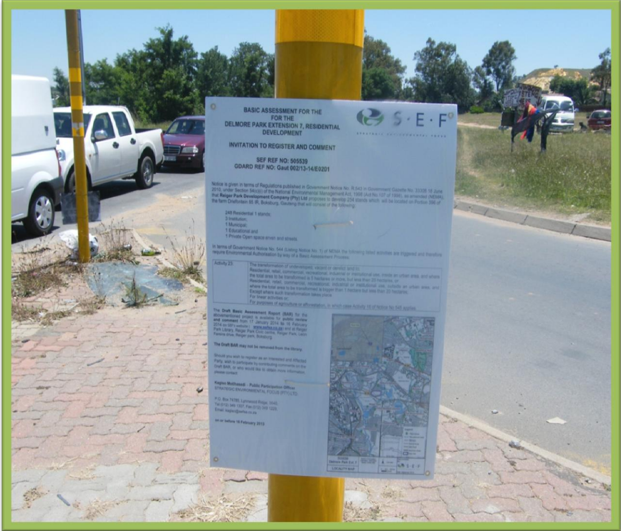
Figure1. Corner Lower Boksburg Road (Commissioner) and Witdeep Road