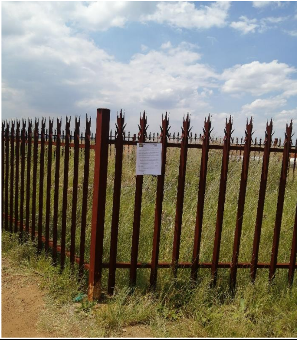
Joe Arnison Street, Labore, Brakpan