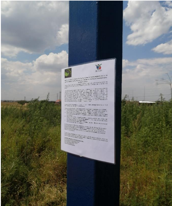
Mine Road, Labore, Brakpan