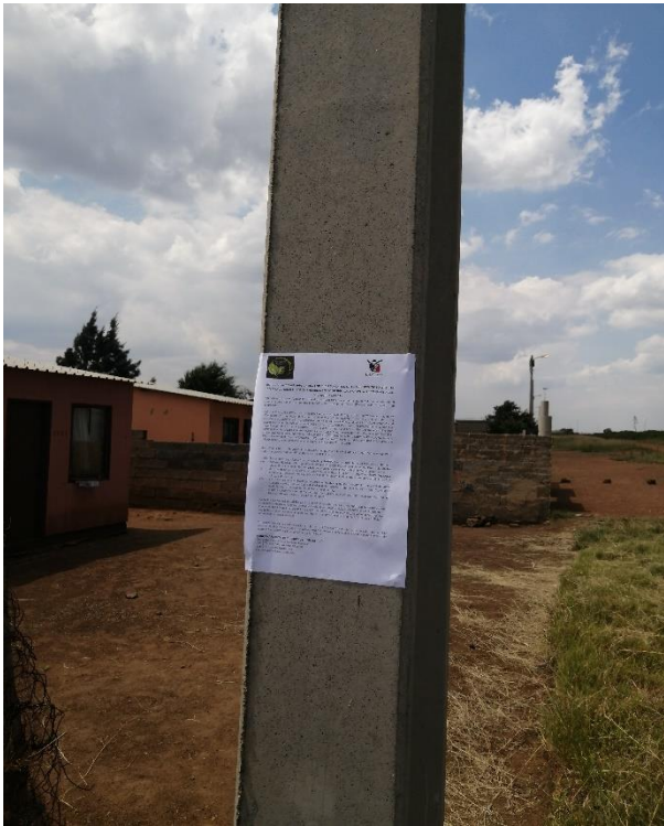
Boland Street, Labore, Brakpan