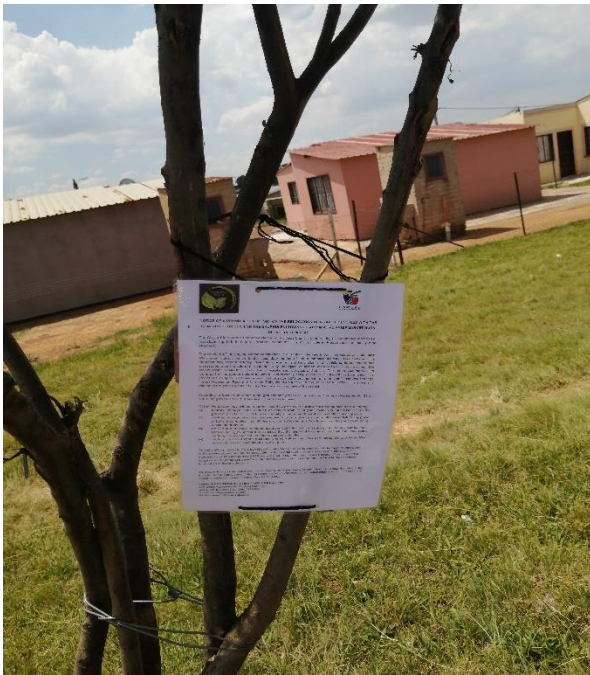
1875 Kiwi, Geluksdal, Brakpan