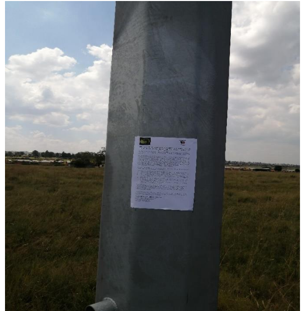
Boland Street, Labore, Brakpan