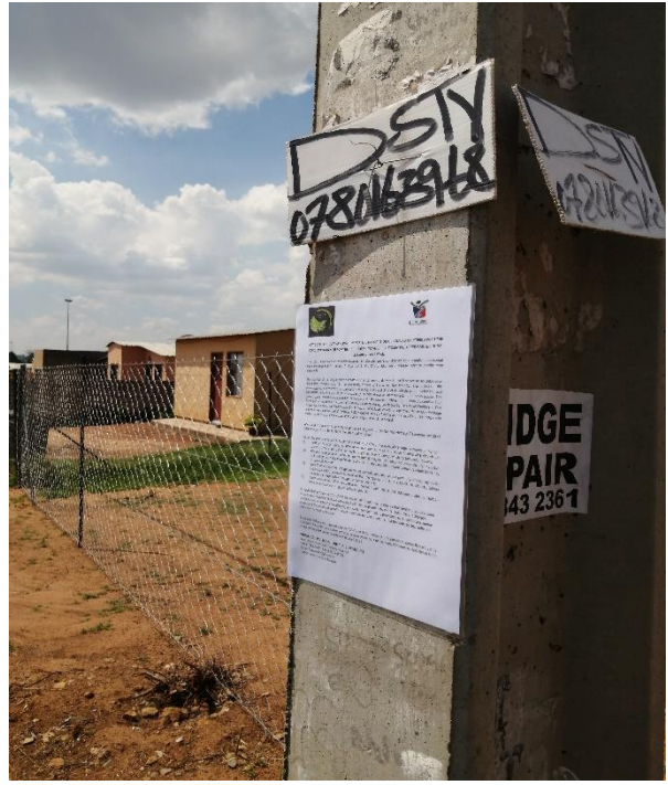
Mine Road, Labore, Brakpan