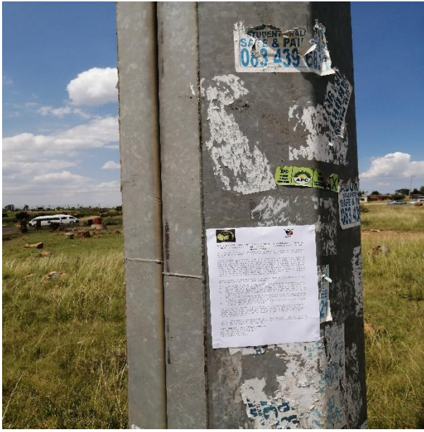
12 TH Road Labore, Langaville, Brakpan