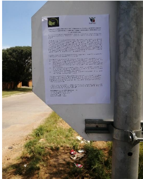
2 Joule Street, Labore, Brakpan, 26°19'56"S, 28°21'47"E