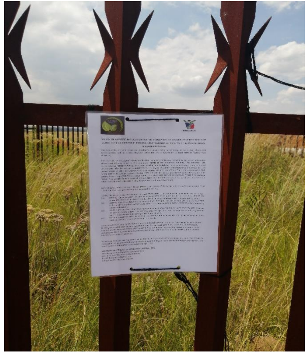
Joe Arnison Street, Labore, Brakpan