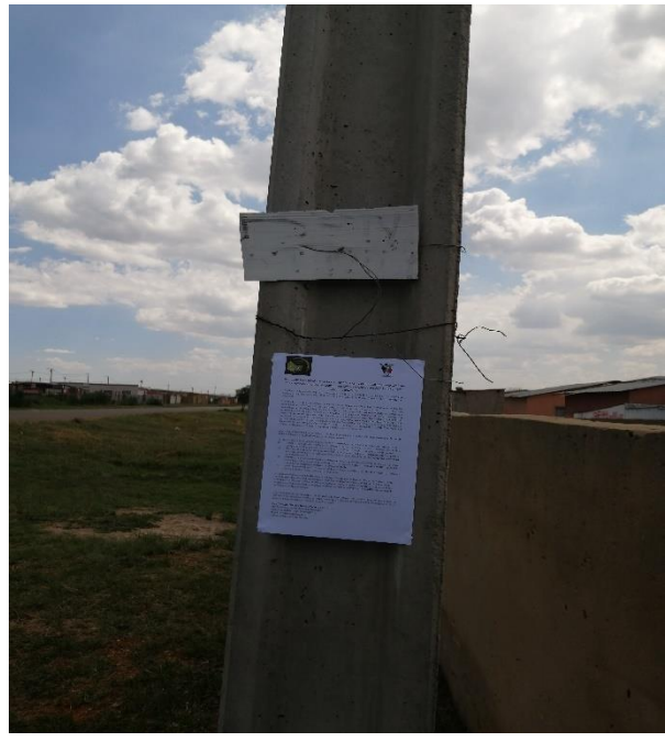
1875 Kiwi, Geluksdal, Brakpan