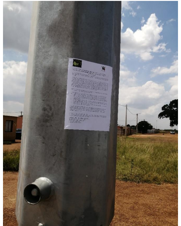
Unnamed Road, Withok Estate, Brakpan