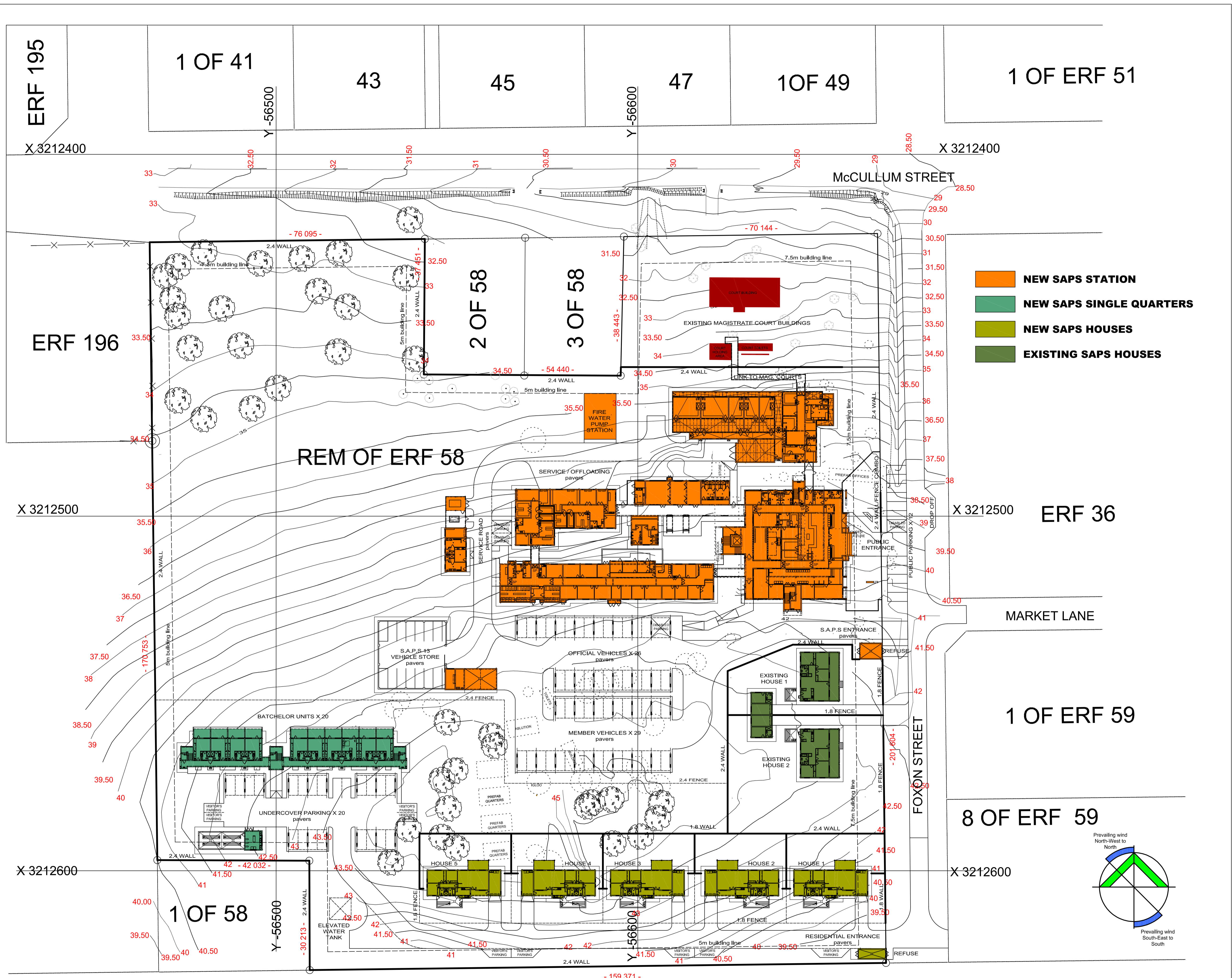
SITE LAYOUT Scale 1:500