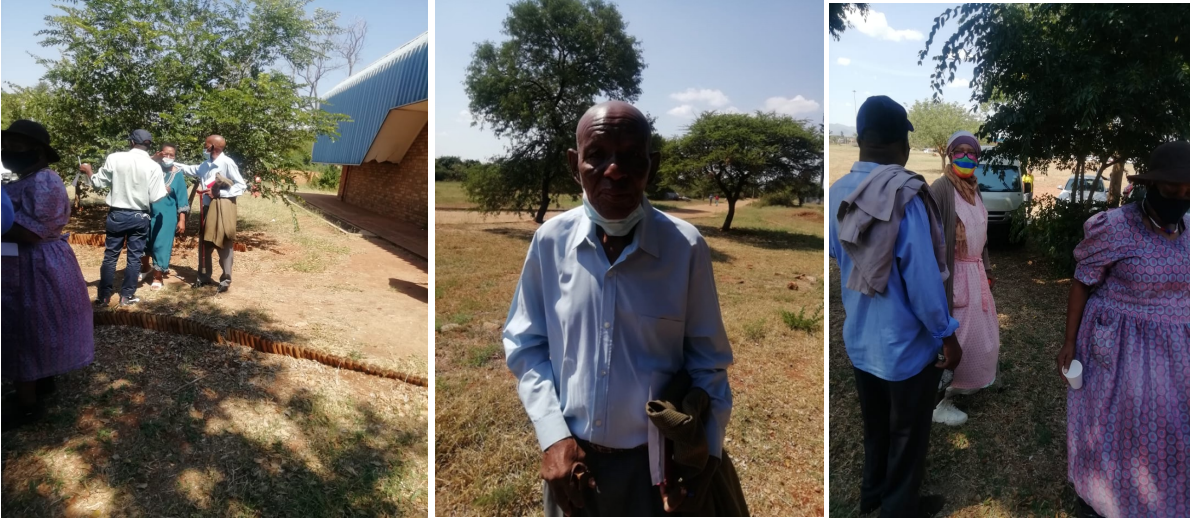
Figure 3: Participants at the meeting held in the multi-purpose centre (02.04.2022)