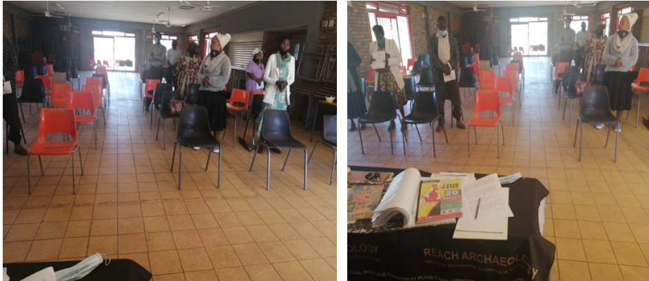
Figure 4: Images of the attendees present at public meeting on 23 April