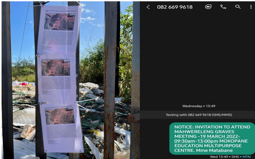
Figure 1: Pictures of the site notices and SMS notifications sent