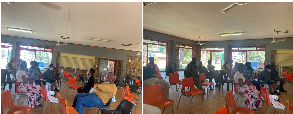
Figure 2: Participants at the meeting held in the multi-purpose centre

The floor was opened for discussion, questions and queries.