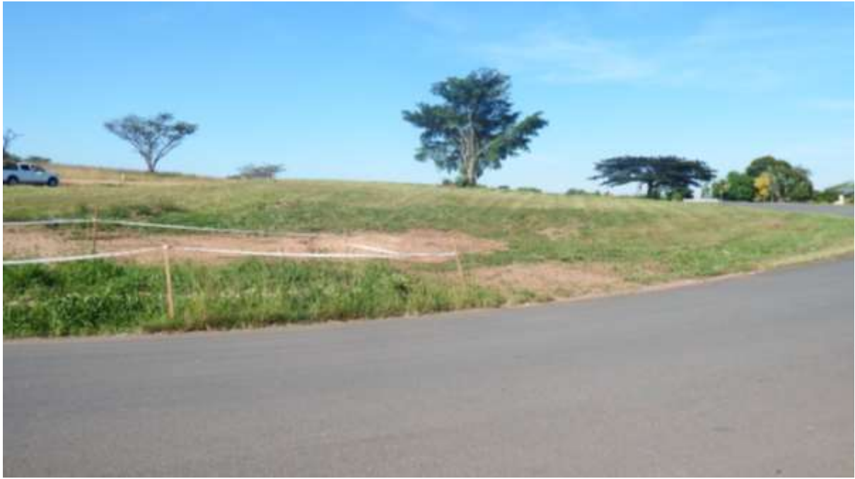
Figure 8: View towards the north at the open piece of land close to the group of houses along Fairview Road