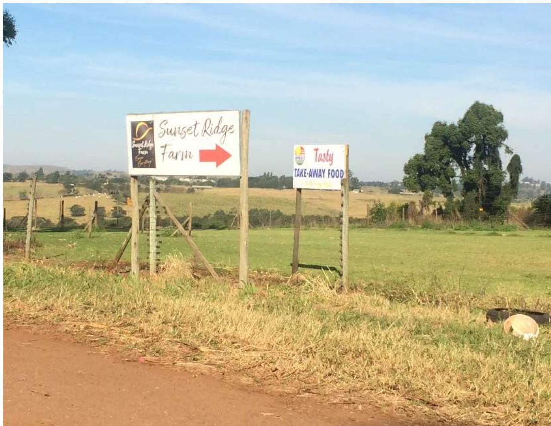
Figure 23: View towards the north east showing some of the signage along the gravel section of the R103 before the Camperdown N3 overpass