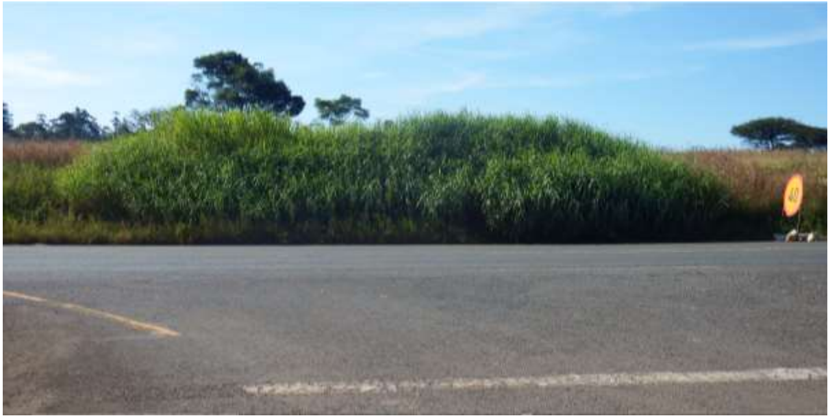
Figure 4: Views north showing the R103 at the intersection with Fairview Road