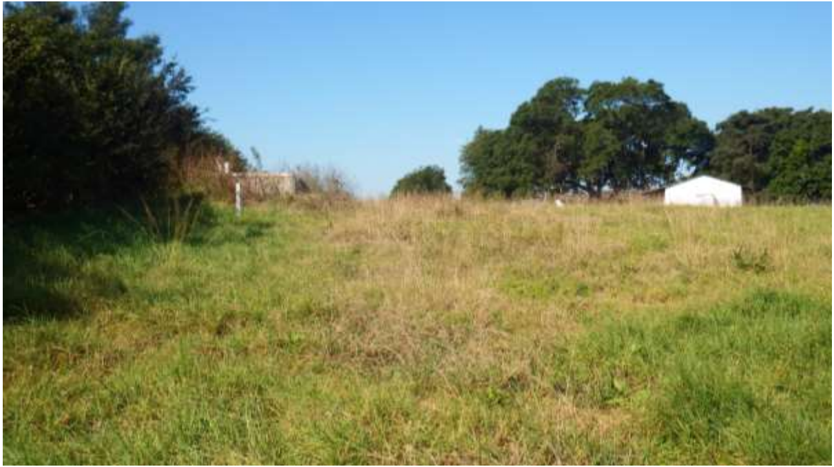
Figure 16: Views towards the east along the proposed R103 with possibly the office of the old Rainbow Chicken Farm in the background on the left