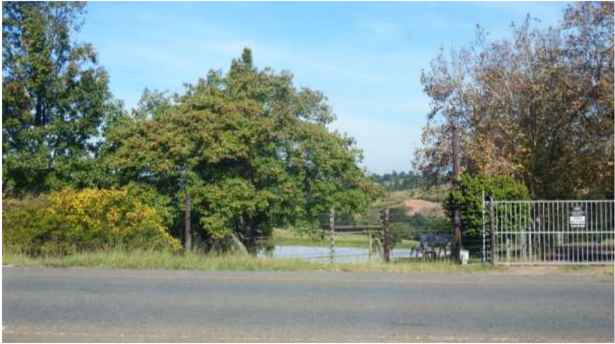
Figure 2: View south towards one of the properties along the western end of the R103