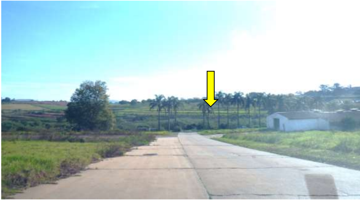
Figure 12: View towards the west showing the proposed location of the R103 in the background among fields (yellow arrow). Photo taken from the old main road within the old Rainbow Chicken Farm