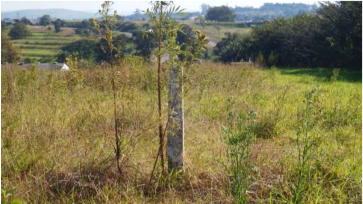
Figure 18: Additional views towards the north showing some of the infrastructure along the proposed R103's servitude