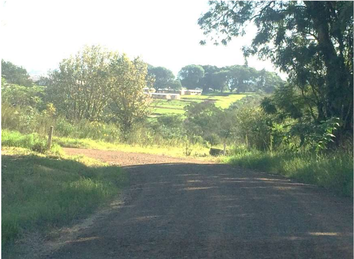
Figure 22: Views towards the east showing the gravel section of the R103