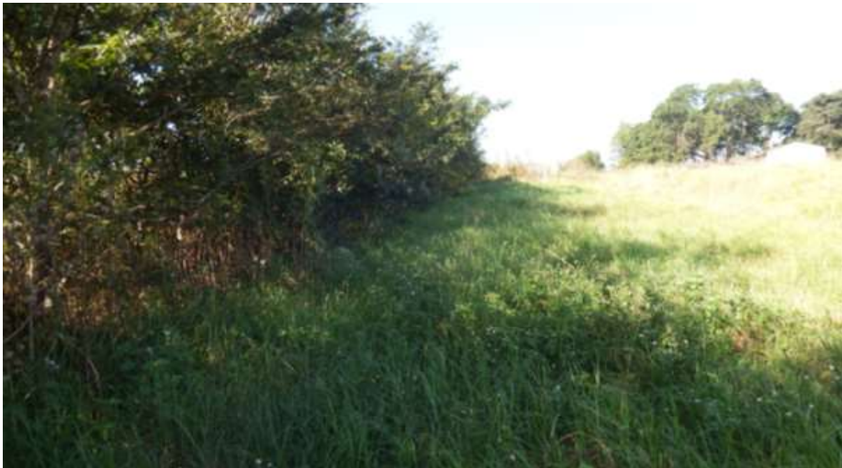
Figure 13: View towards the east showing the proposed R103 location running north of the old Rainbow Chicken Farm