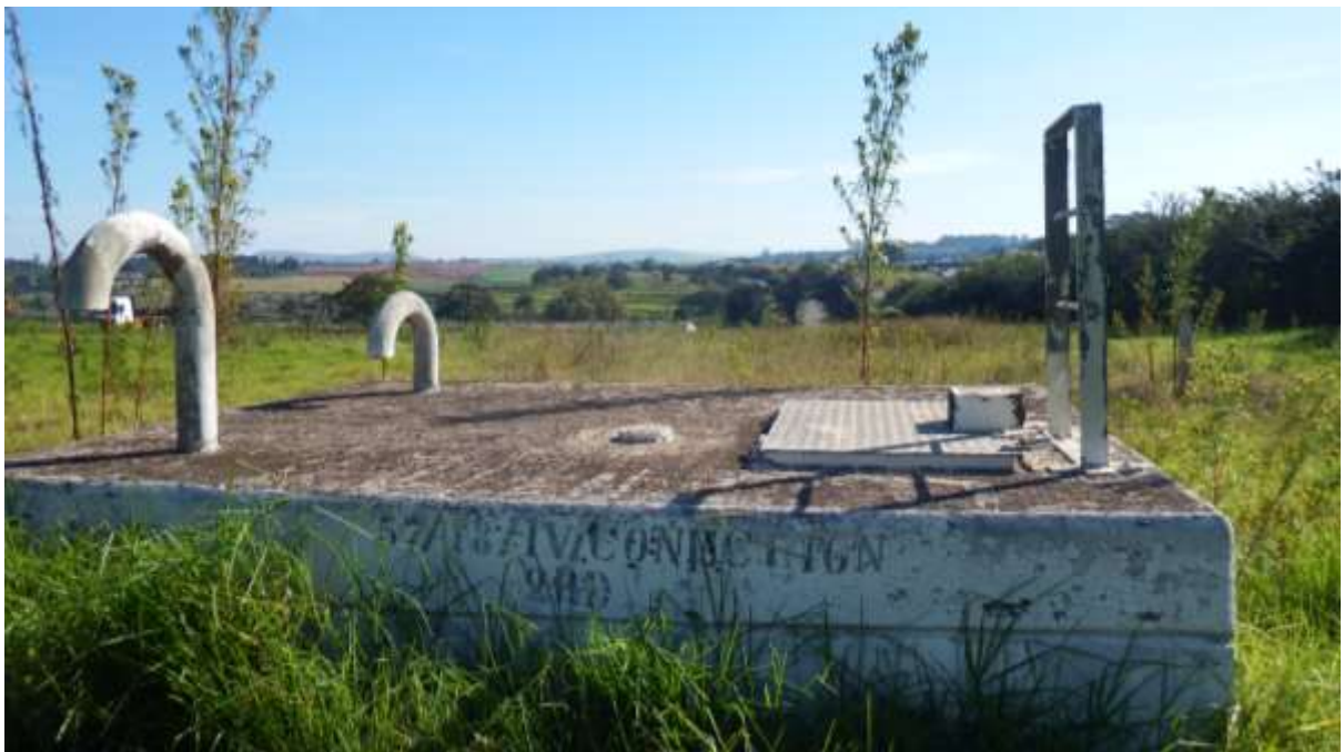
Figure 17: Views towards the west showing Some of the infrastructure along the proposed R103's servitude