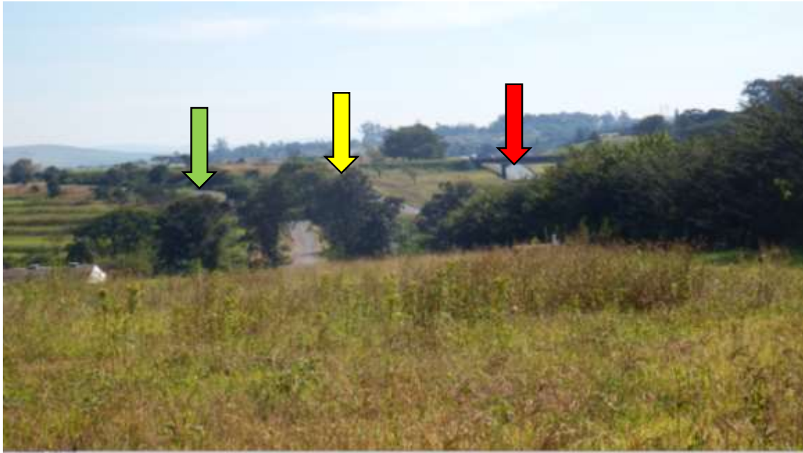
Figure 20: Views from the proposed R103 towards Fairview Road (green arrow) the N3 offramp (yellow arrow) and the N3 (red arrow) in the background