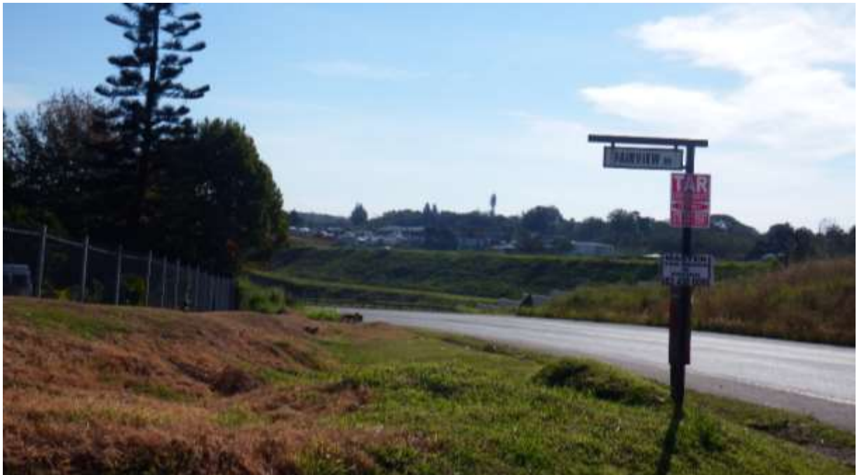
Figure 5: View towards the north west showing the R103 at the intersection with Fairview Road