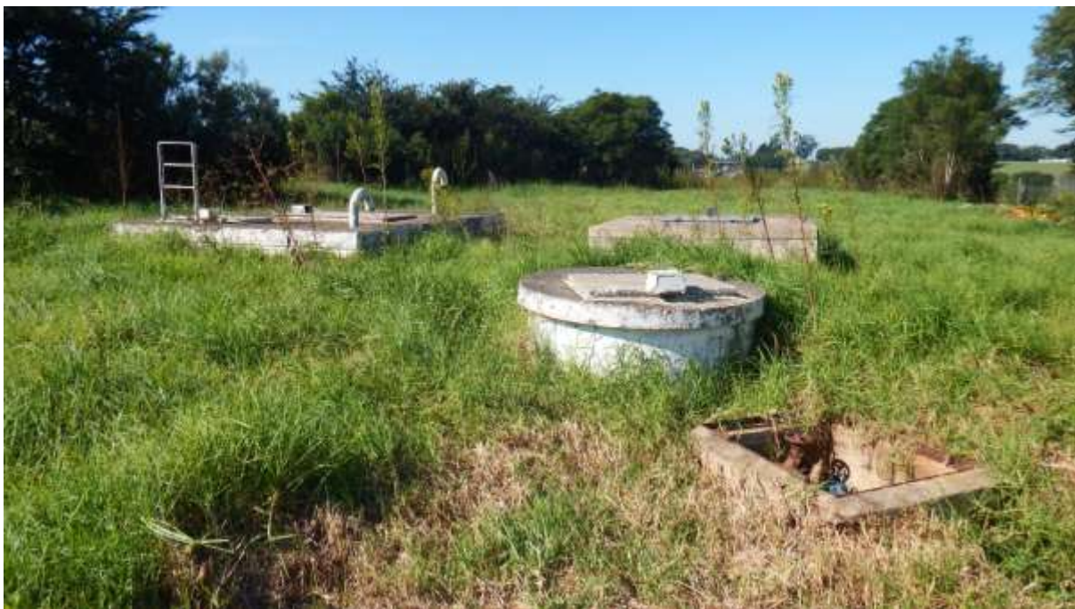
Figure 19: Additional infrastructure along the proposed R103's servitude