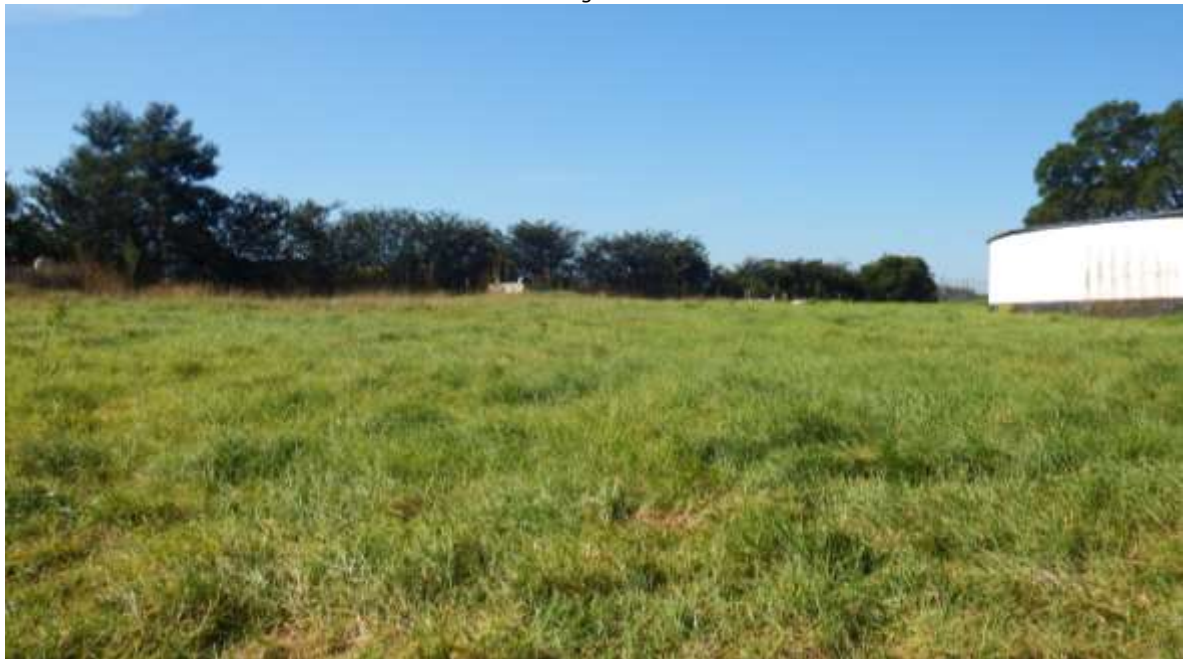
Figure 15 View towards the north east showing the new R103 route with the reservoir of the old Rainbow Chicken Farm on the right