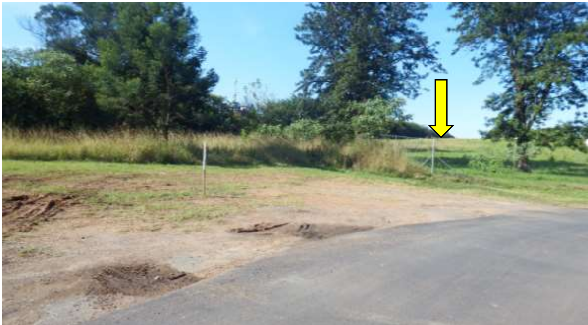
Figure 11: Views towards the north east along Fairview Road showing the portion of the greenfields section of the R103 at the western boundary of the old Rainbow Chicken Farm (see yellow arrow)