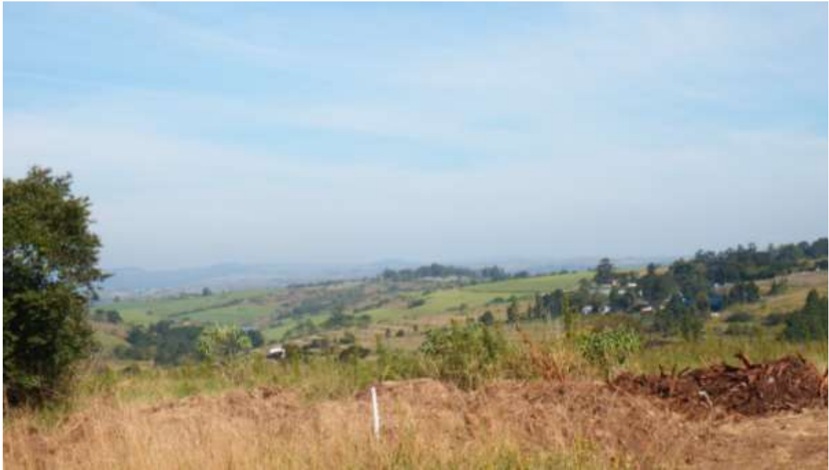
Figure 10: Additional view towards the south showing the area along which part of the greenfields section of the R103 will run