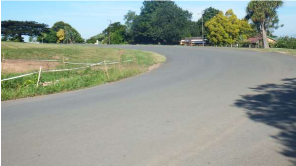
Figure 6: View east towards groups of properties along Fairview Road