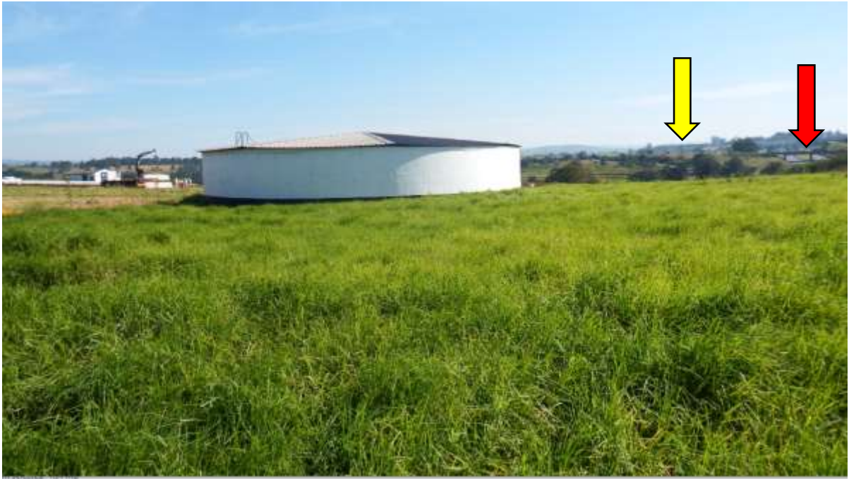
Figure 14: View towards the east showing the reservoir of the old Rainbow Chicken Farm on the left of the image. Part of the proposed R103 is on the right of the image with the N3 offramp (yellow arrow) and the N3 (red arrow) in the background