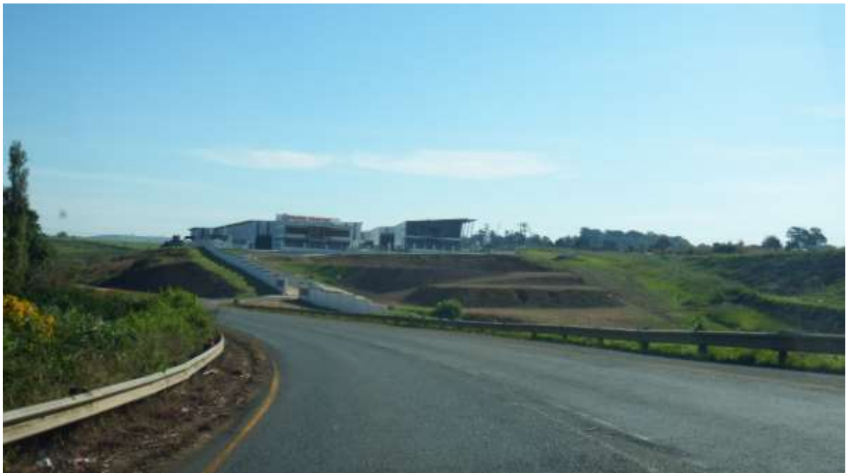
Figure 3: View west along the R103 with Mustapha Business Park in the background on the right of the photograph