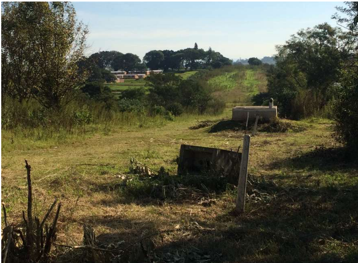
Figure 21: Views towards the west towards part of the proposed greenfield section of the R103 with the old Rainbow Chicken Farm in the background on the left and some of the infrastructure along the proposed road's servitude