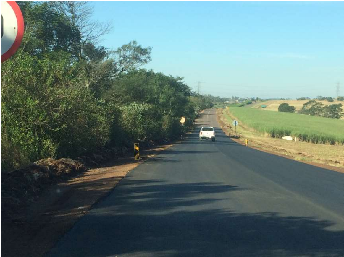
Figure 24: Views west towards the R103 undergoing routine maintenance