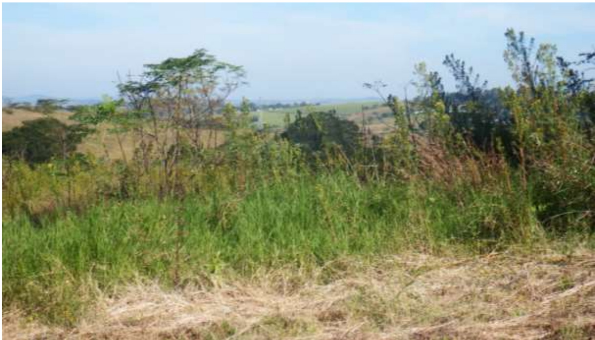
Figure 9: View towards the south showing the area along which part of the greenfield section of the R103 will run