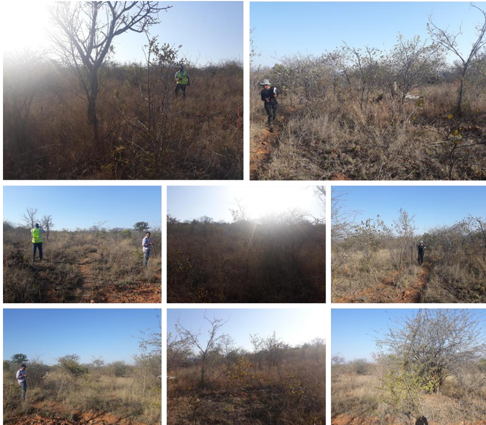
Figure 2: Site pictures