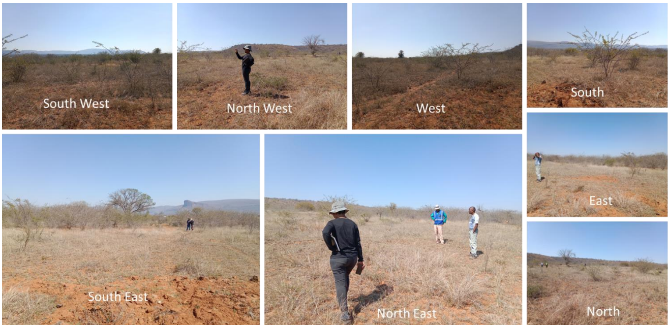
Figure 2: Site Pictures