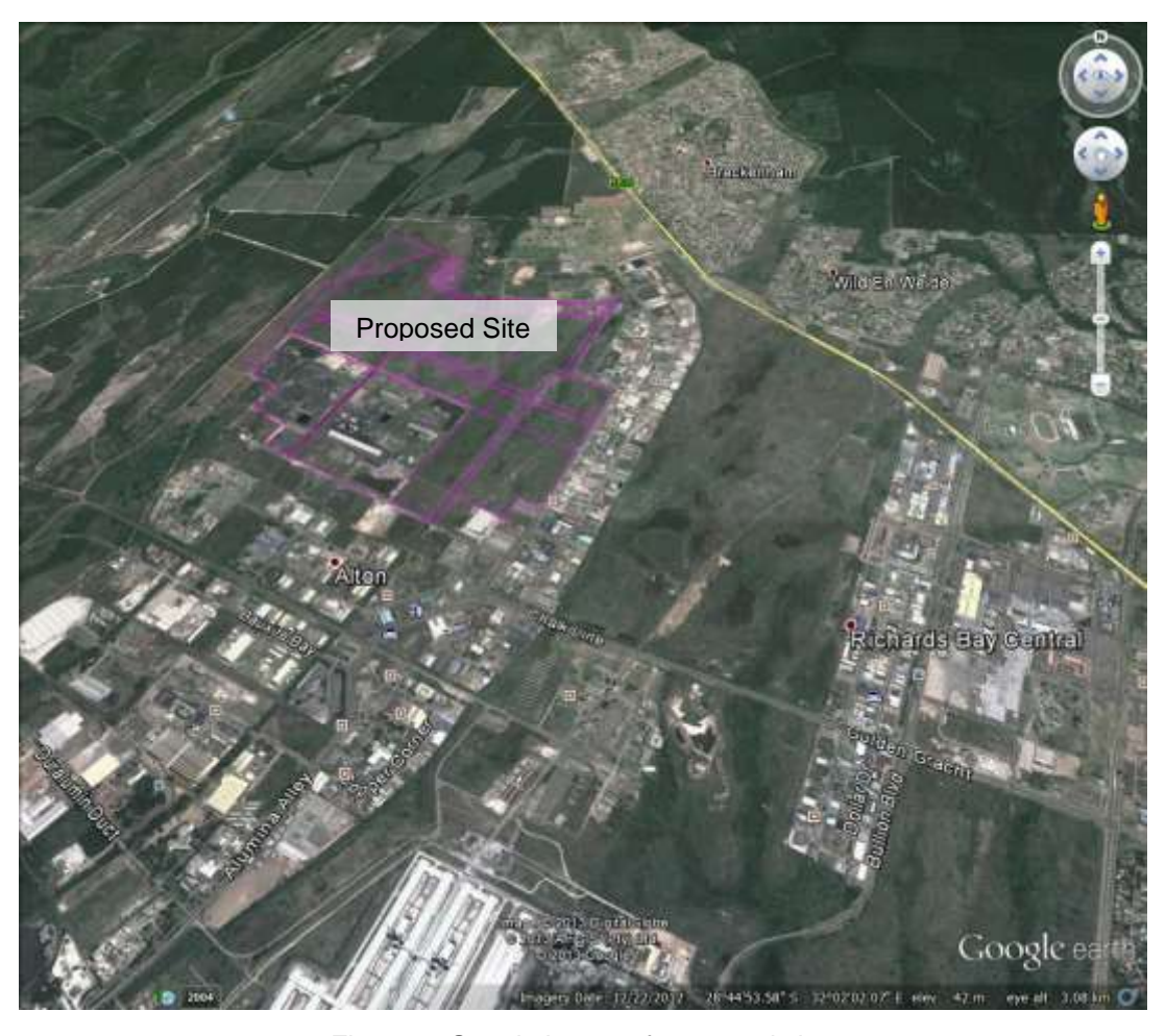
Figure 1: Google image of proposed site.

Phase 1F is located in the Richards Bay industrial area known as Alton North (Coordinates: 28° 44′ 41.92" S / 32° 02′ 00.67"E). The land is currently vacant, borders Tata Steel on the South and zoned as general industrial.