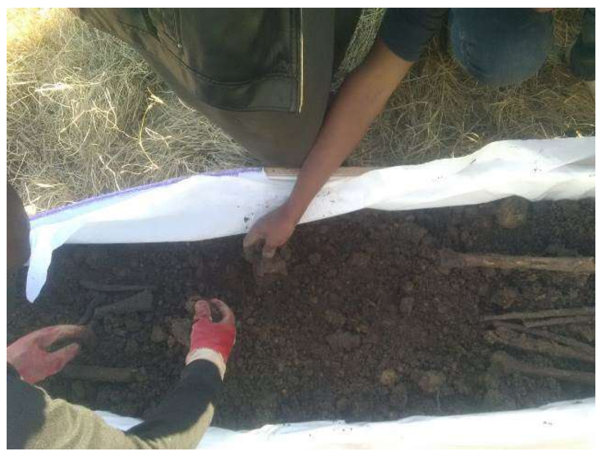
Figure 4: The mortal remains of the late Lletsa Jim Tsotetsi placed in the new coffin for reburial.