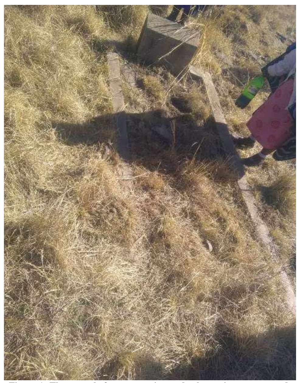
Figure 1: The grave before excavation and exhumation commenced.