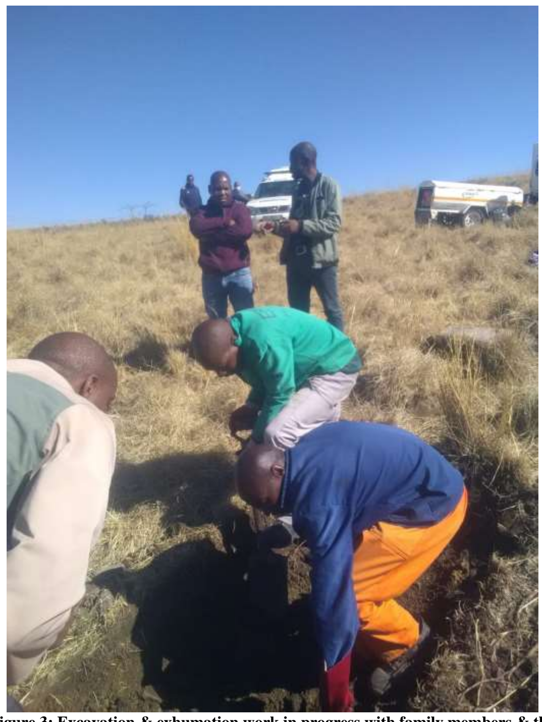
Figure 3: Excavation & exhumation work in progress with family members & the SAP in attendance.