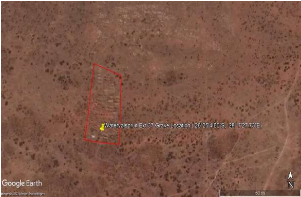
Figure 2: Closer view of the grave site location and footprint. The site was not fenced at the time of documentation (Google Earth 2022).