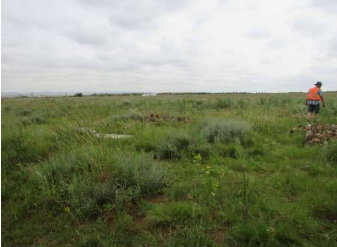
Figure 3: General view of the site in January 2022.