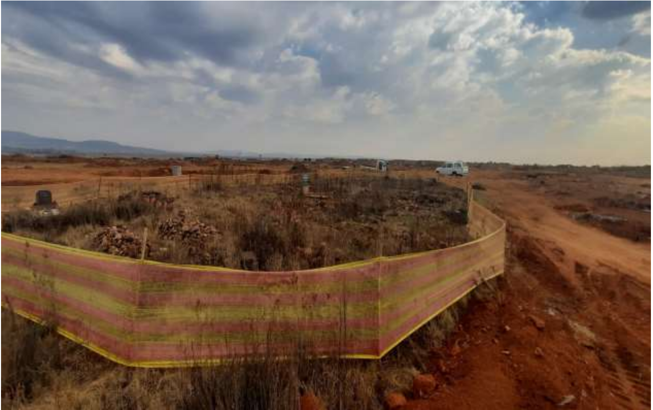
Figure 5: A view of the demarcated site in August 2022. All the individual grave markers had been removed prior to work being undertaken.