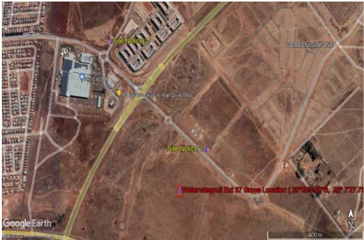
Figure 1: General location of the grave site. The positions of the site notices in relation to the site are also indicated. Each grave was also individually marked prior to the exhumation work (Google Earth 2022).