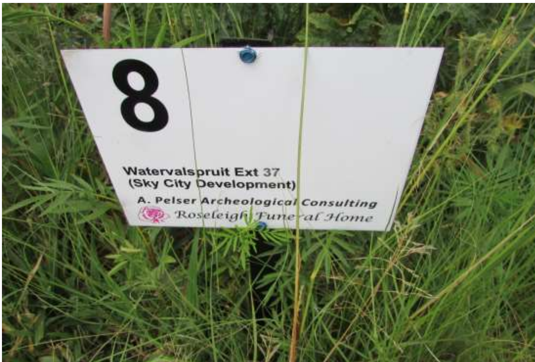
Figure 4: Example of the individual grave markers used to document the graves in January 2022.