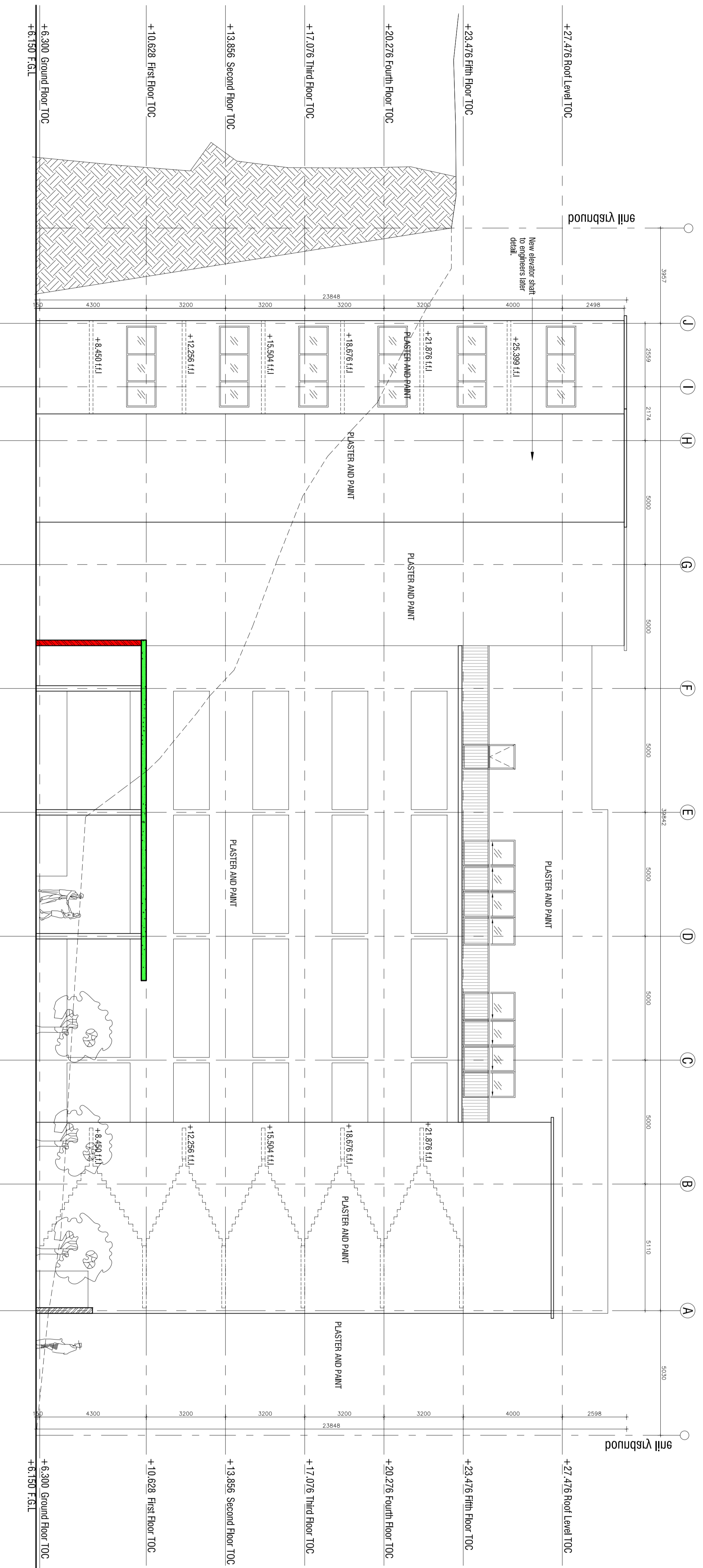
SOUTH EAST ELEVATION Scale 1:100