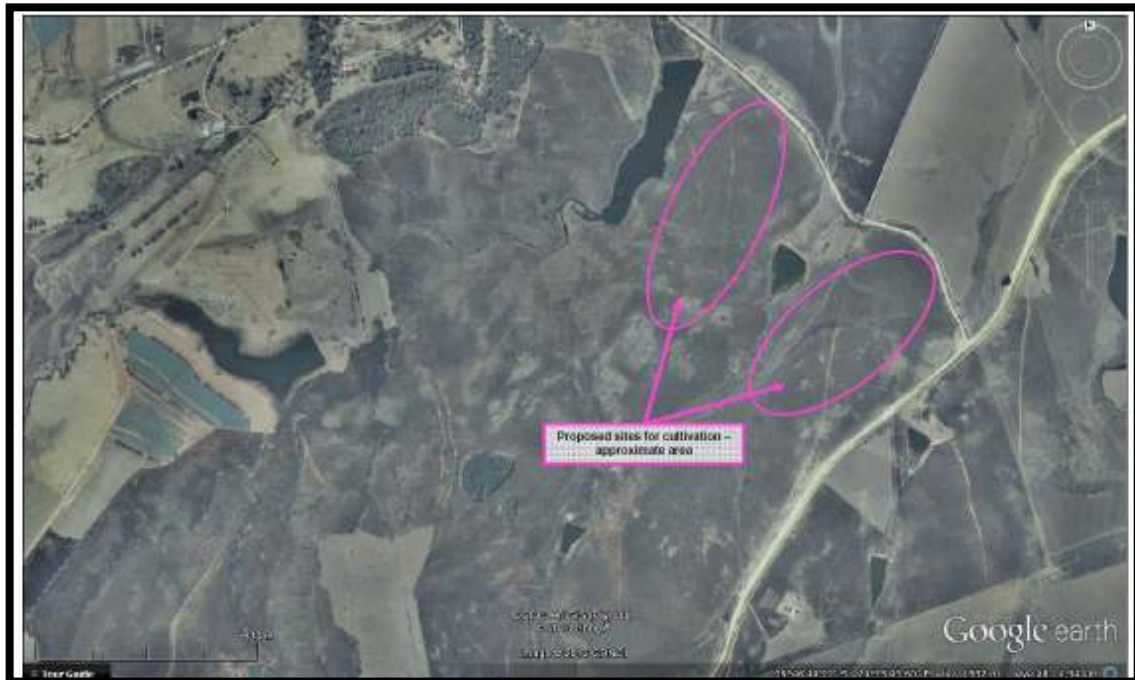
Figure 2. Google aerial photograph showing the location of the proposed cultivation sites on the Farm Riverlea near Underberg.