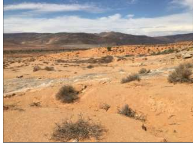
Figure 34. Proposed pipeline route from Kommagas to Buffelsrivier