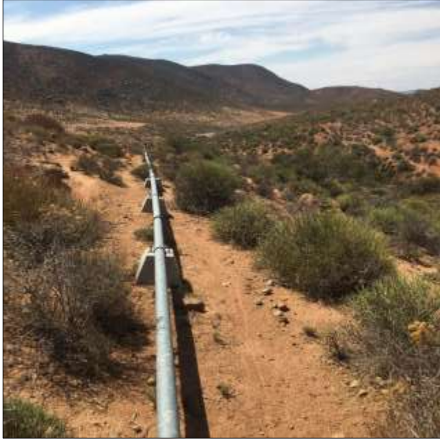
Figure 27. Pipeline from Kommagas to Buffelsrivier