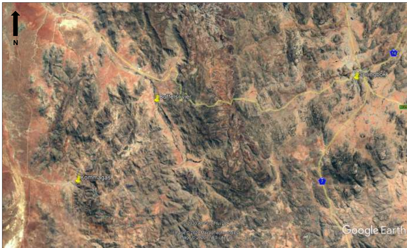
Figure 2. Google satellite map illustrating the project area in relation to Springbok. The two villages affected by the project are Kommagas and Buffelsrivier