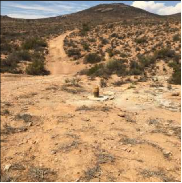
Figure 21. BH KG19-DT1