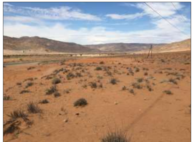
Figure 36. Proposed pipeline route from Kommagas to Buffelsrivier