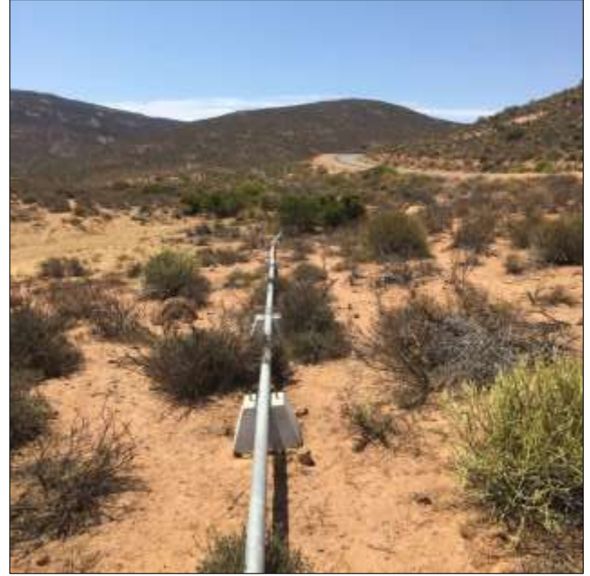
Figure 13. Pipeline from Kommagas to Buffelsrivier