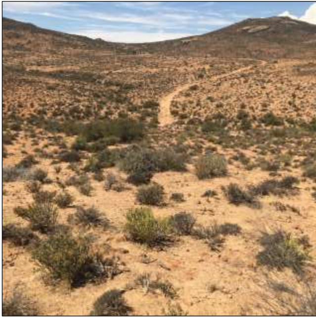
Figure 20. Pipeline route to BH KG19-DT1