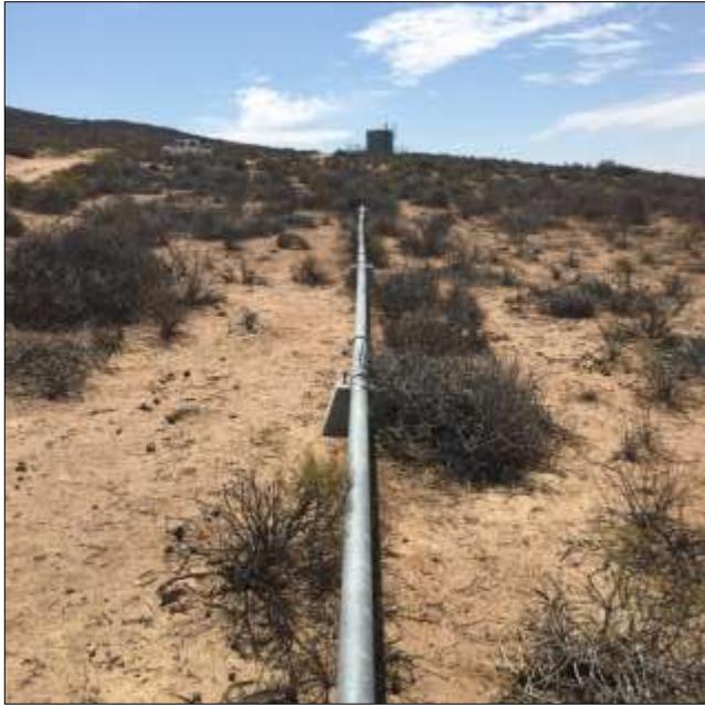
Figure 23. Balancing Reservoir No. 3 in the distance