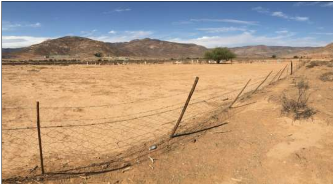
Figure 57. Large, fenced off cemetery (Waypoint 1819) on the outskirts of Buffelsrivier.

No graves, or typical grave features such as stone cairns were encountered during the study. A large fenced off cemetery (Waypoint 1819) was noted to the north of the DR2955 a few kilometers before one enters the village of Buffelsrivier, outside the alignment of the proposed new pipeline (Figure 57).