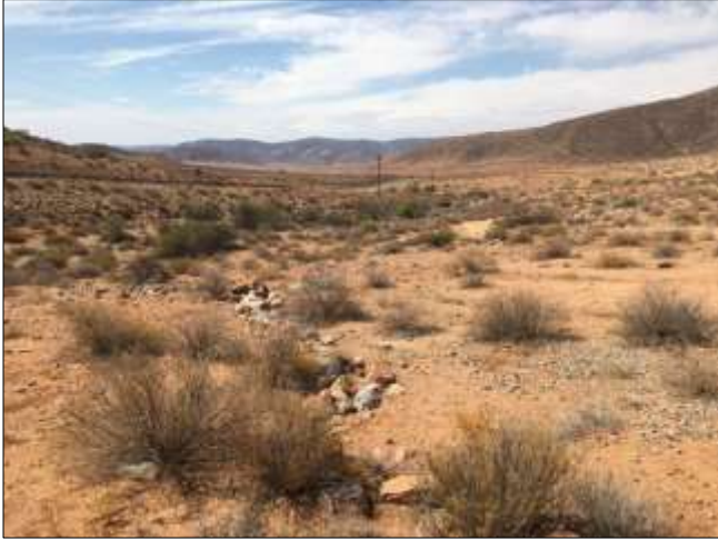
Figure 31. Proposed pipeline route from Kommagas to Buffelsrivier