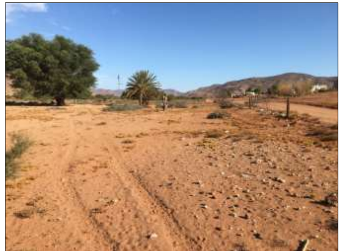
Figure 47. Proposed pipeline route to Buffelsrivier