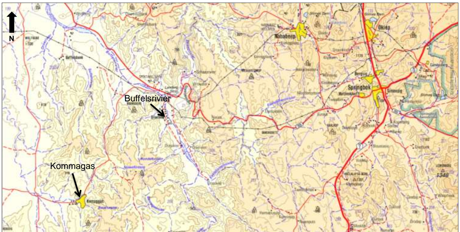
Figure 1. 1:250 000 Locality map (Map Sheet No. 2916. Chief Directorate: National Geo-Spatial Information).

Enviroafrica is the appointed independent Environmental Assessment Practitioner responsible for facilitating the Environmental Impact Assessment (EIA) process for Environmental Authorisation.