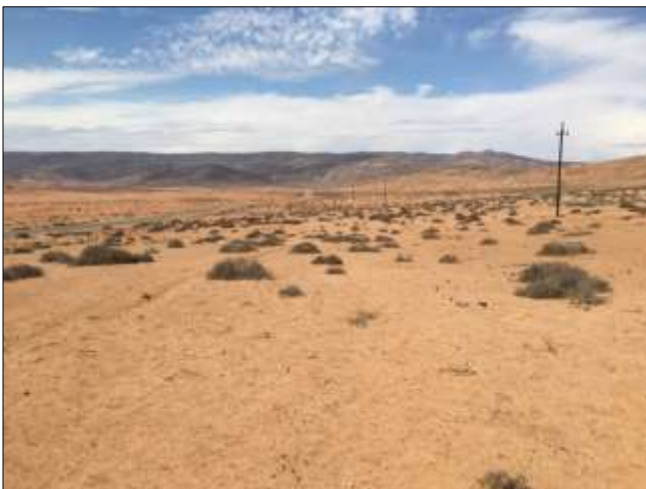
Figure 33. Proposed pipeline route from Kommagas to Buffelsrivier. Note the Eskom servitude