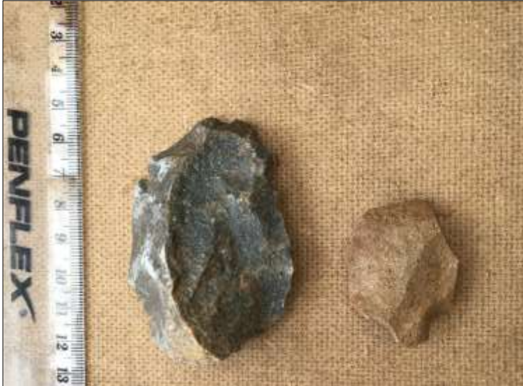
Figure 56. Waypoints 2217 & 1919. Ruler scale is in cm