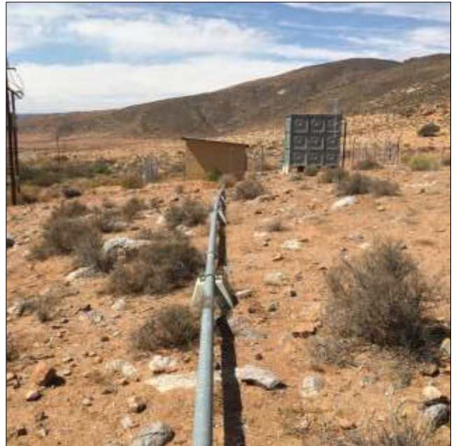
Figure 30. Voorberg Pump Station & Reservoir No. 2