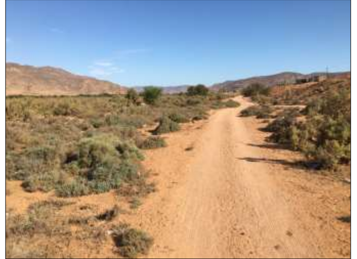
Figure 45. Proposed pipeline route to Buffelsrivier