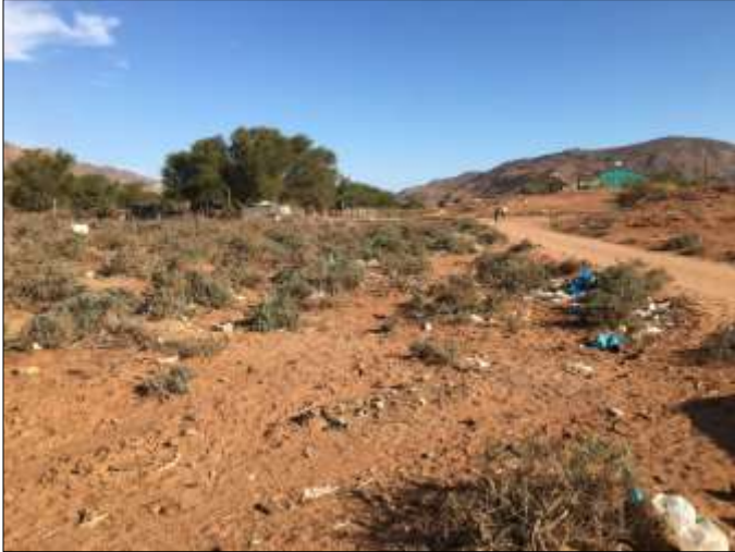
Figure 48. Proposed pipeline route to Buffelsrivier