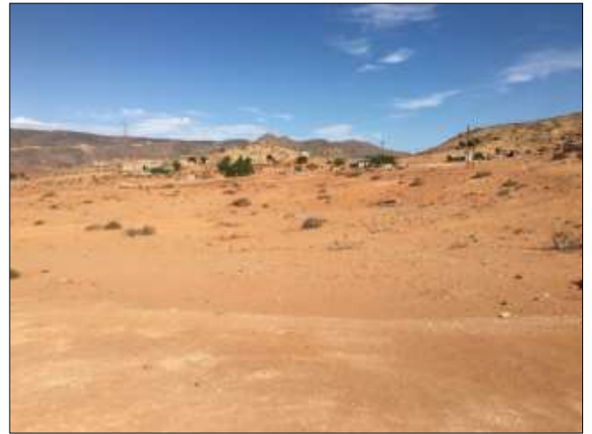
Figure 42. Proposed route from Kommagas to Buffelsrivier