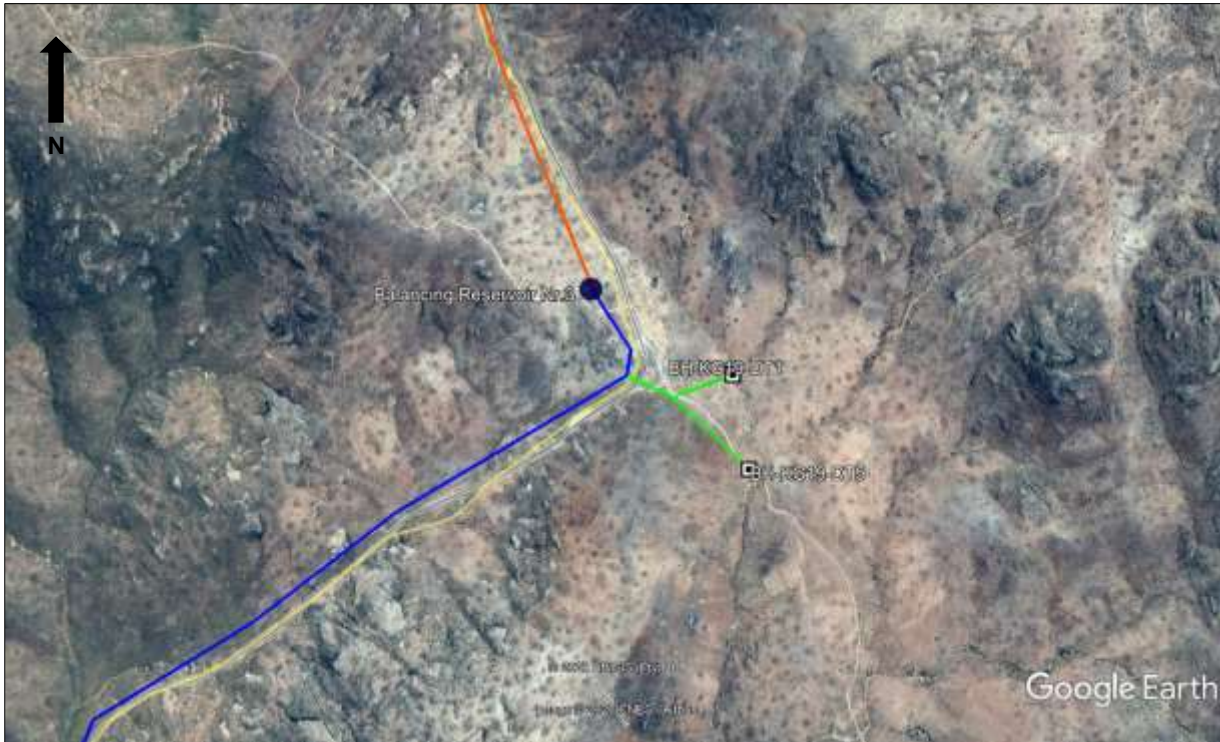
Figure 5. Kommagas Water Supply Project: Proposed new infrastructure