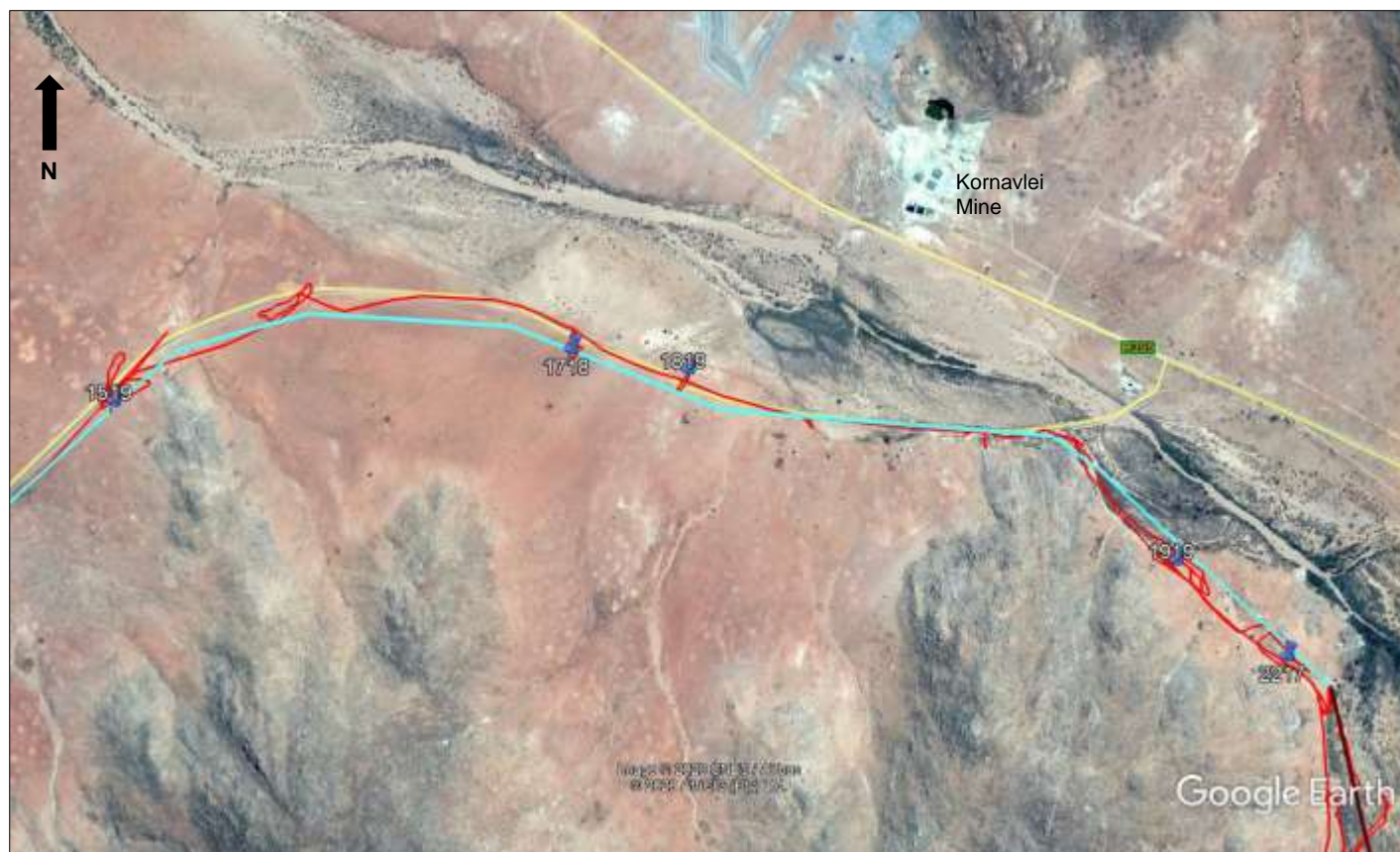
Figure 51. Track paths (in red) and waypoints of archaeological finds