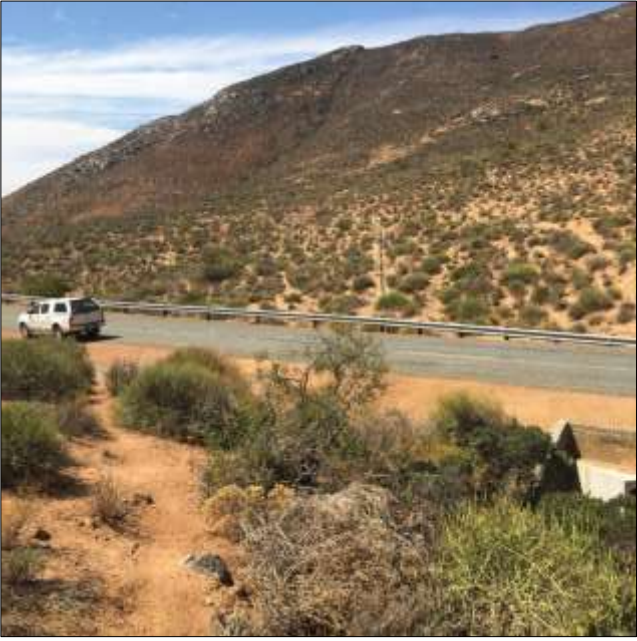
Figure 26. Pipeline from Kommagas cross the road (under the culvert) to Buffelsrivier