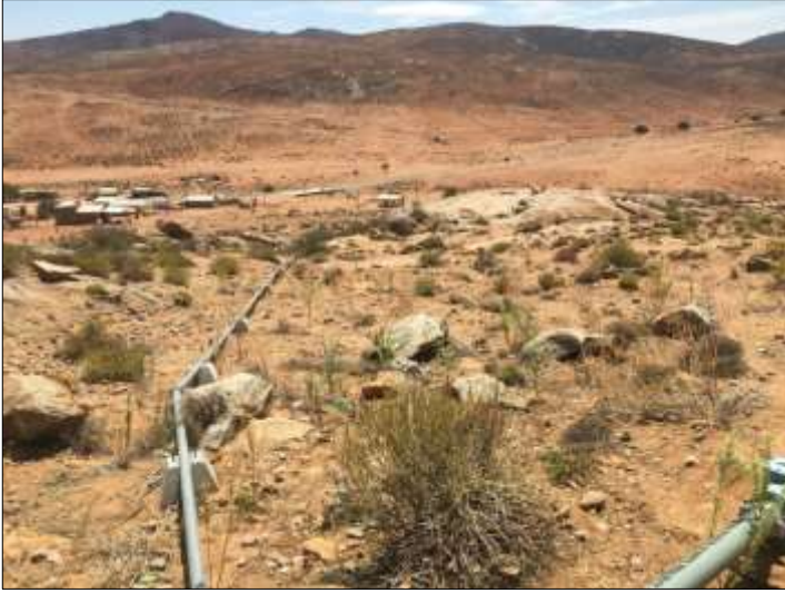
Figure 7. Pipeline in Kommagas