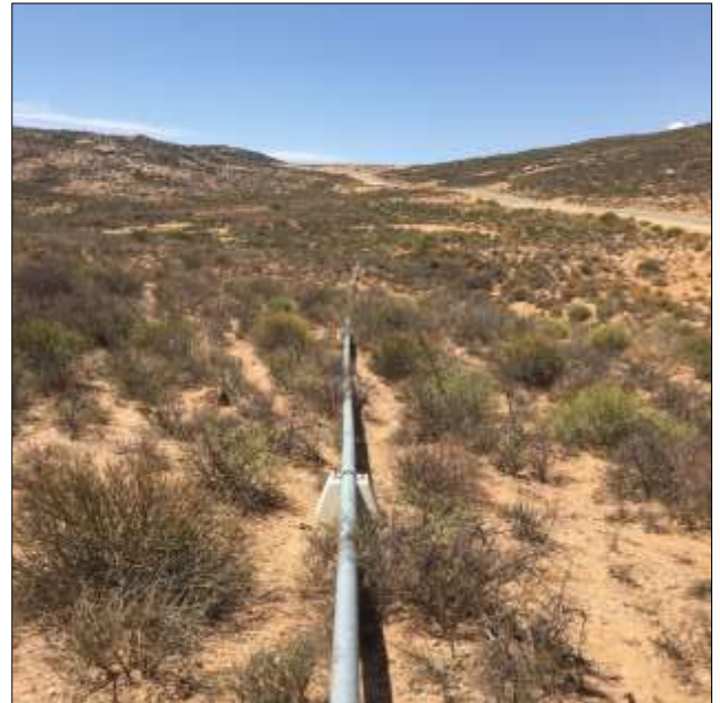
Figure 14. Pipeline from Kommagas to Buffelsrivier