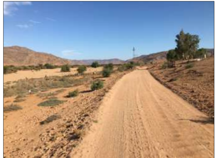
Figure 46. Proposed pipeline route to Buffelsrivier