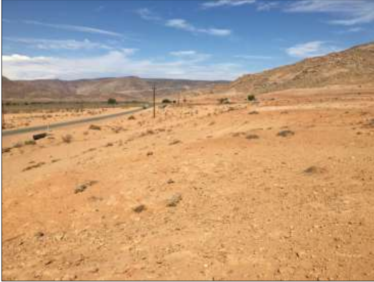
Figure 52. Waypoint 1519. Context in which the remains were found.