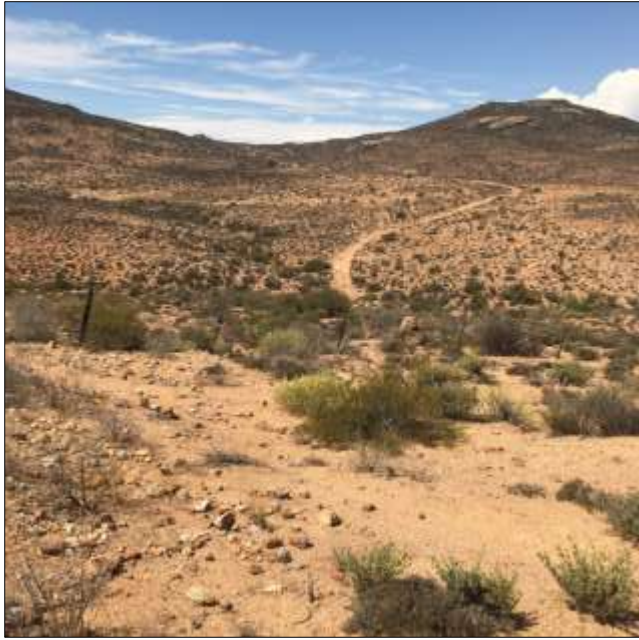
Figure 19. Pipeline route to BH KG19-DT1