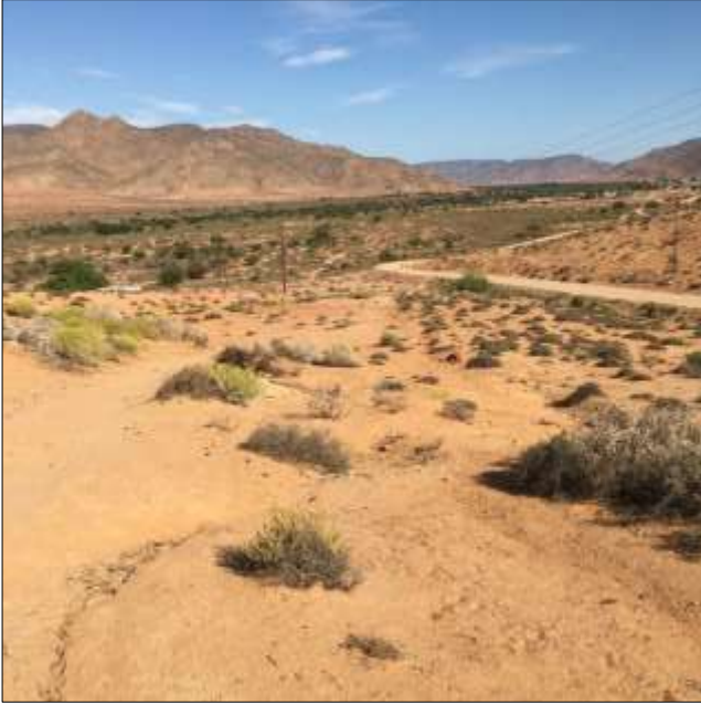
Figure 43. View from the Kwaddas pump station and reservoir to Buffelsrivier