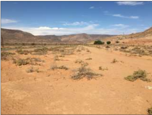
Figure 38. Proposed route from Kommagas to Buffelsrivier