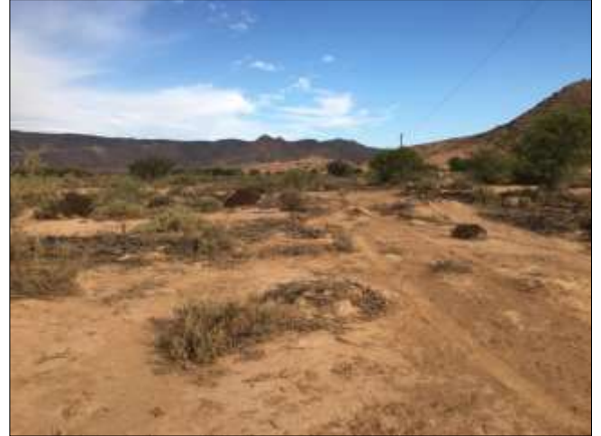
Figure 40. Proposed route from Kommagas to Buffelsrivier