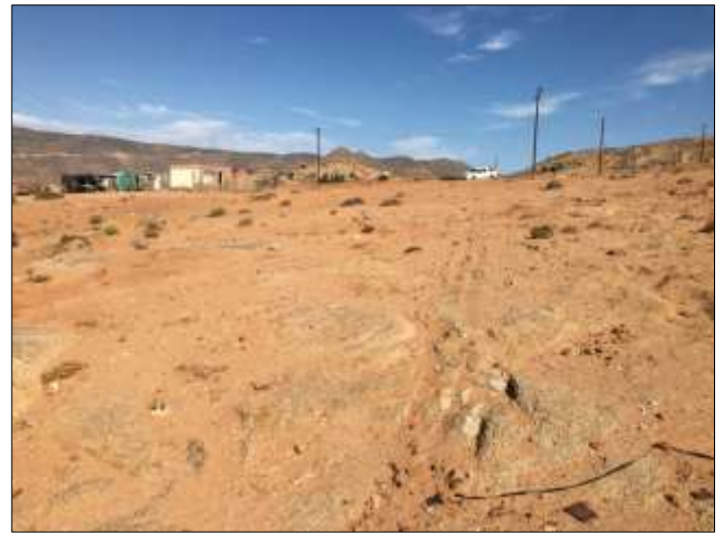
Figure 41. Proposed route from Kommagas to Buffelsrivier