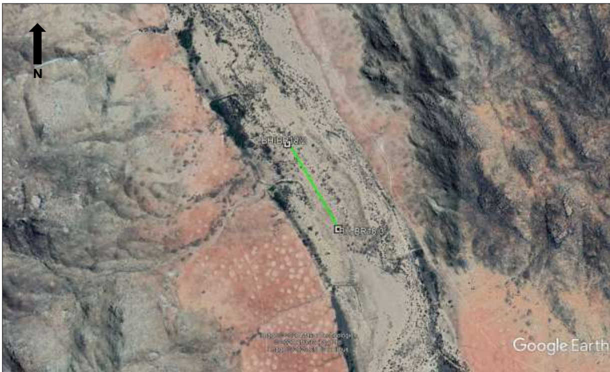
Figure 6. Kommagas Water Supply Project: Proposed new infrastructure