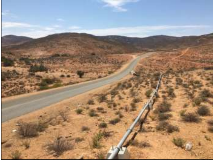
Figure 11. Pipeline from Kommagas to Buffelsrivier