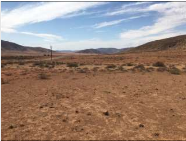
Figure 32. Proposed pipeline route from Kommagas to Buffelsrivier. Note the Eskom servitude