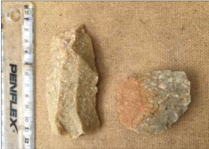
Figure 53. Tools from waypoint 1519. Ruler scale is in cm