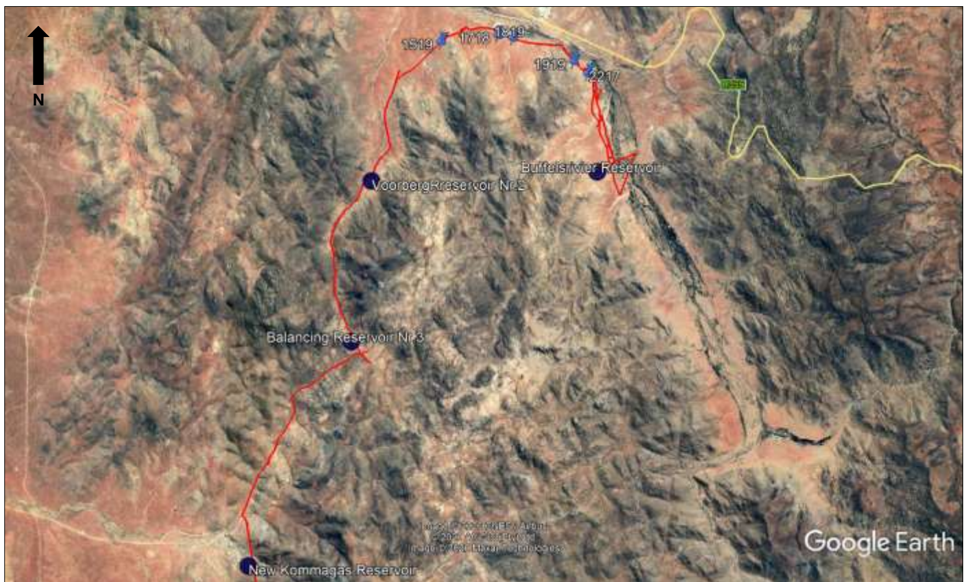
Figure 50. Track paths (in red) and waypoints of archaeological finds

Previous archaeological assessments undertaken in the vicinity of the proposed development, has also noted the low density of archaeological resources in the surrounding landscape (CTS Heritage 2016; Deacon 2004, Van Pletzen-Vos & Rust 2011; Dreyer 2002).