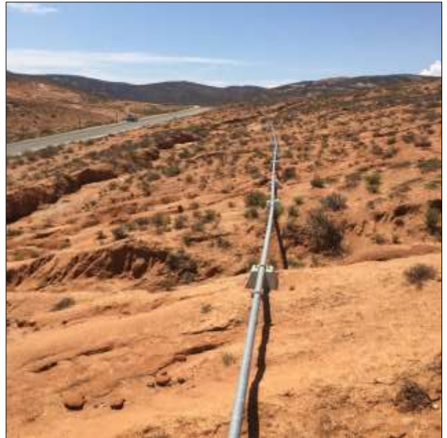
Figure 10. Pipeline from Kommagas to Buffelsrivier