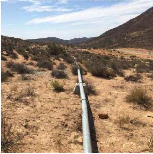
Figure 24. Pipeline from Kommagas to Buffelsrivier