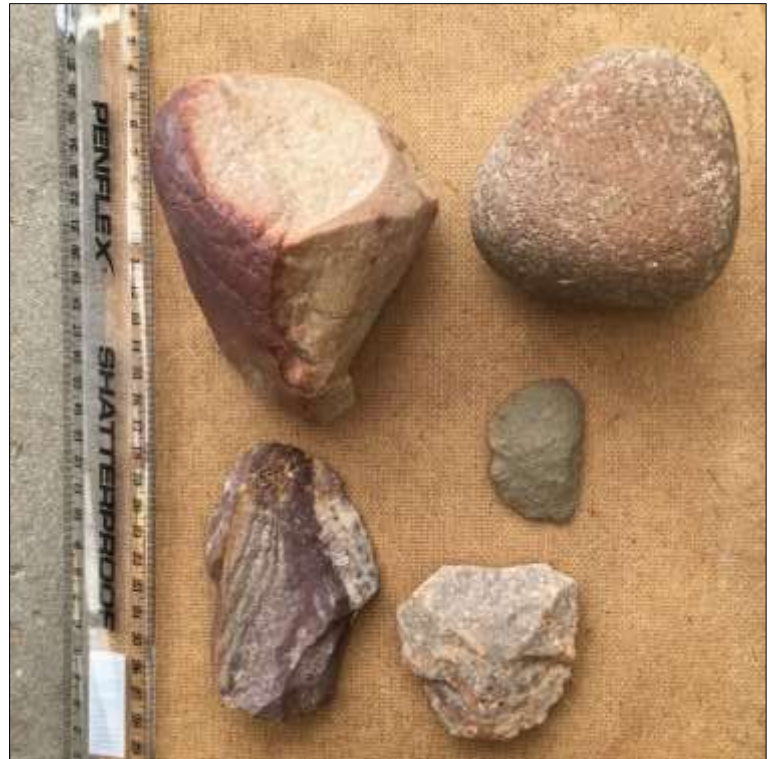
Figure 55. Waypoint 1718. Scale is in cm