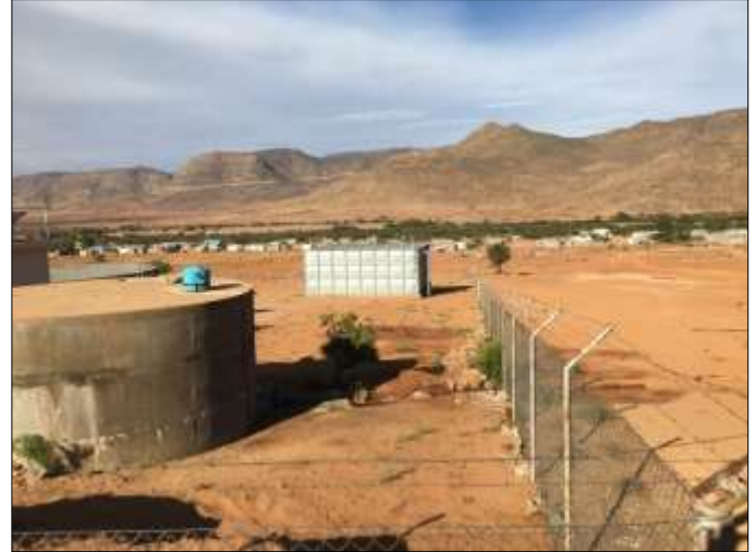
Figure 49. View facing east from the Buffelsrivier Reservoir to the village of Buffelsrivier