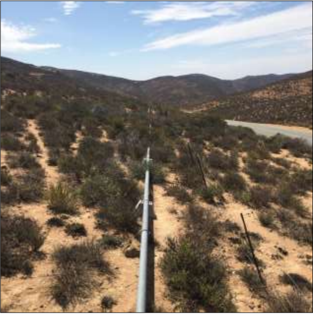
Figure 25. Pipeline from Kommagas to Buffelsrivier