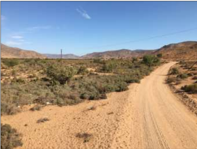
Figure 44. Proposed pipeline route to Buffelsrivier