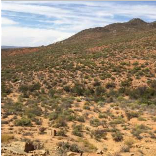
Figure 28. Pipeline from Kommagas to Buffelsrivier