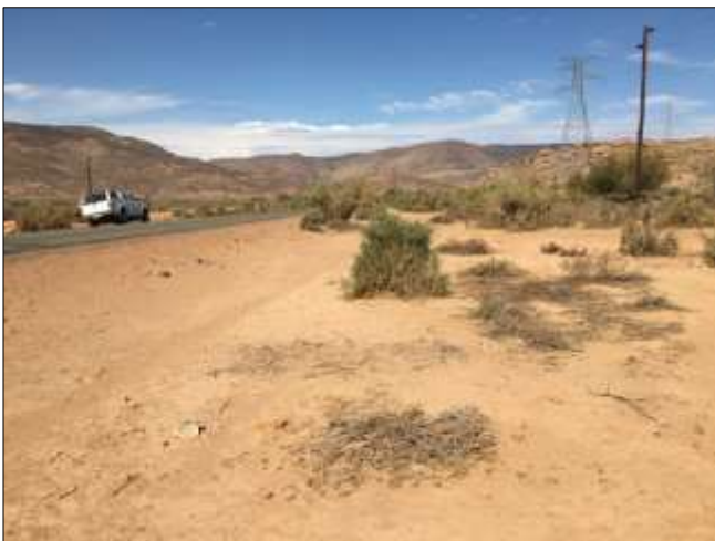
Figure 39. Proposed pipeline route from Kommagas to Buffelsrivier