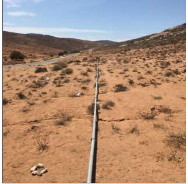
Figure 9. Pipeline from Kommagas to Buffelsrivier