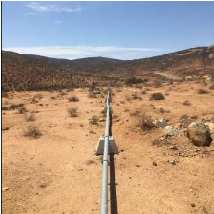
Figure 12. Pipeline from Kommagas to Buffelsrivier