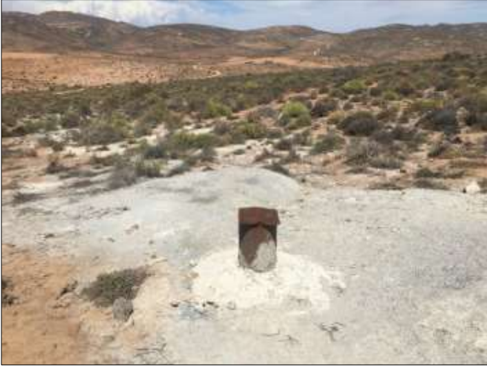
Figure 15. Refurbished borehole/pipeline route to BH KG19-DT5