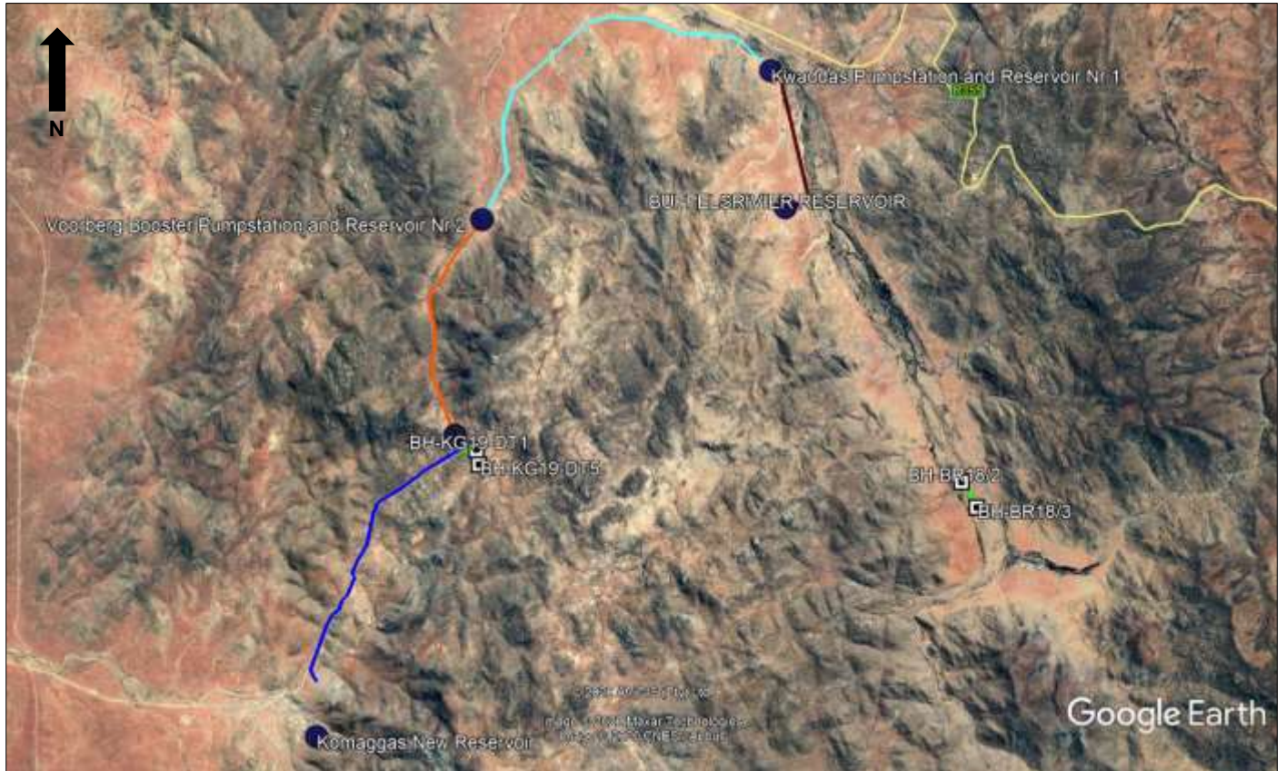
Figure 3. Kommagas Water Supply Project: Proposed infrastructure