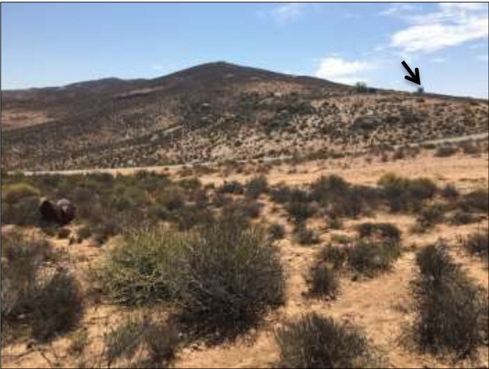
Figure 22. Arrow indicates Balancing Reservoir No. 3