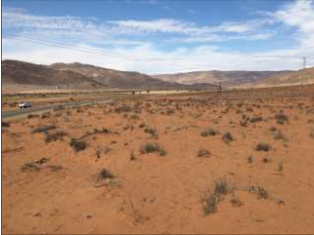
Figure 37. Proposed route from Kommagas to Buffelsrivier