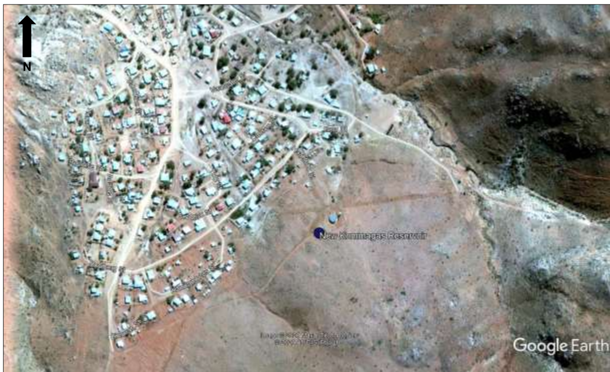
Figure 4. Kommagas Water Supply Project: Proposed new infrastructure