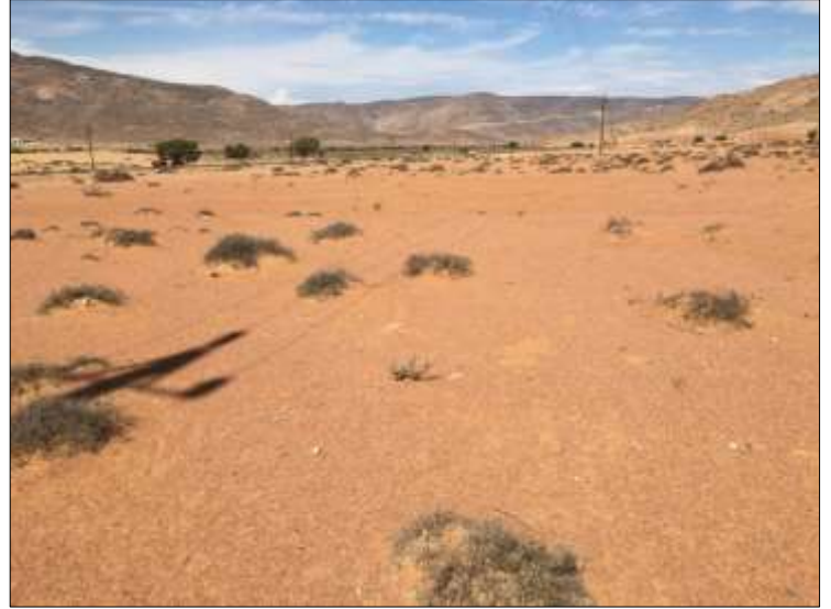
Figure 54. Waypoint 1718. Context in which the remains were found