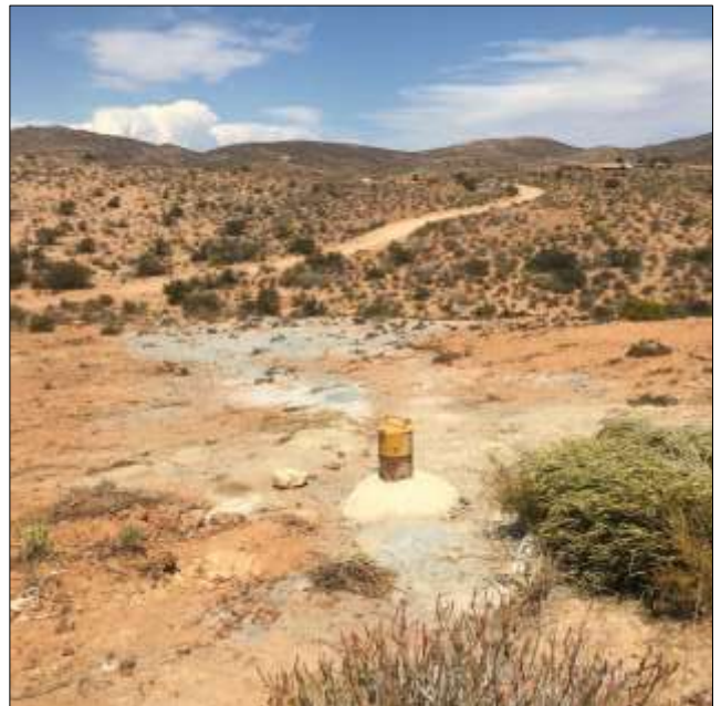
Figure 18. BH KG19-DT5