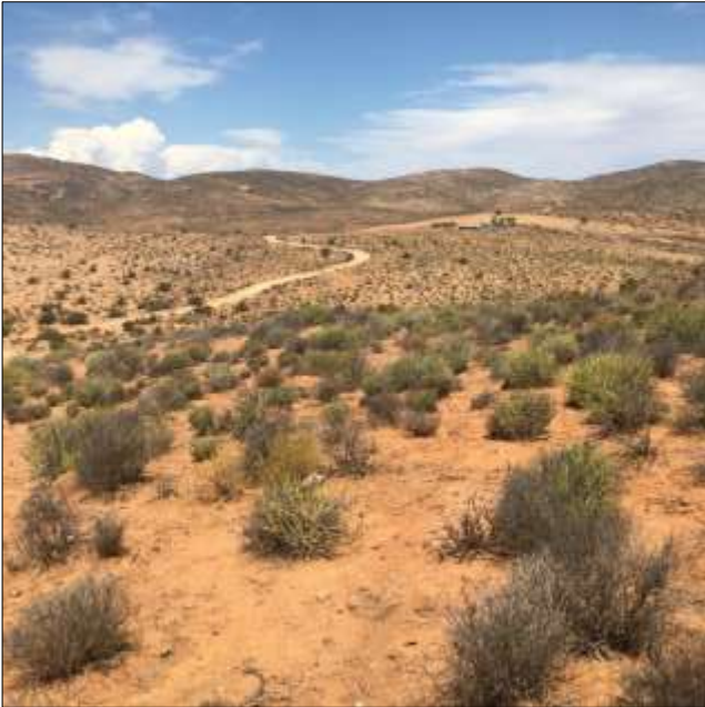
Figure 16. Pipeline route to BH KG19-DT5