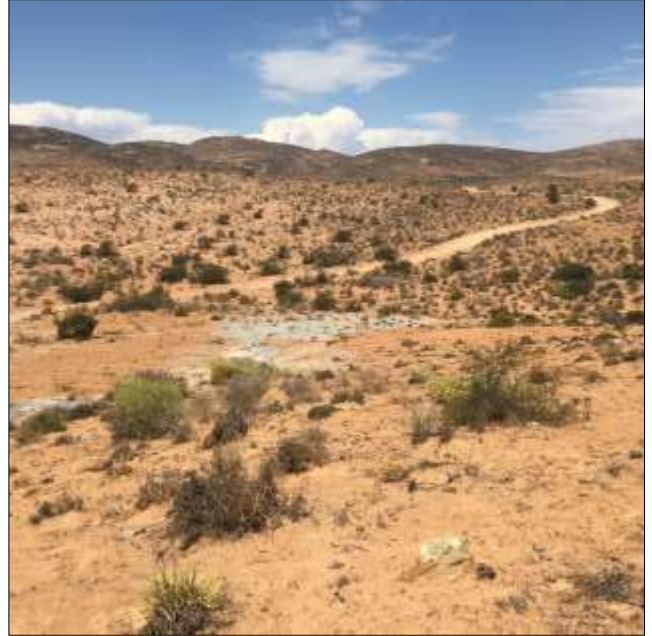
Figure 17. pipeline route to BH KG19-DT5