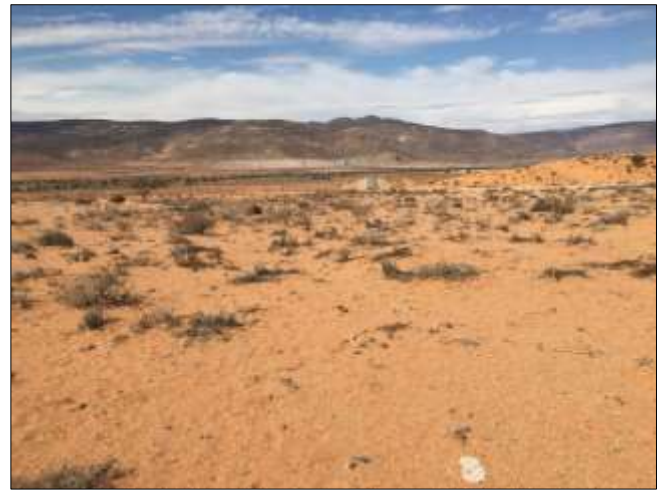
Figure 35. Proposed pipeline route from Kommagas to Buffelsrivier