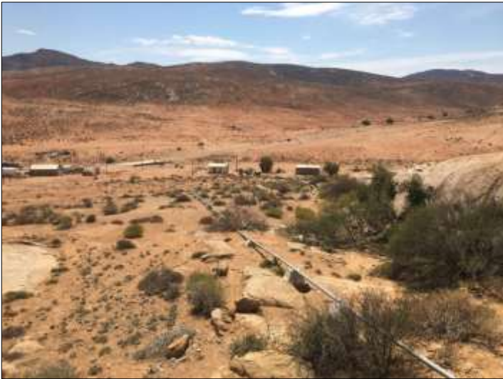
Figure 8. Pipeline in Kommagas