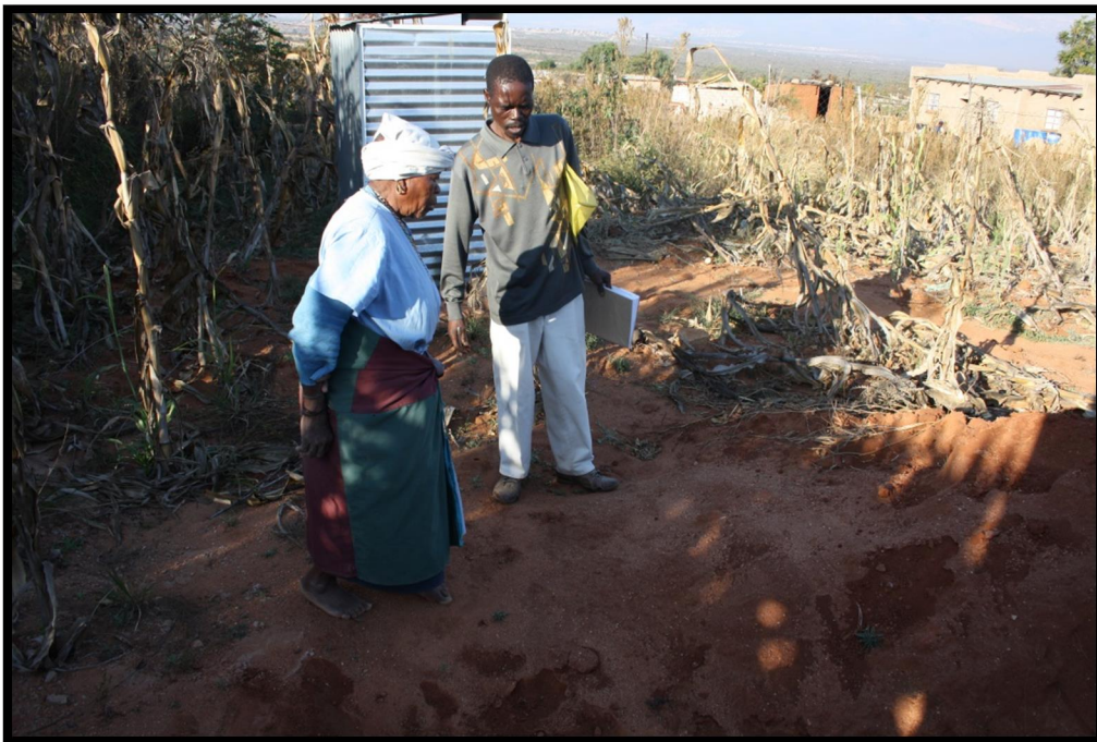
Figure 2: Site 002, indicated by mound of soil, the area was indicated by an old lady who is the owner of the stand. GPS co-ordinates South 24°.02, 06'. 86", and East 29°.39'.37.76".