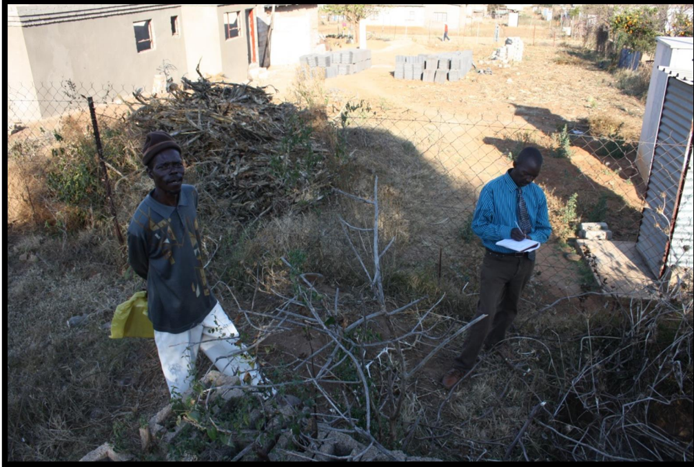
Figure 1: View of site 001 where human remains were unearthed, here are member of the tribal council showing where they noted remains. GPS co-ordinates South 24°. 02, 21'05", and East 29°.39'.55.61"