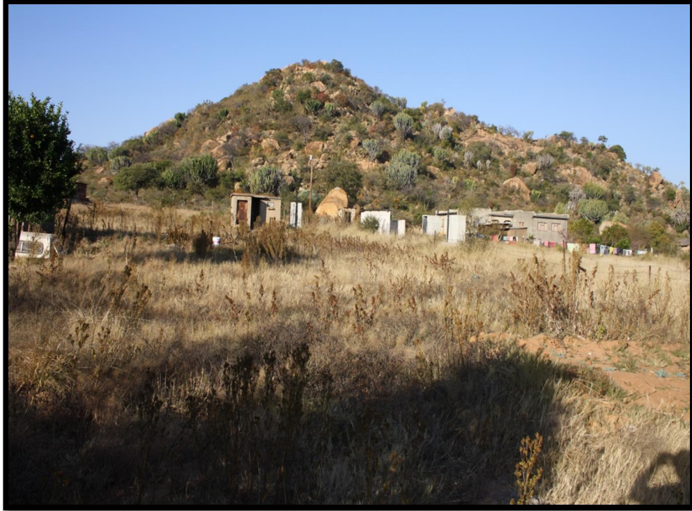
Figure 3: View of site 003, indicated by an arrow where the third human remains were uncovered. GPS co-ordinates (GPS) South 24°.02, 21ø22", and East 29°.39'.30.16".