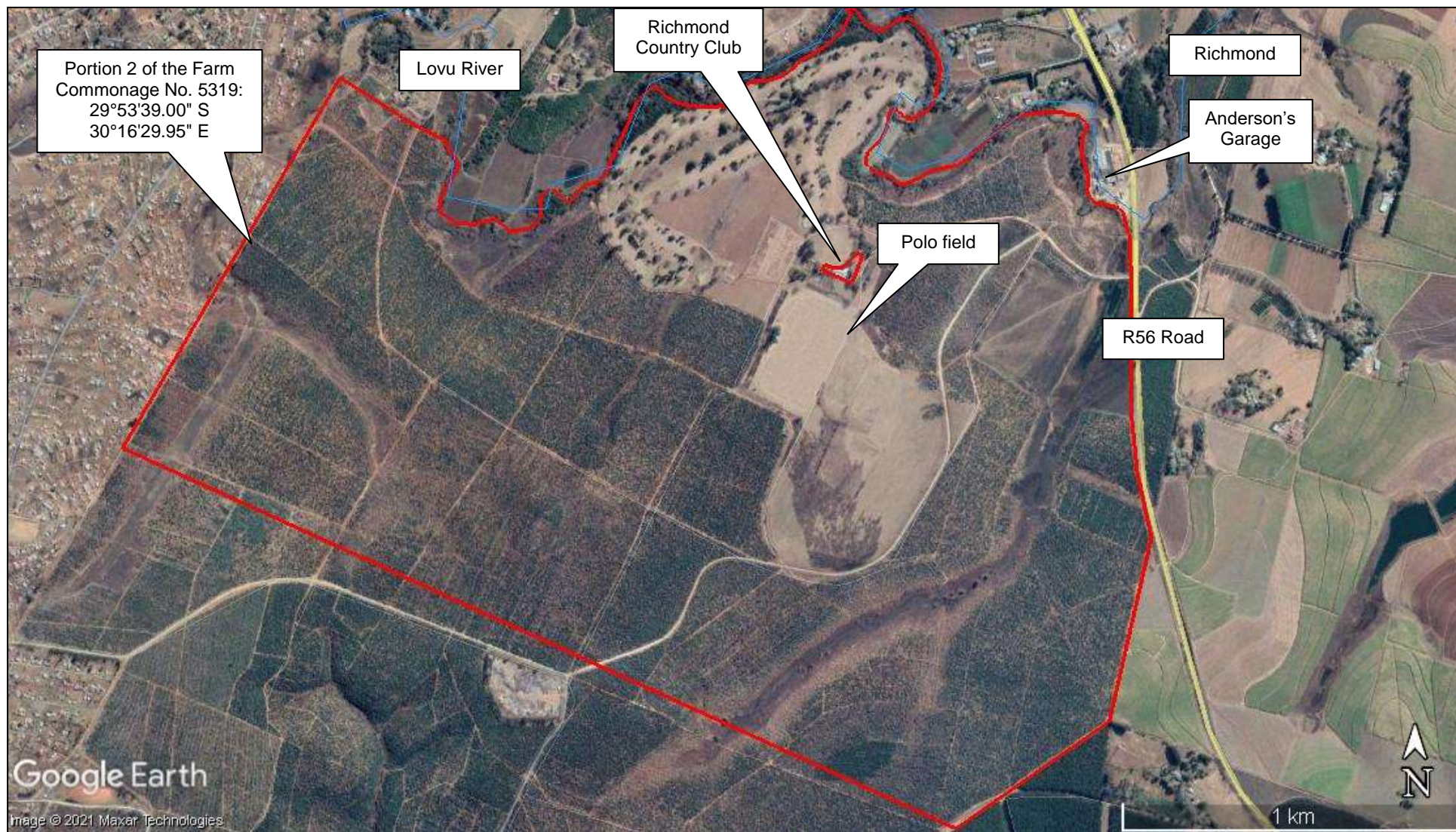
Figure 2: Map showing the proposed project, Richmond, KwaZulu-Natal.