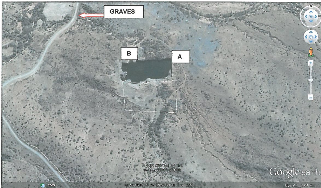
Map 3 Existing quarry at Rietfontein 159 near Somerset East, Eastern Cape. Locality of the graves and the placing of the GPS coordinate points.