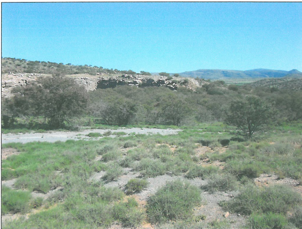
Fig.1 Proposed area of extension at the quarry, Rietfontein 159, Somerset East.