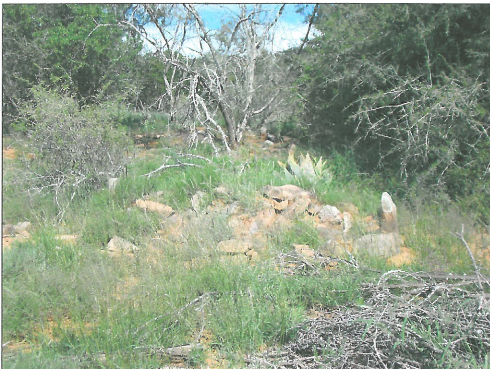
Fig.5 Graves near the quarry at Rietfontein 159, Somerset East.