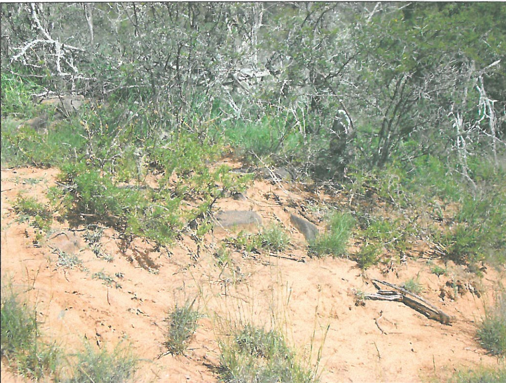
Fig.7 Graves near the quarry at Rietfontein 159, Somerset East.