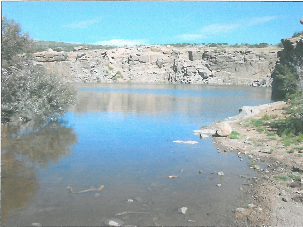
Fig.4 Point B at the quarry, Rietfontein 159, Somerset East.