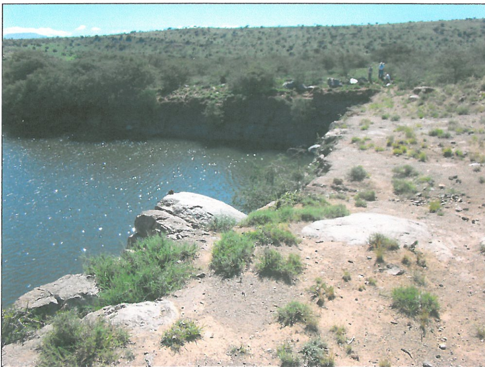
Fig.3 Existing quarry at Rietfontein 159, Somerset East. Facing Point A.