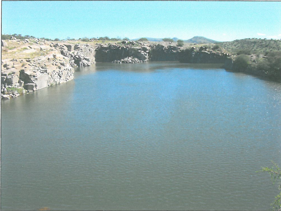
Fig.2 Point A next to the quarry at Rietfontein 159, Somerset East. Facing Point B.