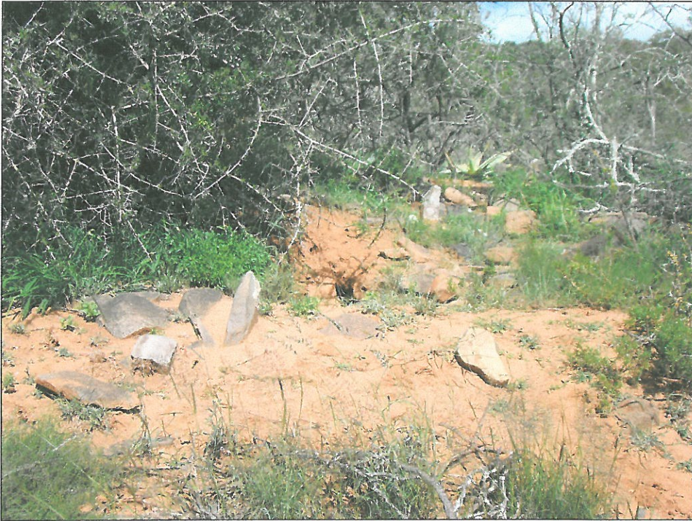
Fig.6 Graves near the quarry at Rietfontein 159, Somerset East.