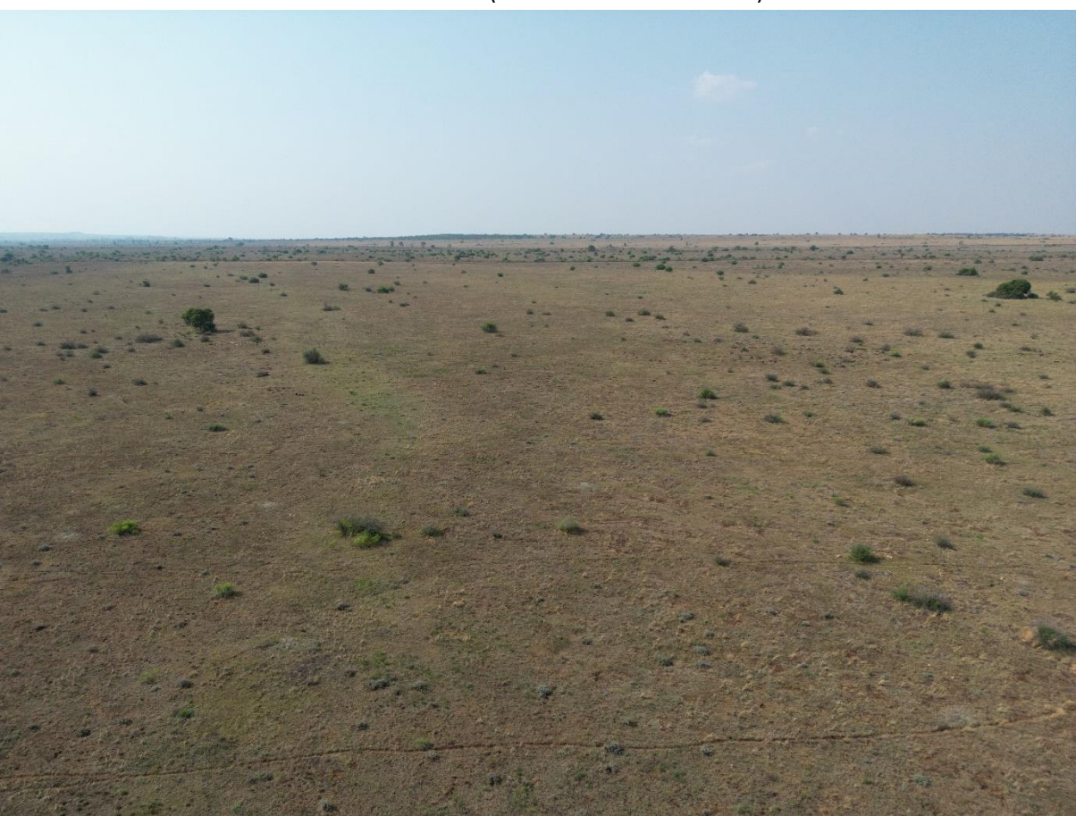
Plate 1: The site (taken towards the north)