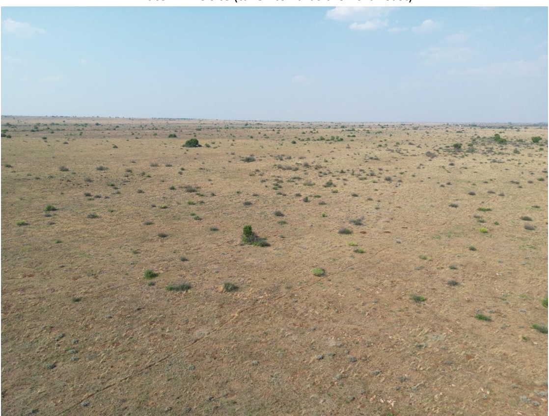
Plate 2: The site (taken towards the north east)